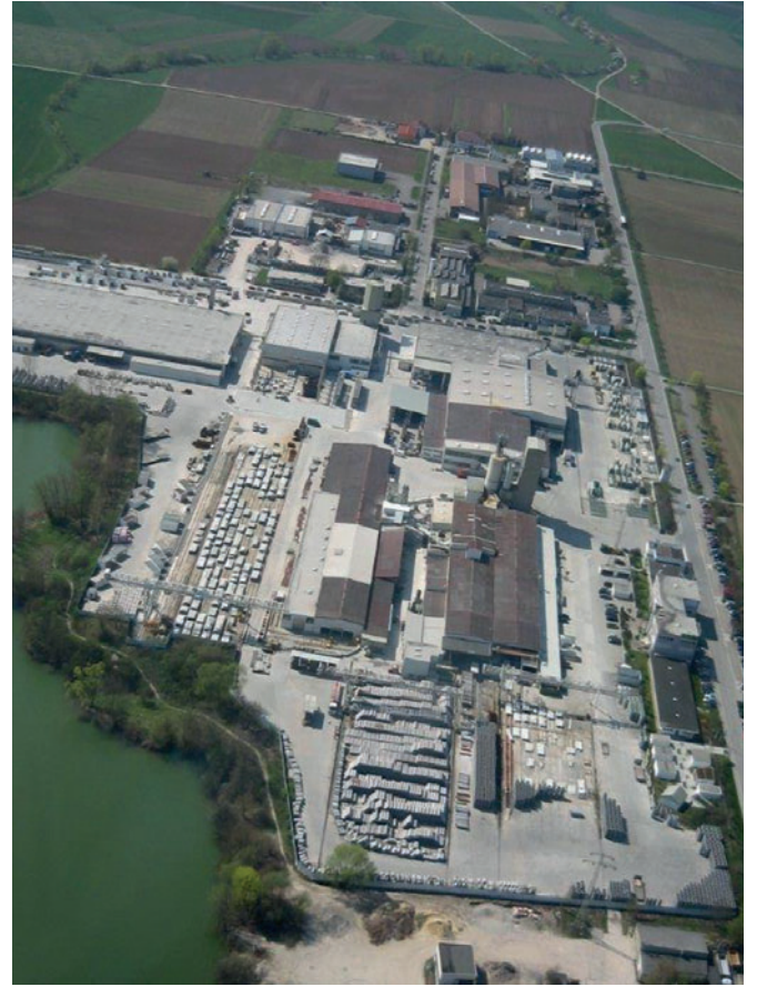
The site in Tübingen Hirschau is the center of added value created by concrete component production at the traditional Swabian company

A forward-looking approach in the automotive sector requires that all global suppliers intensively analyse alternative driving concepts and explore the possibilities of driverless road vehicles and corresponding assistance systems. Daimler is rising to this challenge and will be able to simultaneously monitor and analyse up to 400 vehicles on the newly created test track. A forward-looking approach in the precast concrete component sector for pipeline construction, on the other hand, re-