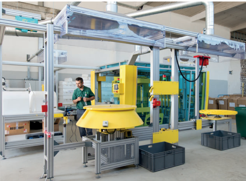
Globally tried and tested production technology now used at Beton Kemmler - image shows the EPS cutting technology