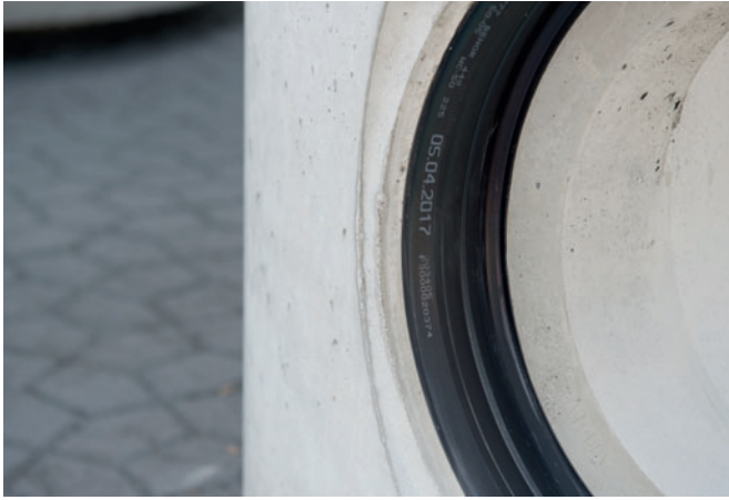
Production in a cast using SCC guarantees a solid connection between the integrated gasket and the concrete manhole base

and technical criteria, which are key to a strategic investment decision, Kemmler decided to invest in the Perfect manhole system offered by the Austrian manufacturer, Schlüsselbauer.