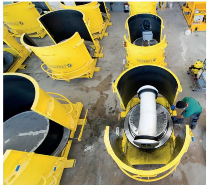
The negative EPS channels are inserted into easy-to-operate moulds and produced overnight in the mould