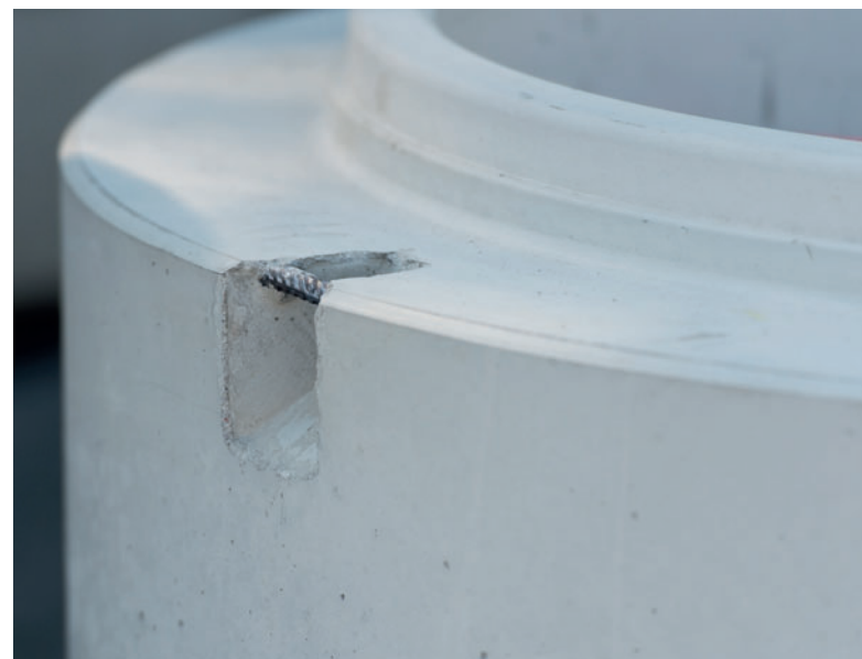
Built-in lifting aids ensure safe handling for use on site