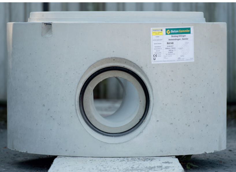
One of the first Perfect manhole bases produced by Beton Kemmler - produced in A1 quality with no rejected parts from the very beginning

Kemmler Baustoffe has been established as a full-service provider for construction materials in south-west Germany for more than 125 years. All commonly used engineering and construction products are stocked for business partners and individual clients at 22 locations across Baden-Württemberg and Bavaria. The production of prefabricated garages and numerous concrete products for engineering and construction is based at Beton Kemmler's production site in Tübingen Hirschau. Manhole bases have also been produced here for generations, using the traditional method of manually retrofitting channels made from concrete or other materials. Due to changes in the market and in the quality awareness of engineering, however, customers prompted the decision-makers at the company to get to grips with modern production methods. Following careful consideration of the commercial