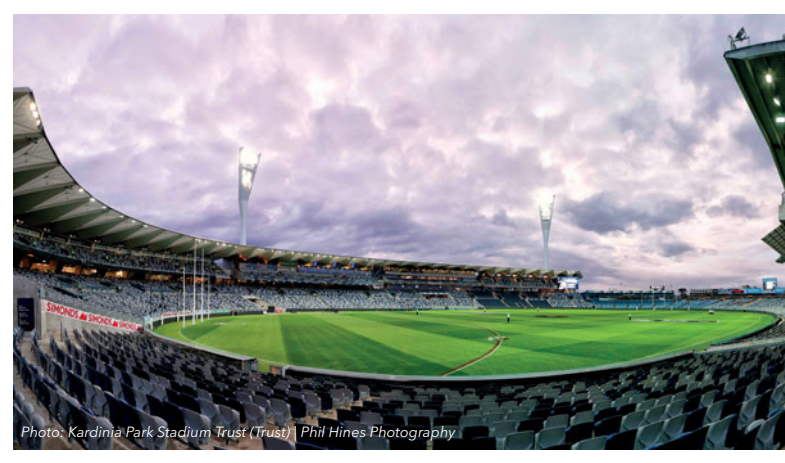
For the Simonds Stadium in Geelong Westkon Precast produced over 8500 m<sup>2</sup> of hollow core slabs and 1250m<sup>2</sup> of the new lower bowl stadium plates.