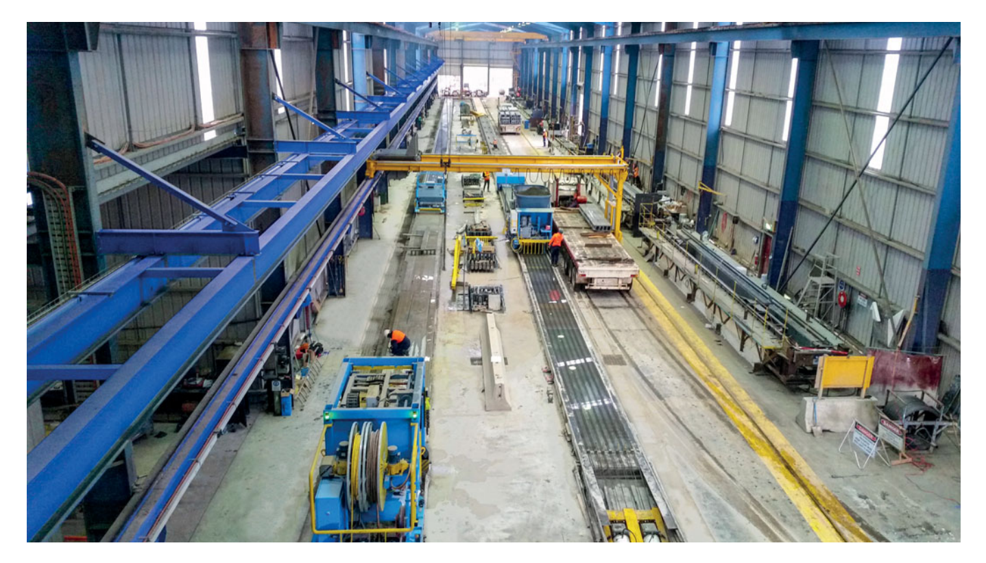
For several months now a Universal Slipformer and the corresponding ancillary equipment for the manufacture of a variety of prestressed concrete products have been in use on the two 150 m long beds: as well as hollow core slab, massive and stadium slabs are produced.