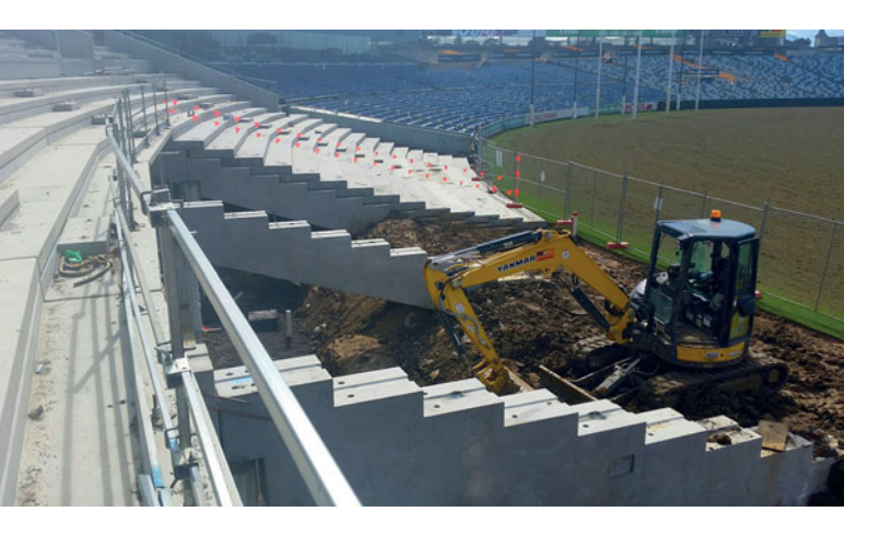
Already, two stadiums have been equipped with the stadium slabs produced by the new slipformer.

Two brand new production units and new mould sets allow Westkon Precast to manufacture a wide range of products. The first production unit is designed for the manufacture of hollow core slabs 1.20 m in width and 20 to 50 cm in height.