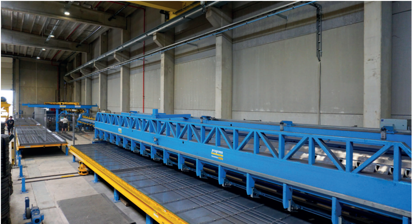
The pallet itself moves transversely below the run-off of the recently installed MSR straightening and cutting machine, in order to incorporate the longitudinal bars in their correct position.