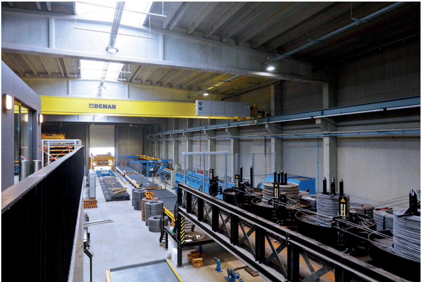
The carousel system was installed in the smallest possible space and has automated significant individual operations.

Eventually, Isodal decided to change the production process and to invest in a carousel plant. "I did not take the decision lightly, for ultimately we are only a very small company," adds Tyron Van Hee. "But we had no other option - we wanted to remain small, but had to increase our output and improve our quality, in order not to lose our connections."