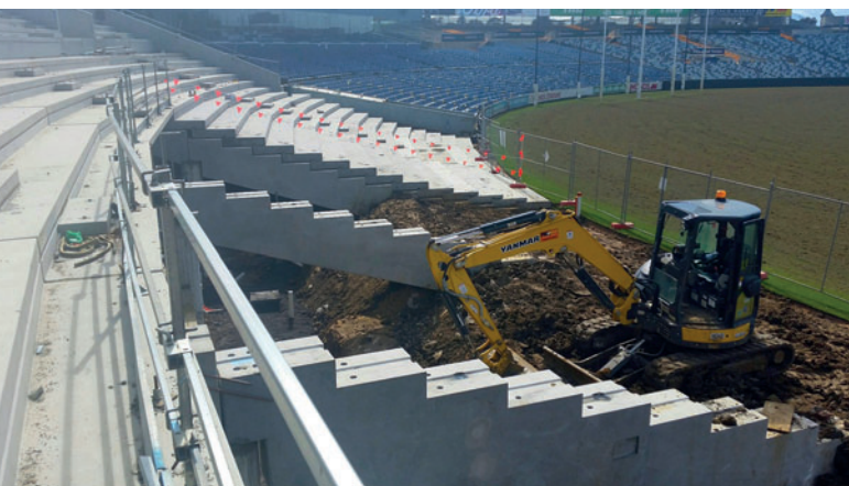
Already, two stadiums have been equipped with the stadium slabs produced by the new slipformer.

Two brand new production units and new mould sets allow Westkon Precast to manufacture a wide range of products. The first production unit is designed for the manufacture of hollow core slabs 1.20 m in width and 20 to 50 cm in height.