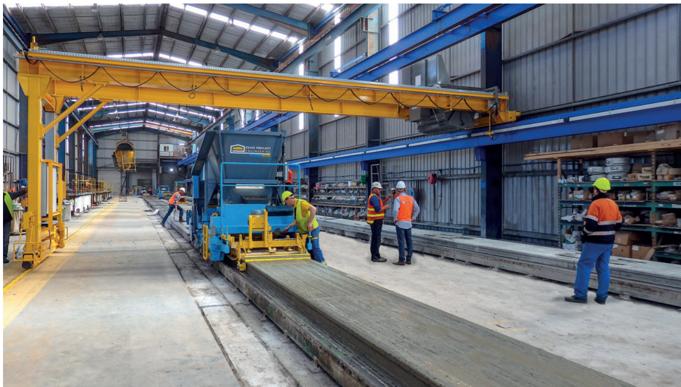
The Universal Slipformer allows Westkon Precast to manufacture hollow core slabs 20 to 50 cm in height.

We were attracted by the flexibility of this machine - it was very important for us to be able to manufacture, using automated equipment, which, in addition to producing hollow core slabs, was able to manufacture new products for the market, such as solid planks and stadium plates."