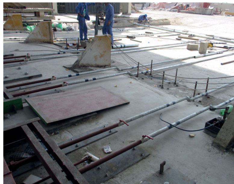
On-grade installation of the ThermalCure hot water supply and return lines and connection to the casting beds.