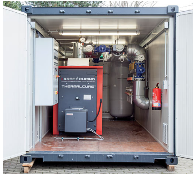
Containerized ThermalCure Accelerated Concrete Curing System pre-installed, pre-plumbed and pre-wired in an insulated, vented and lighted 20-ft. shipping container for immediate installation and quick commissioning.

The company produces hollow-core slabs, cladding and sandwich panels, precast columns, beams and foundations as well as custom precast components, blocks and block paving products. Current projects include 3,558 unit precast villas in Dubai and Abu Dhabi, the Maple townhouses, the AKOYA Oxygen luxury homes, the Nad Al Shaba villas, the Mudon townhouses, the Yas Island villas and the ADNOC Ruwais Housing Complex Expansion.