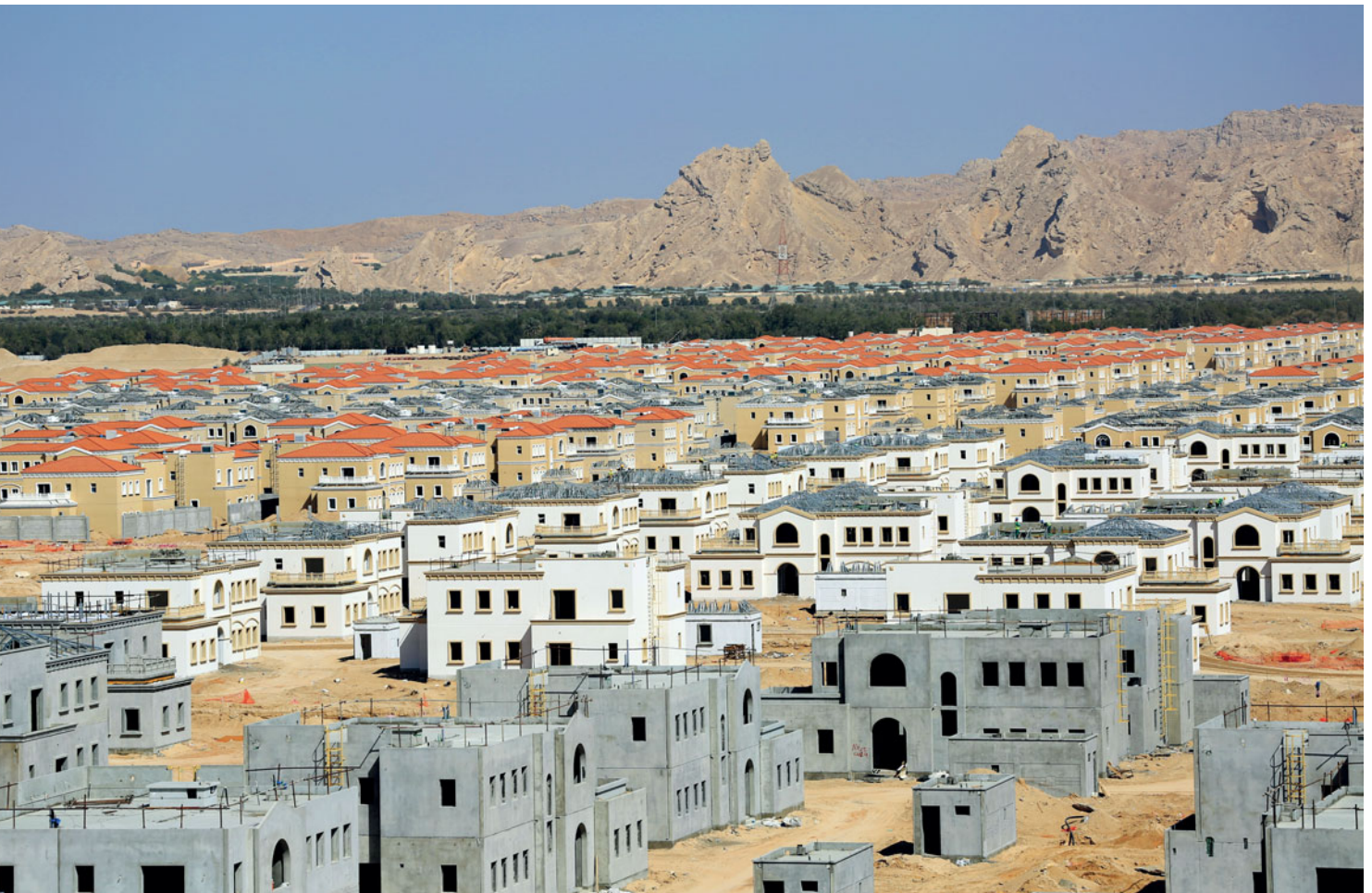
An example of Hi-Tech's scope of precast concrete villa supply and an excellent example of the benefits of precast concrete's advantages in terms of speed of erection, quality, efficiency, versatility and durability.

Hi-Tech Concrete Products is a leading manufacturer of precast concrete products, blocks and block paving and one of eight companies operating under the Trojan Holding umbrella. Formed in 2006 with a facility equal to 120,000 sq. meters, Hi-Tech supplies high quality, innovative and customized precast concrete solutions while undertaking design and build contracts utilizing and highlighting the quality, accuracy, consistency and speed advantages of precast concrete components in order to convert traditional in-situ projects.