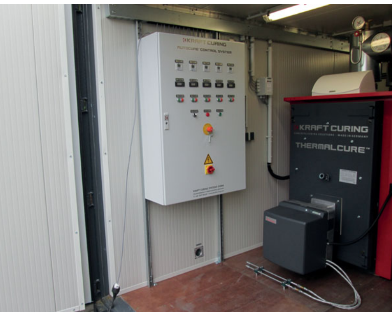
AutoCure Automatic Curing Control System provides for control of casting bed temperature for 6 beds, individually, using threaded temperature sensors, located at the casting beds. An economical and effective curing control system.

Hi-Tech Concrete Products is a member of ACI (American Concrete Institute), PCI (Precast/Prestressed Concrete Institute), GRCA (International Glassfibre Reinforced Concrete Association) and ISO 9001 certified. The company employs a multinational workforce and operates plant and equipment worth over AED 800 million (approximately € 200 million).