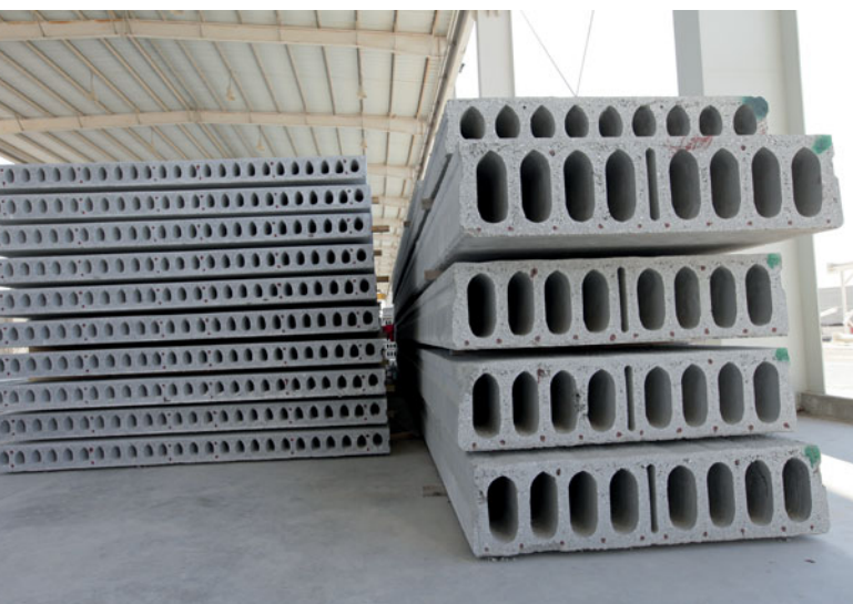
Hi-Tech produces a wide variety of hollow-core sections including various widths for greater installation efficiency and thicknesses for longer spans in order to best meet their clients' requirements.

Kraft Curing Systems designs ThermalCure concrete curing and heating systems in skid-mounted and containerized models. In this case, due to the placement of the equipment - near the production area, the climate - very hot during the day and cold at nights and the space restrictions - small narrow outside space, Kraft designed a containerized curing system using a well ventilated and insulated 20-foot shipping con-