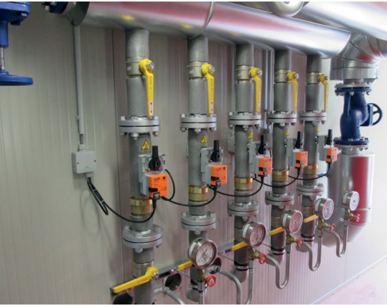
A total of 6 hot water supply lines supply 95°C hot water to a total of 6 casting beds. Each line includes an automatic valve with (orange) actuator. One main return line for all 6 casting beds returns water back to the water heater for reheating.