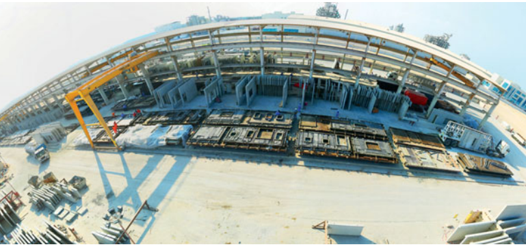
Birds-eye view of a portion of the Hi-Tech tilting table production area and precast wall storage. Hollow-core production area is located under the roof section of the factory.

First, in order to ensure that the heating of the concrete did not cause moisture loss from the surface of the concrete, they installed a tarpaulin covering system that allowed for quick and simple covering and uncovering of the hollow-core concrete. The cover not only eliminated moisture loss, but prevented dry-shrinkage cracks, brittle corners and edges and prevented heat loss which reduced operating costs.