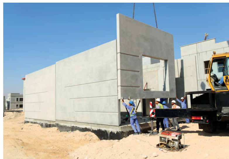
One example of Hi-Tech's precast concrete panels installed in a system for the efficient and quick erection of residential villas, commercial units and mid-rise structures.