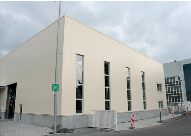
It is done: the new spare parts dispatch hall in Andernach has now been officially in operation since 28 April

With the symbolic cutting of the red tape on 28 April 2017, the new spare parts distribution hall has now been officially opened. During a small celebration, the building complex was opened to all Masa employees for an initial inspection.