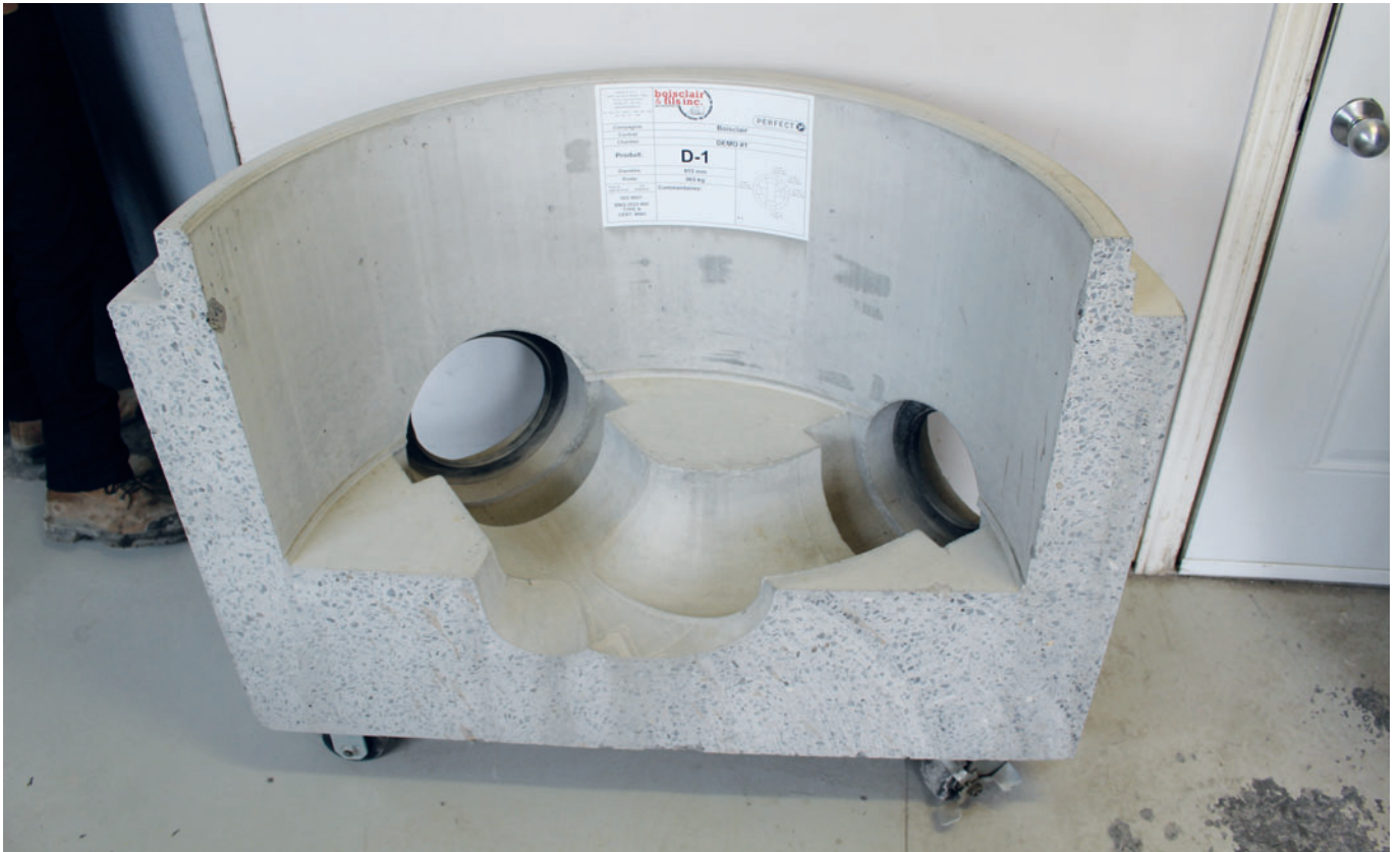
A cross-section of a Perfect manhole element for the promotional tour

Finally, the negative channel must be removed. This is a quick and easy process, which can be done manually by one employee, with the suitable tools provided and expertise passed on by Schlüsselbauer employees.