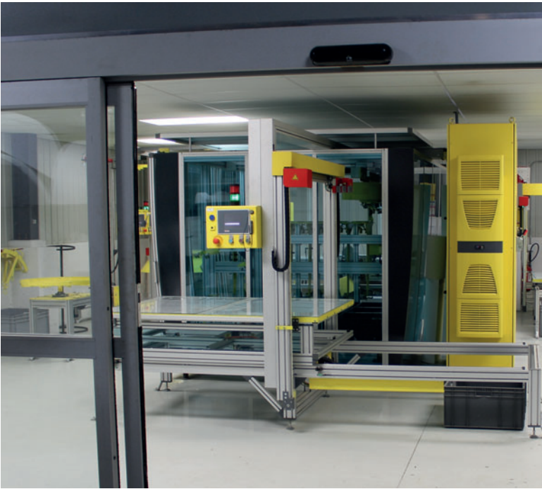
The heart of Perfect concrete manhole base production: The cutting center with 2D and 3D saws