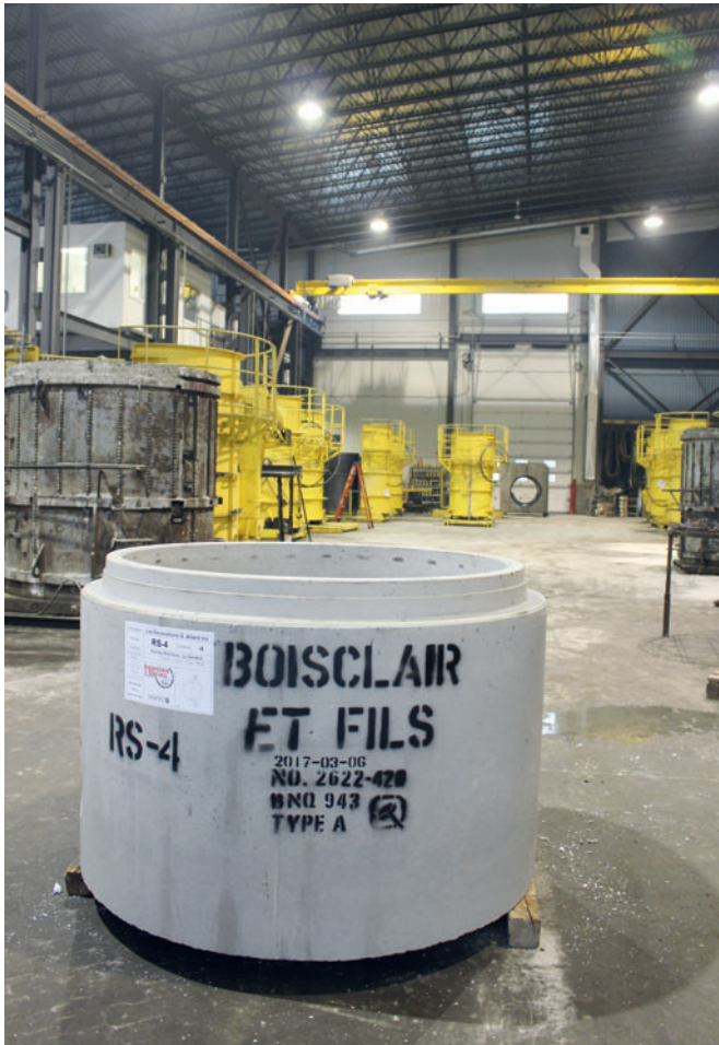
Finished Perfect concrete manhole bases before transfer to the external storage area

the saws, before the individual negative bodies for the channels and pipe connections are combined into one unit.