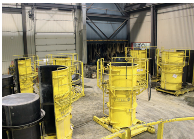
Mold station for the production of Perfect concrete manhole bases