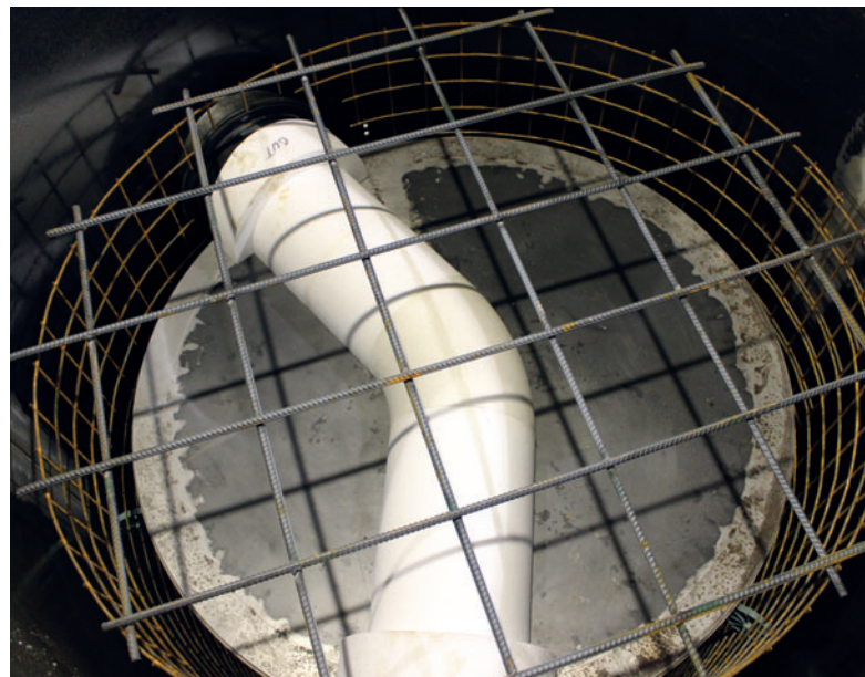
and manhole bottom reinforcement.