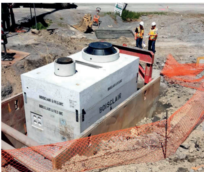
Boisclair et Fils specializes in the production of pre-cast concrete elements for the infrastructure sector, both for water and wastewater, and the electricity and telecommunications branches.