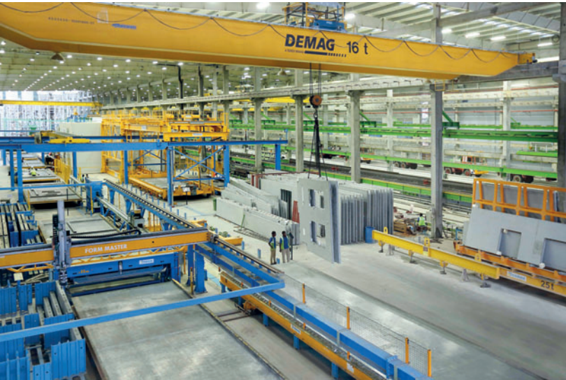
Fast and of high quality: KEF Infra manufactures various wall elements using the recently installed highly-automated carousel system.

ing campaigns for under-privileged persons and victims of natural disasters. One of its aims is to create affordable, high-quality accommodation and to construct commercial parks.