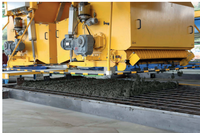
An automatic concrete spreader places the fresh concrete precisely and at a steady rate on the pallet.