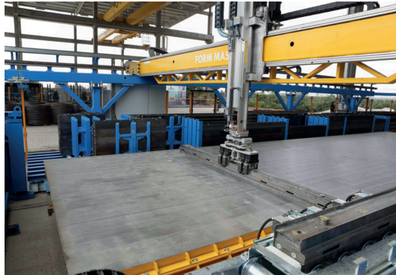
Shuttering and deshuttering have also been automated. This not only improves the quality of the end products and the rate of production, it also increases safety at work.

This basic idea of making India a better country was the main-spring for the construction of KEF Infra One Park in Krishnagiri not far from Bangalore. The concept was that in this industrial park everything required for the construction of dwellings,