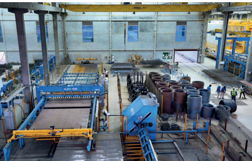
Thanks to their efficiency the three systems installed for the manufacture of reinforcement (the picture shows the mesh welding plant) contribute to optimum production continuity.

commercial buildings, hospitals and schools could be manufactured. The aim was not only to reduce construction time itself, but also to reduce the time for fitting out building with bathrooms, kitchens and furnishings. KEF Infra One Park was officially opened in December 2016. There are a total of 5 different production areas, where precast concrete elements, prefabricated bathrooms and modular building technology is manufactured, plus furniture, aluminium fittings and windows. More than 1,000 people work on the 60,000 m 2 site.