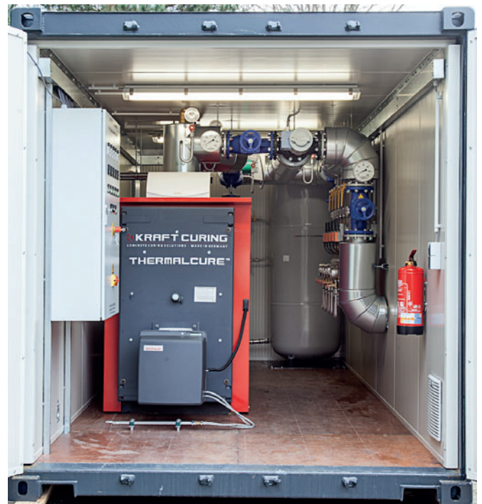
For the current project, the Albvorland Tunnel, Kraft is supplying the Thermalcure® concrete curing system, whose core (water heater) is installed in an insulated, ventilated and frost-protected container.