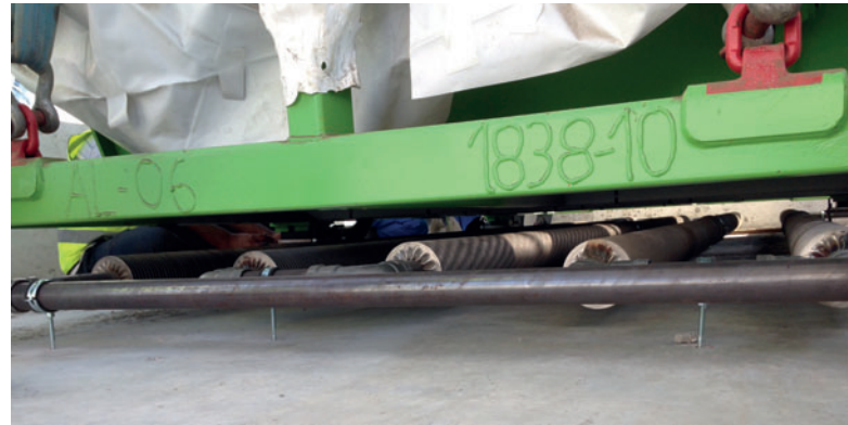
High-performance ribbed pipe, located underneath the moulds, generating 600 Watts of heat per linear meter are capable of heating the concrete segments to 60 °C in a controlled manner as necessary.

Thanks to the water heater design, a flow temperature of up to 110 °C is reached without steam being produced. Hot water is circulated through high performance radiant heat pipes under the individual tunnel segment moulds - 77 in all - via insulated supply and return manifolds. The radiant heat pipes under the tunnel segment moulds are high-perfor-