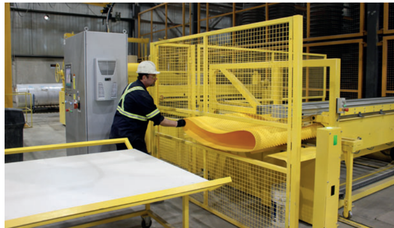
The fully welded liner is ejected from the welding machine and removed by an employee

mold shell are pulled apart and a robot equipped with a universal gripper for all pipe diameters grasps the pipe and lifts it carefully from the mold core.