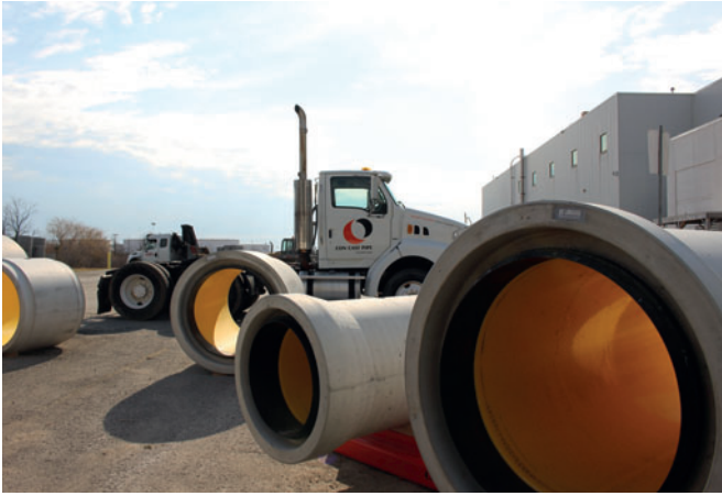
Samples park with various Perfect Pipe concrete-HDPE composite pipes