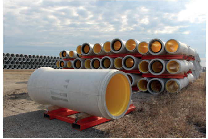
Con Cast Pipe has built special frames where the pipes are placed for storage and subsequent transportation to the construction site

addition to the range of top-quality manholes already on offer. The first Perfect Pipe production facility was started up in 2012 at Bernhard Müller GmbH in Achern, Germany, and was visited by Con Cast very early on. The company's management team was able to see the potential benefits of this new concrete pipe for itself.