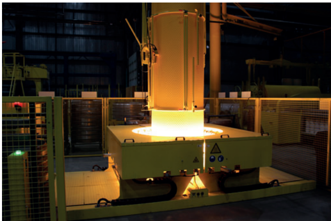
Forming pipe joints in the reshaping station

Once the mold is filled, the concrete hardens for a day, before the new concrete-HDPE composite pipe can be demolded and lifted out of the mold. To this end, the two halves of the