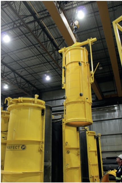
A crane transports the formed liner (with pallets) to the formwork mold and sets it down over the shrinkable mold core