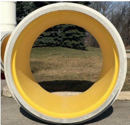
The liner is made of high-quality polyethylene (HDPE), a material which is resistant to chemical attacks

With Perfect Pipe, Schlüsselbauer Technology heralded a new era in wastewater sewage systems. The manufacturing process creates a durable connection between liners made of high-quality synthetic material (polyethylene) and pipe made of high-strength concrete, thus fulfilling the essential demands placed on wastewater drainage pipe. These include resistance to intensified chemical attack, a high static load capacity even in the case of traffic loads, easy handling on the construction site, and better safety throughout the installation and operational processes.