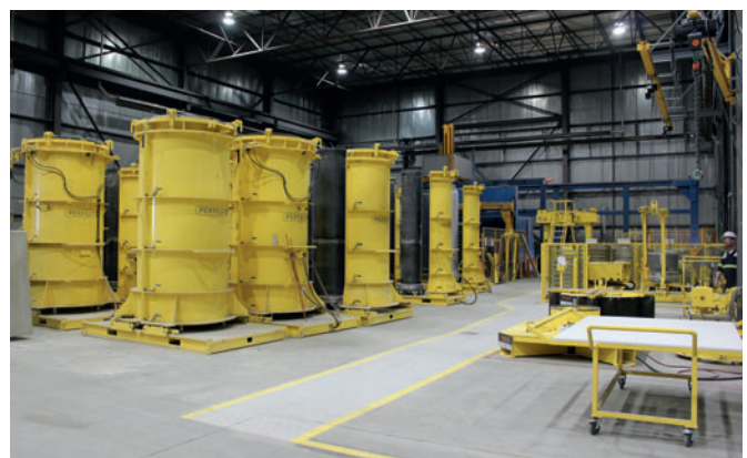
Perfect Pipe production mold station at Con Cast Pipe

The material is kept in stock on continuous rolls. An employee cuts the required length (lateral surface of the mold core) from the roll at a cutting table and feeds this piece into the welding machine. This welding robot, also developed by Schlüsselbauer, then welds a seam using PE welding wire, securely connecting both ends of the liner to one another. The fully welded liner is ejected from the welding machine and removed by an employee. The liner is then clamped into an auxiliary structure that makes it easy to handle with a crane. Next, a crane places the liner into the reshaping station. Here, one end of the cylinder-shaped liner is first formed in a thermoplastic process according to the contour of the subsequent pipe joint, with the liner mounted on a steel pallet. In the next step, the liner is turned and reinserted into the