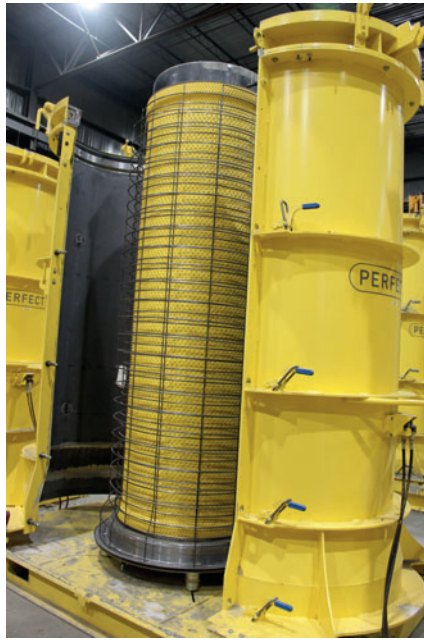
Fully prepared with liner and reinforcement cage