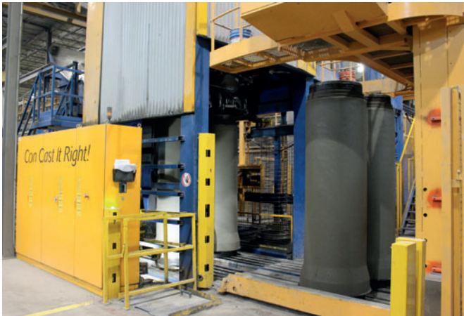
The Schlüsselbauer Exact 2500 has been in operation since 2002

The same method can be used to produce wet cast Perfect Pipe concrete pipe without the liner too, thus facilitating mass production of wet cast concrete pipe. Pipe can be produced with or without integrated gaskets and as either concrete pipes or steel concrete pipes, all depending on the project requirements.