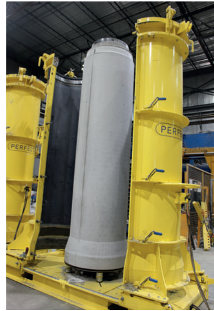
Hardened Perfect Pipe composite pipe

products of such high quality and resistance that not only are they now comparable with other materials, but in many respects they even come out on top," says Brian R. Wood, who is very happy with these developments.