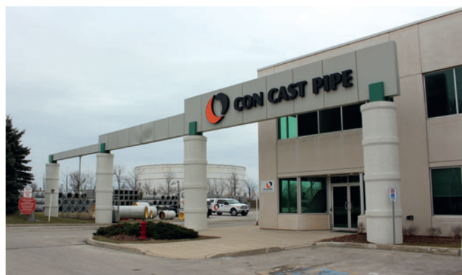
Con Cast Pipe in Oakville

Con Cast Pipe was founded in 1989 and has three production facilities located in Guelph, Oakville and St. Catharines, Ontario. The company's success story began in Guelph, where the first precast concrete products were made. The Oakville site was added in 2002 and is where the new Perfect Pipe manufacturing plant can be found today.