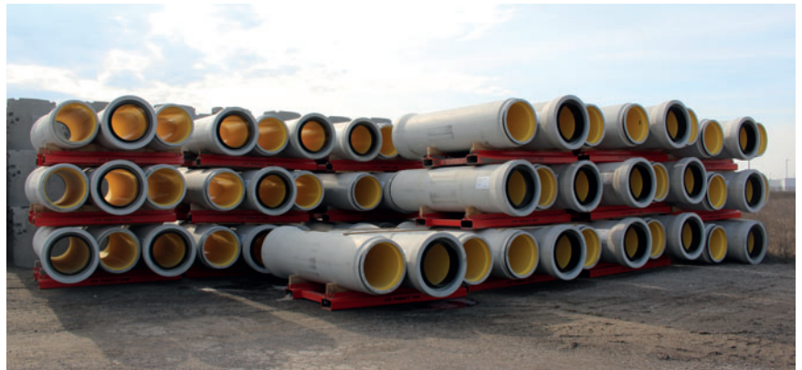
Perfect Pipe in the Con Cast Pipe outdoor storage area