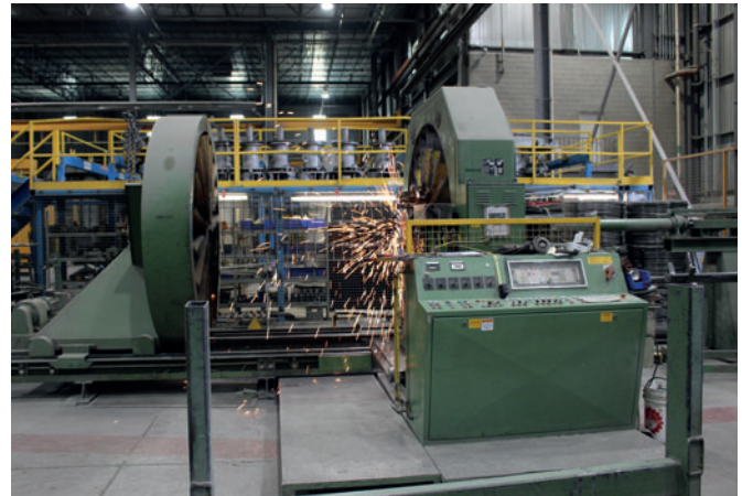
One of the two mbk cage welding machines used at Oakville

The liner is made of high-quality polyethylene (HDPE), a material which is resistant to chemical attacks, abrasion-resistant, and weldable. In a later step, the liner is tightly connected to the concrete pipe via numerous small anchors on its back. The liner features even more anchors around where the pipe connections are located in order to provide a reliable, permanent connection to the concrete pipe.