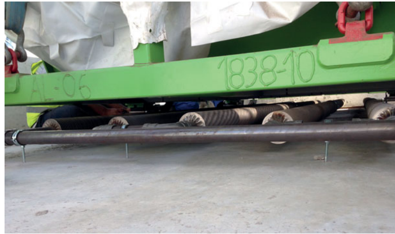
High-performance ribbed pipe, located underneath the moulds, generating 600 Watts of heat per linear meter are capable of heating the concrete segments to 60 °C in a controlled manner as necessary.

The demanding requirements for the mould heating necessitate a sophisticated system. It is possible to heat every single