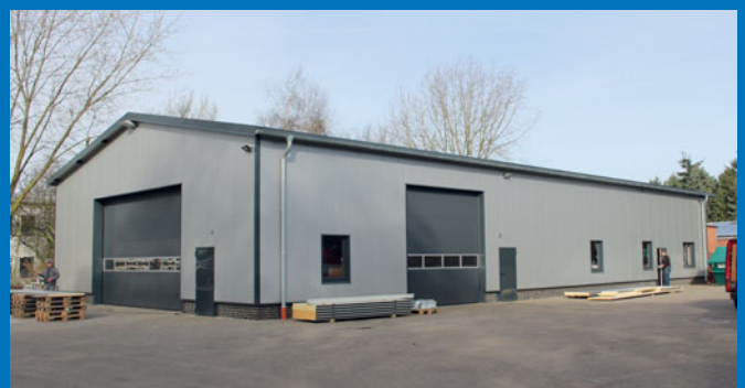
Kraft Curing Systems GmbH headquarters in Lindern has been extended by a new 450 m 2 hall.