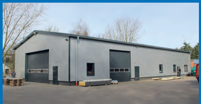
Kraft Curing Systems GmbH headquarters in Lindern has been extended by a new 450 m 2 hall.