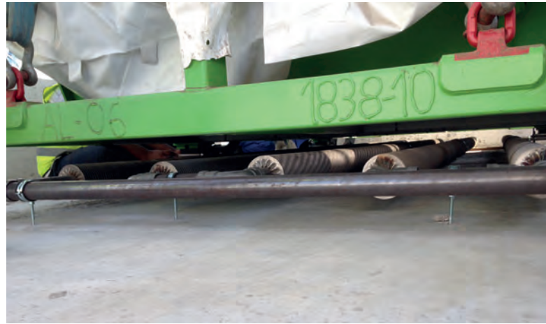
High-performance ribbed pipe, located underneath the moulds, generating 600 Watts of heat per linear meter are capable of heating the concrete segments to 60 °C in a controlled manner as necessary.

The demanding requirements for the mould heating necessitate a sophisticated system. It is possible to heat every single