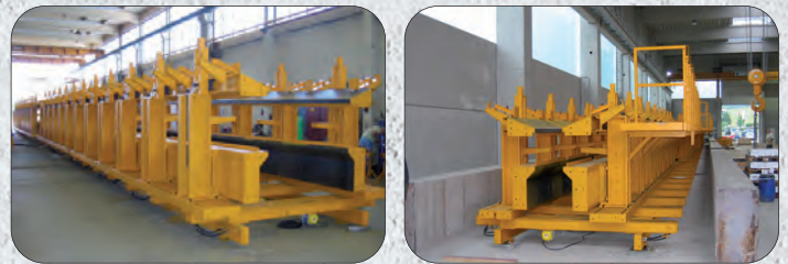
Moulds for beams and columns