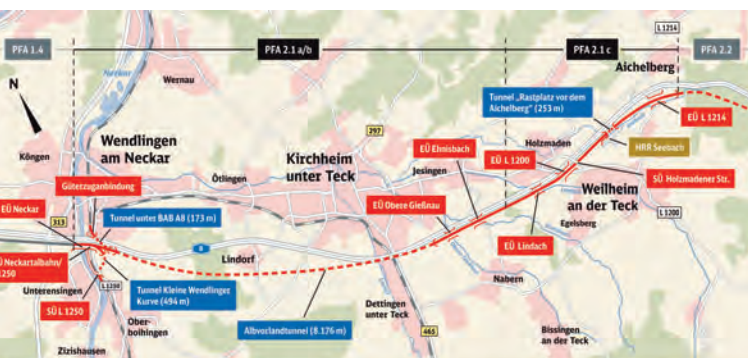
Overview of the tunnel project

Implema Construction GmbH and Herrenknecht Formwork turned to Kraft Curing Systems from Lindern near Oldenburg, to overcome this challenge within the specified schedule.