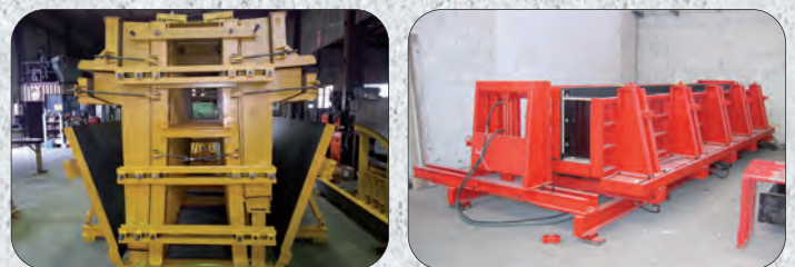
Special designed moulds

Hausadresse: HOWAL GmbH Am Reutgraben 4 D-76275 Ettlingen-Ew. Postadresse: HOWAL GmbH Postfach 417 D-76258 Ettlingen Telefon: +49 (0)72 43-9 49 73 - 0 Telefax: +49 (0)72 43-9 06 45 Internet: www.howal.com Email: info@howal.com