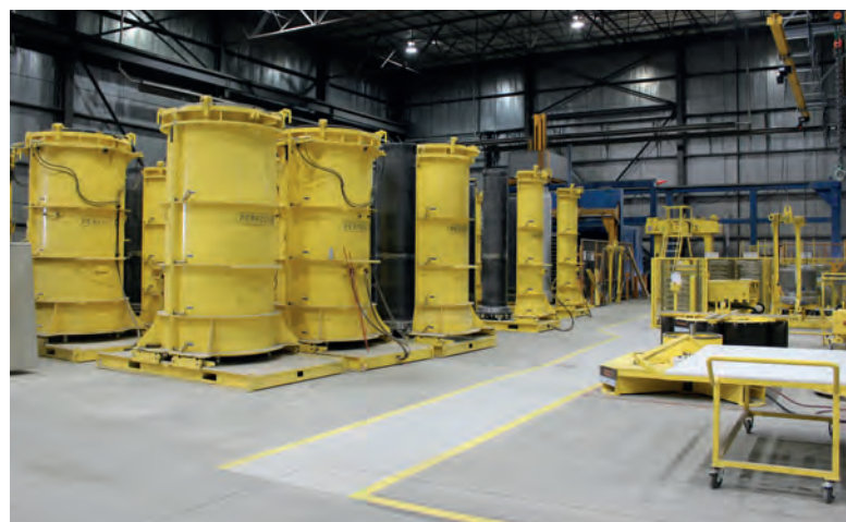
Perfect Pipe production mold station at Con Cast Pipe

Next, a crane places the liner into the reshaping station. Here, one end of the cylinder-shaped liner is first formed in a thermoplastic process according to the contour of the subsequent pipe joint, with the liner mounted on a steel pallet. In the next step, the liner is turned and reinserted into the reshaping station. The second end is then formed and the steel pallet pushed into it.