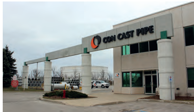
Con Cast Pipe in Oakville

All the locations offer plenty of space and are being modernized all the time. When the Oakville facility was started up, two fully automatic Schlüsselbauer systems for producing pipe and standardized manhole bases were installed, including a