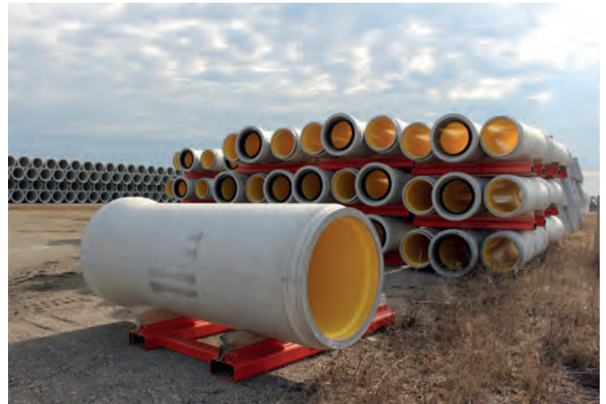
Con Cast Pipe has built special frames where the pipes are placed for storage and subsequent transportation to the construction site

When the decision was then taken to offer Perfect Pipe concrete-HDPE composite pipes in future too, production of Perfect concrete manhole bases was relocated to Guelph and, with the installation of the new Perfect Pipe line, the Oakville facility was upgraded to a pipe center of excellence.