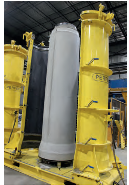
Hardened Perfect Pipe composite pipe

"However, Perfect Pipe should not be seen as being in competition with conventional concrete pipes; many people misunderstand that to begin with. It covers completely different fields and, as such, opens up new markets to us that we were previously unable to serve. The situation has changed. More emphasis is being placed on durability in infrastructure projects and it is no longer a question of looking solely at price. This is exactly where Perfect Pipe offers many benefits over conventional wastewater pipe made of steel or PVC, for example, especially when it comes to providing a durable, low-maintenance, and permanently leak-free wastewater system," says Brian R. Wood.