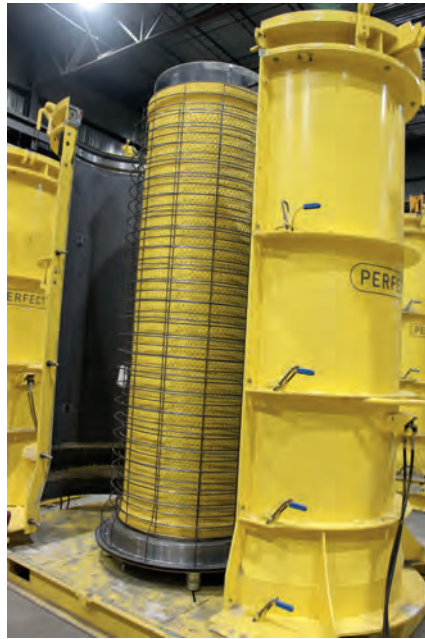
Fully prepared with liner and reinforcement cage