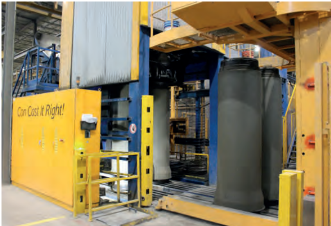
The Schlüsselbauer Exact 2500 has been in operation since 2002