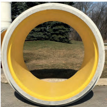
The liner is made of high-quality polyethylene (HDPE), a material which is resistant to chemical attacks

The same method can be used to produce wet cast Perfect Pipe concrete pipe without the liner too, thus facilitating mass