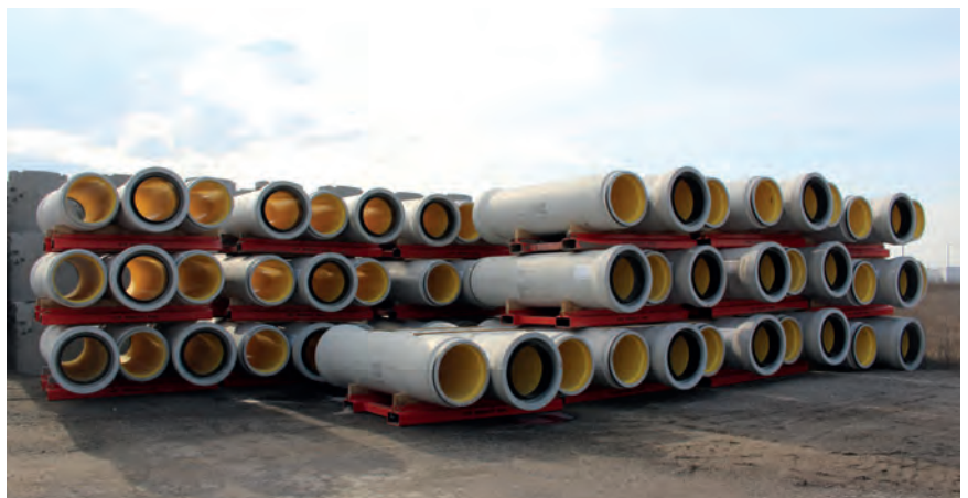
Perfect Pipe in the Con Cast Pipe outdoor storage area