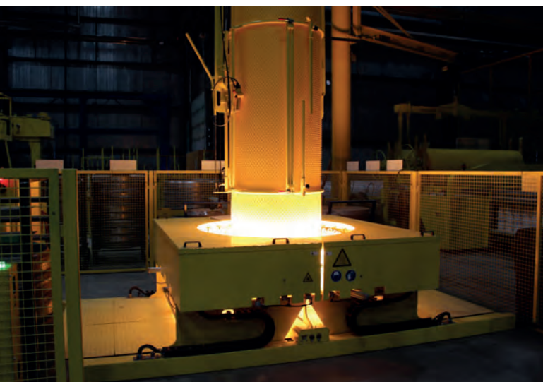
Forming pipe joints in the reshaping station

"The concrete industry has transformed more in the last 10 years, particularly where the wastewater sector is concerned, than in the previous 50 years combined. Today, new production techniques mean that we can make precast concrete products of such high quality and resistance that not only are they now comparable with other materials, but in many respects they even come out on top," says Brian R. Wood, who is very happy with these developments.