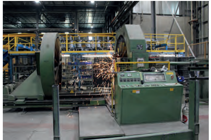
One of the two mbk cage welding machines used at Oakville

production of wet cast concrete pipe. Pipe can be produced with or without integrated gaskets and as either concrete pipes or steel concrete pipes, all depending on the project requirements.