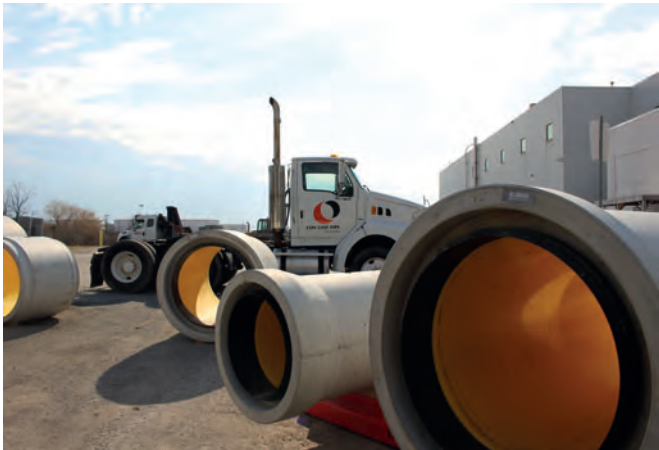
Samples park with various Perfect Pipe concrete-HDPE composite pipes