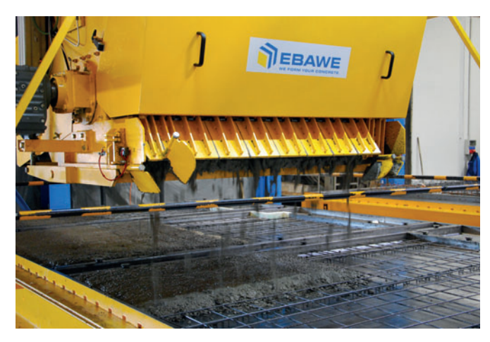
The fully automatic concrete distributor ensures that the fresh concrete is discharged accurately and evenly.

December 2015. The production hall was enlarged by two extensions and existing systems such as the heating and recycling plant were relocated. The existing lattice girder production was also relocated so that it can continue to be used for the new carrousel plant. The new plant was installed in parallel to the extension measures.