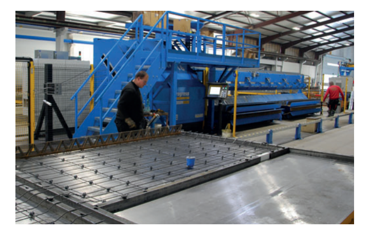
A straightening, cutting and bending machine of the type MSR16 BK was integrated into the carrousel. Like the lattice girders, the bars produced are inserted manually.

Work began on the reconstruction as soon as the last precast concrete element had left the old production plant at the end of