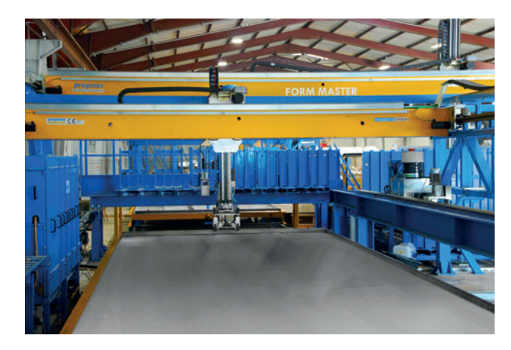
The shuttering and deshuttering robot plays a key role in the increase in efficiency and quality: the Form Master carries out all the work steps fully automatically and with high precision.