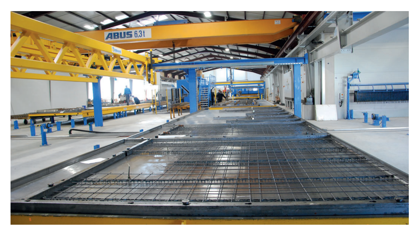
Regenold has succeeded in increasing productivity and lowering operating costs with the construction of the new carrousel plant.

Prilhofer Consulting, who are active around the globe in consulting and planning in the field of the industrial production of precast concrete elements, developed the concept for the new production plant and the invitation to tender for all participating machine and plant