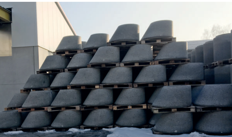
Warehouse in the outside area at Pimiskern

across Europe, investigations were carried out into cycle times that could actually be achieved and the actual requirements of a new production plant were substantiated. Due to the lack of space already mentioned, the new production facility was expected to be created using the existing infrastructure and with a minimum amount of required renovations or newly constructed buildings. If nothing else, the new manufacturing plant was expected to be set up in such a way that the existing concrete supply via the bucket conveyor could still be used in its current state.