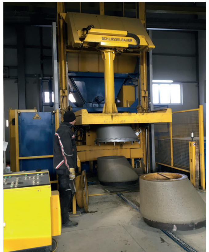
Demoulding of a finished product