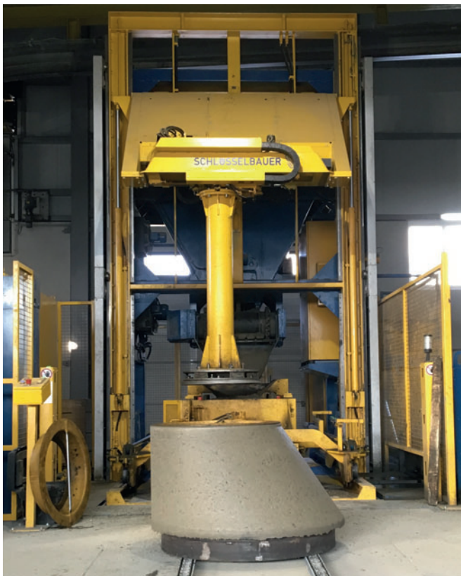
Magic production plant of Schlüsselbauer Technology