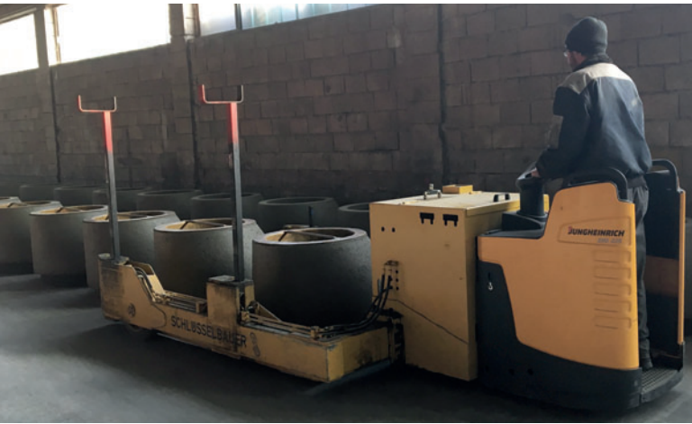
Product is transported into the setting area by electric cart