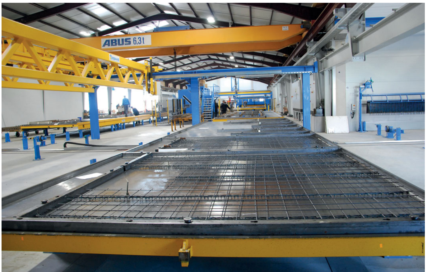
Regenold has succeeded in increasing productivity and lowering operating costs with the construction of the new carousel plant.

Prilhofer Consulting, who are active around the globe in consulting and planning in the field of the industrial production of precast con-