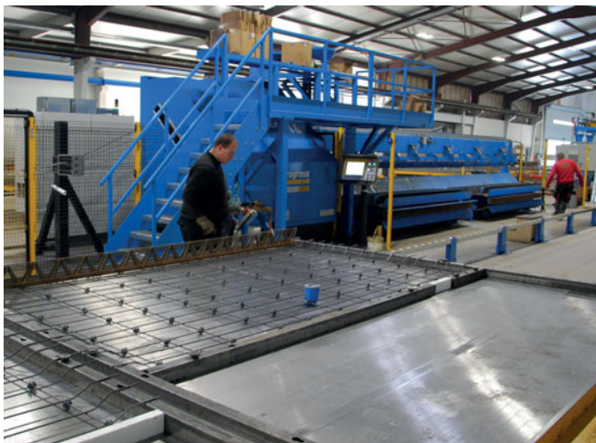
A straightening, cutting and bending machine of the type MSR16 BK was integrated into the carousel. Like the lattice girders, the bars produced are inserted manually.