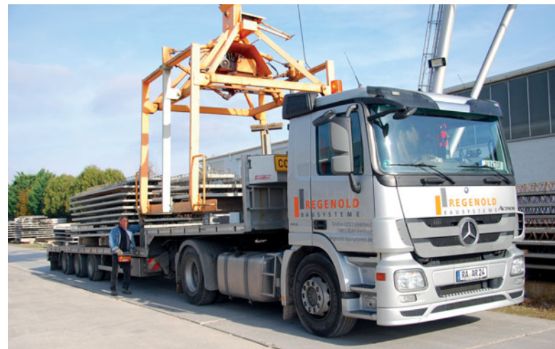
Floor elements account for 60% of the precast concrete element production at Regenold. The precast elements are used in residential, commercial and industrial construction on the German and French markets.

Double and solid walls as well as lattice girder floors have been in production on a total of 50 pallets since last summer. Floors make up 60% of production and wall panels 40%. "We are already very satisfied with the result even now, just a few months after the start of production", says Technical Manager Frey. The high level of automation has a very positive effect on the production process and product quality at two stations in particular: the shuttering/deshut-