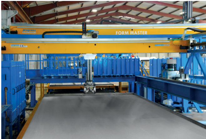
The shuttering and deshuttering robot plays a key role in the increase in efficiency and quality: the Form Master carries out all the work steps fully automatically and with high precision.