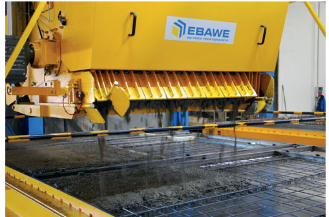
The fully automatic concrete distributor ensures that the fresh concrete is discharged accurately and evenly.