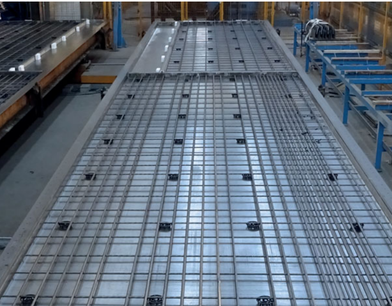
The spacers are placed accurately and a steady rate of concrete coverage is thus guaranteed. The savings potential is considerable.