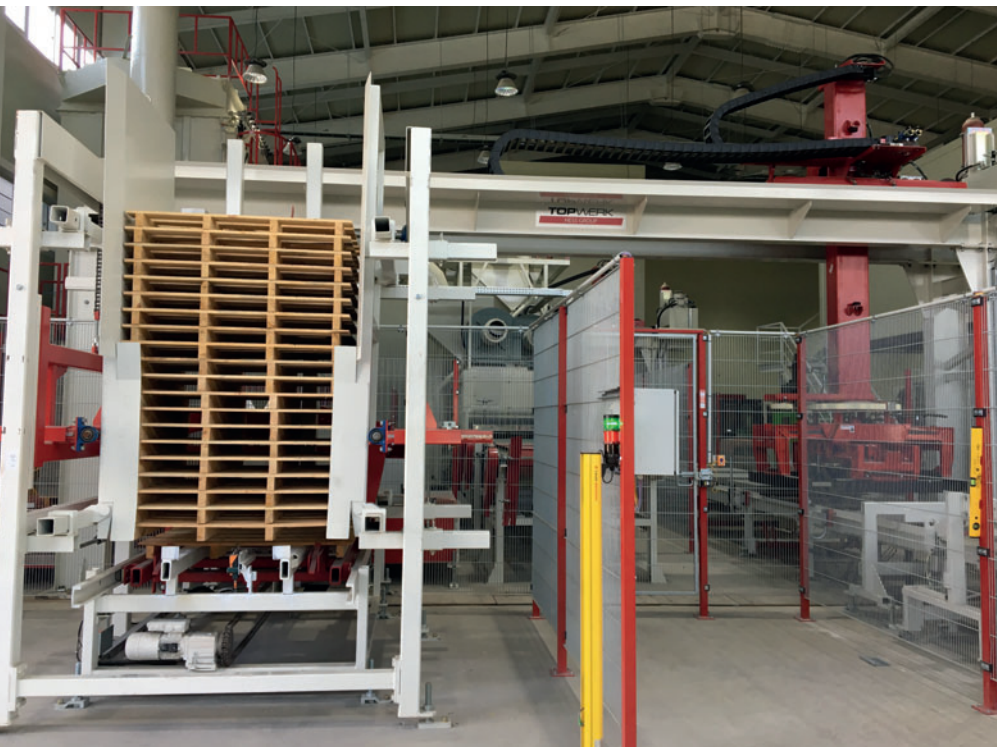
With Topwerk, a leading supplier of complete integrated solutions for the concrete industry, Seoho found a powerful partner.

The core of the new factory, the RH 2000-3 MVA, is the 3rd RH 2000 concrete block making machine that Topwerk Hess delivered to Korea. The machine has a high-performance hydraulic so that the movement of tamperhead, mold and filler box are monitored and precisely controlled. In addition this block making plant is equipped with the Topwerk Hess Variotronic vibration table with oil bath vibra-