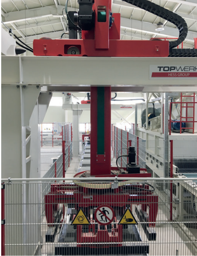
Topwerk servo cubers