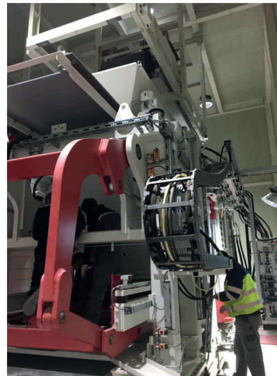
The core of the new factory, the RH 2000-3 MVA, is the 3 rd RH 2000 concrete block making machine that Topwerk Hess delivered to Korea.