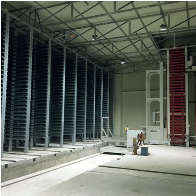
The curing chamber is equipped by Rotho.

tors. The Variotronic vibrator units in this machine are driven by servo motors which are electronically controlled. This results in an extremely reliable and accurate vibration process for high quality blocks and paving stones. The independent adjustability of frequency and amplitude guarantees optimal vibration during the mold filling process. In total the high-end production machine creates reliable performance for high quality products which totally matches the needs of Seoho. The plant is also equipped with a color mix system to produce a wide range of color-blended pavers. In the new factory, there is a two-boarded Topwerk washing machine to produce washed concrete blocks after the press machine process.