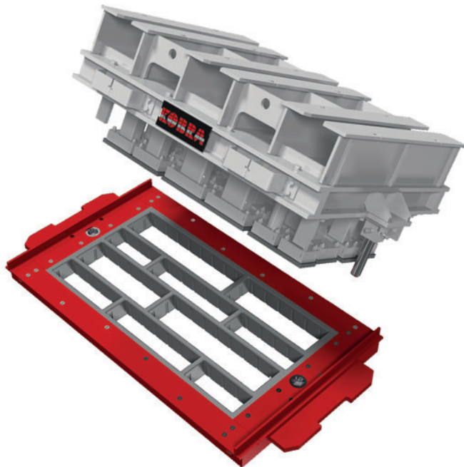
Mould technology from Kobra: Boltline3™

Kobra has been working since 2008 with software that plans and manages all production steps centrally. The delivery reliability of every single mould is additionally recorded and evaluated by Controlling. Whereas in 2014 Kobra delivered 90% of all moulds as confirmed, i.e. with a maximum delay of five days, 94% of all moulds reached the customers on time in 2016. 86% reached their place of use early or on the exact day. Kobra handles customer-relevant information openly and transparently and works with the entire team every day on adherence to deadlines and agreements. The extremely positive delivery reliability attests to Kobra's performance.