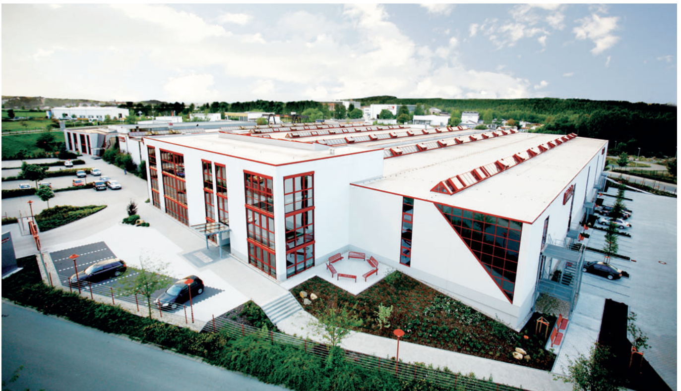
Headquarters of Kobra Formen GmbH in Lengenfeld

One of the slogans with which Kobra has advertised in years gone by was "The best welding is no welding". The basic idea is to design