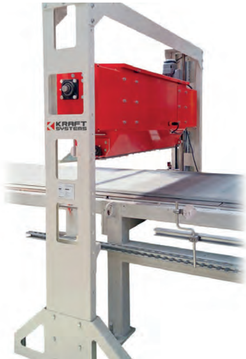
T-Rex granulate dosing unit from Kraft Systems

The separation of layers of concrete paving stones or patio slabs using materials such as lattice nets or fleece is often very elaborate and expensive, even more so if the materials require manual positioning which also presents a safety issue. Help is at hand in the form of the T-Rex™ granulate dispenser from Kraft Systems for the fully automatic separation of layers using recycled plastic granulate.