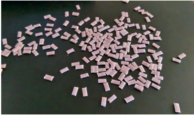
The granulate is available in a rectangular form and consists of LDPE (polyethylene), which is recycled from packaging materials