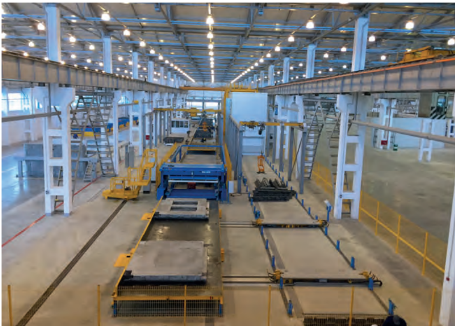
Solid and sandwich walls are manufactured on two carrousel plants (the picture shows the one in Ashgabat).