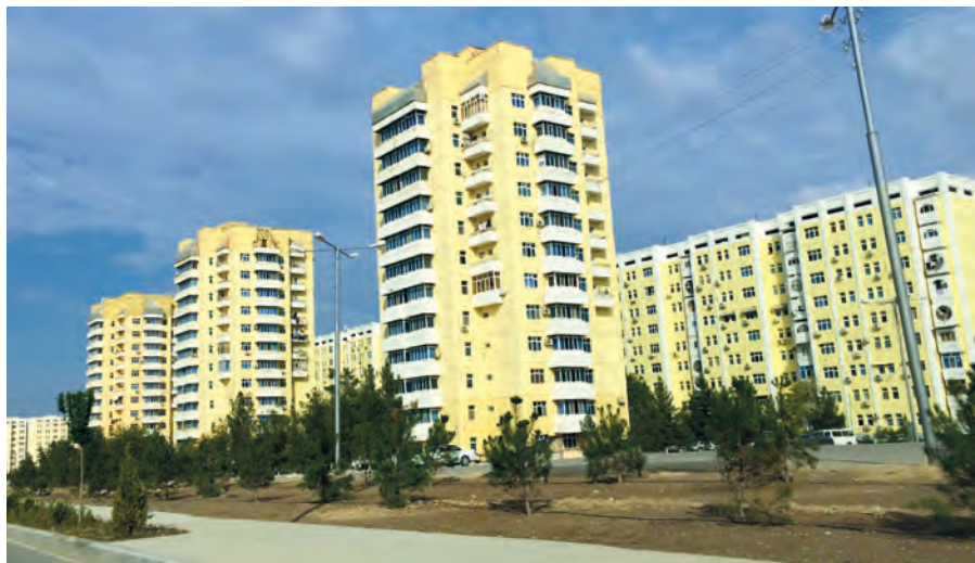
Affordable and modern living space is to be created with the aid of state programmes. Precast technology is playing a big part in this project.

High importance was attached to earthquake safety in the elaboration of the project and the planning of the precast concrete elements to be produced. "We all still