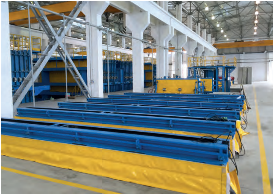
Beams (foreground), stairs (centre of picture) and ventilation shafts (background) can be produced using additional moulds, of which there are 15 in total. An integrated heating system accelerates the curing of the concrete.

ing tables are also used in Ashgabat for the production of large and special elements.