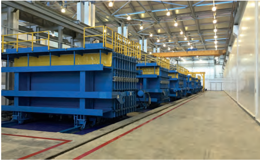
Solid walls and slabs are manufactured in the smallest space using a total of 18 battery moulds.