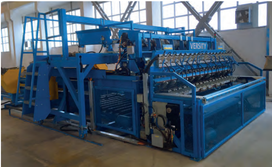
A mesh welding machine of the type Versity was installed in each of the modernised plants for the production of standard meshes. Stirrups and bars are produced on 9 additional machines.