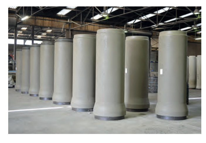
Freshly manufactured DN 700 pipes produced with the RP 1630