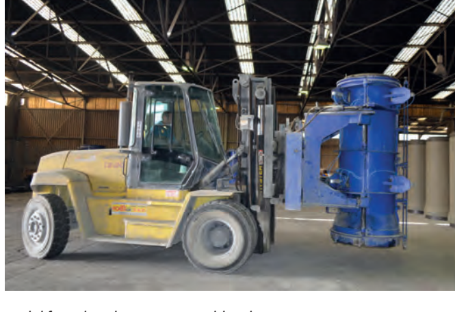
Fork-lift truck with a 3-part mould jacket