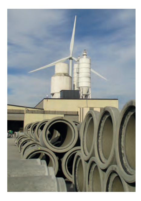
One of two 2-MW wind turbines at Tubobel

Luc Lemmens used the new beginning to realign Tubobel as an independent player in the market. Luc Lemmens has set himself the goal of further improving service and Tubobel's position in the market. Professional advice and comprehensive services are just as much matters of course for Tubobel as the constant improvement of products, quality assurance and quality control.