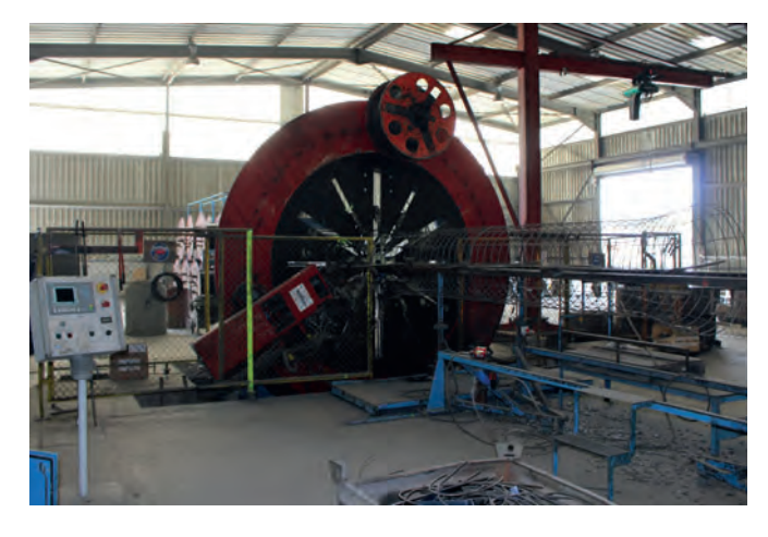
Apilion wire cage welding machine type ASMS