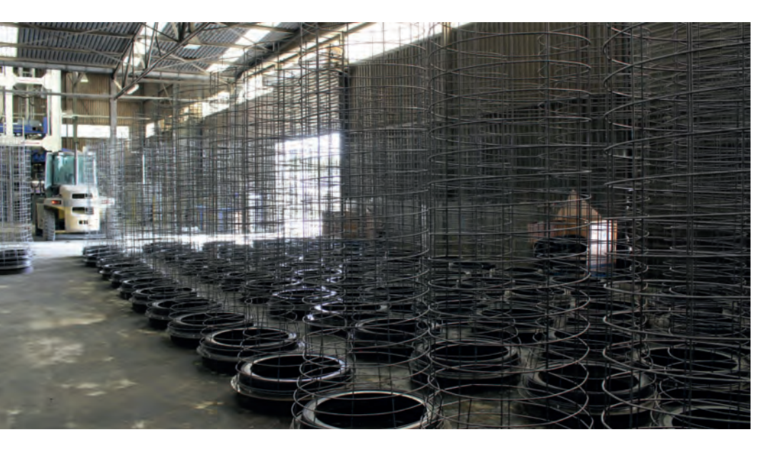
Base pallets with reinforcement stand at the ready