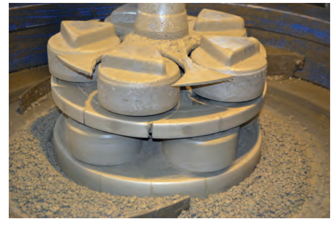
Concrete feeding to the RP 1630