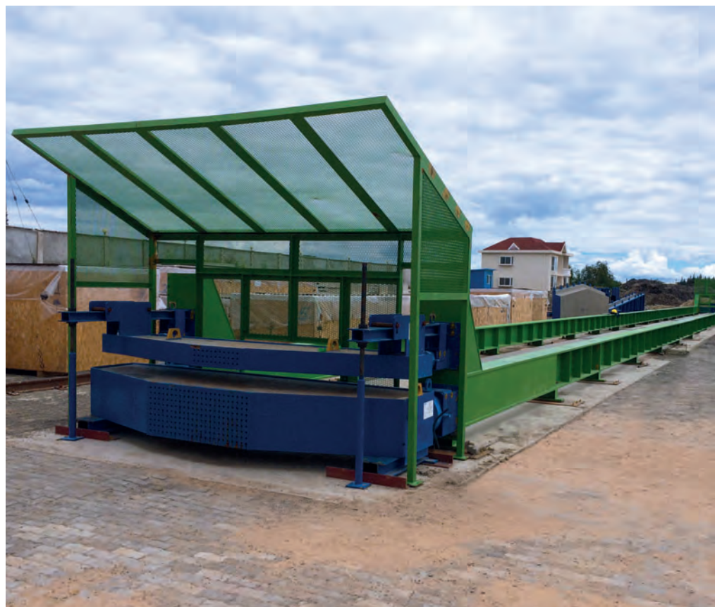
A mould with a self-stressing system for preloaded stresses can be fitted with various lateral shutters and insets. This allows flexible production of various types of beams.

The six 18 metre long column moulds, which have been installed on the production line for the production of structural precast concrete elements, are being used to manufacture columns, plus their consoles. A hydraulic system adjusts the width of the columns by up to 500 mm. The maximum height of the elements is 1000 mm. The end products are used in the construction of industrial halls and multi-storey car parks. The plinths for the columns are manufactured using a specialised mould. At its base