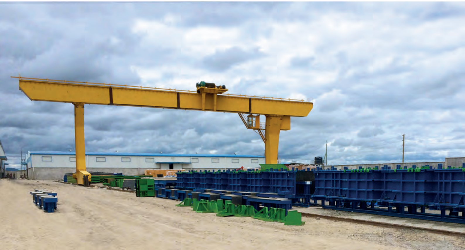
A total of six moulds, each 18 m long, are used for the manufacture of columns for commercial construction.