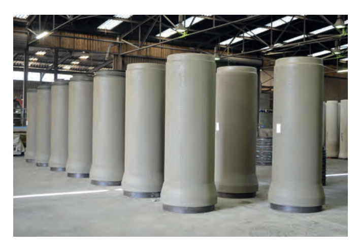
Freshly manufactured DN 700 pipes produced with the RP 1630