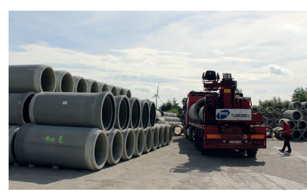
Concrete pipes on the way to a customer