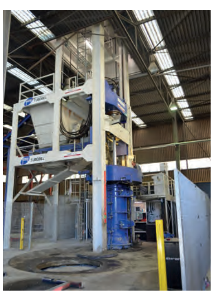
The new RP 1630 radial press

scale orders ensure excellent utilisation of the entire production. The location of the company directly on a canal simplifies transport logistics for some projects and can thus bring advantages over competi-