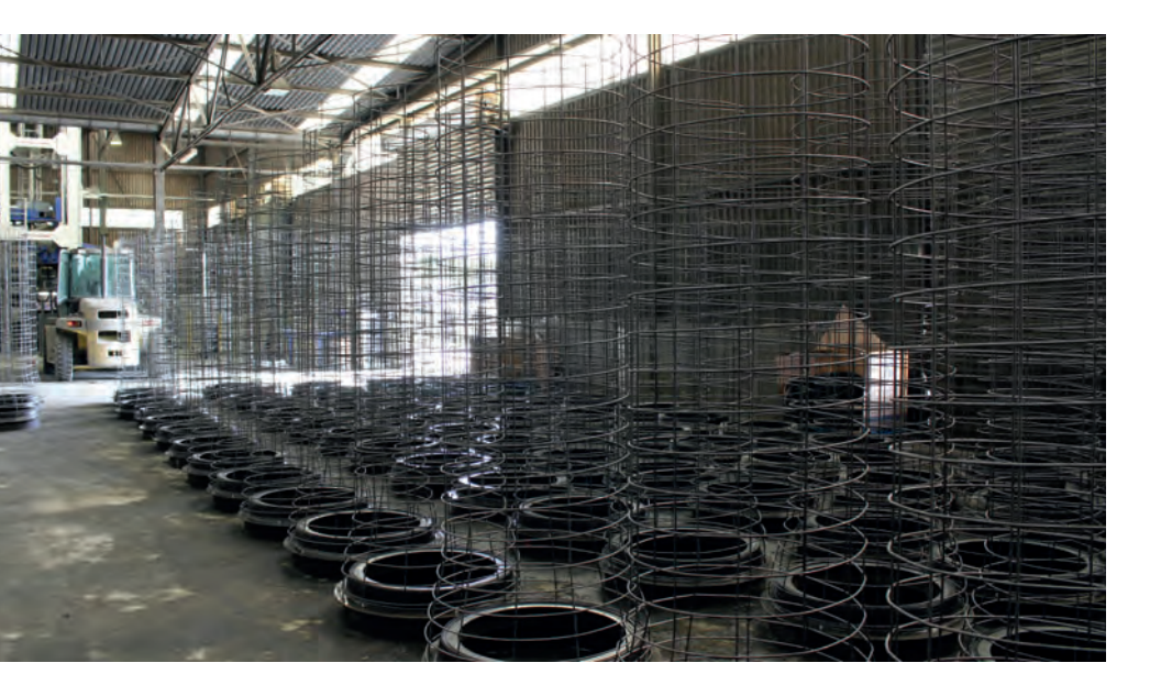
Base pallets with reinforcement stand at the ready