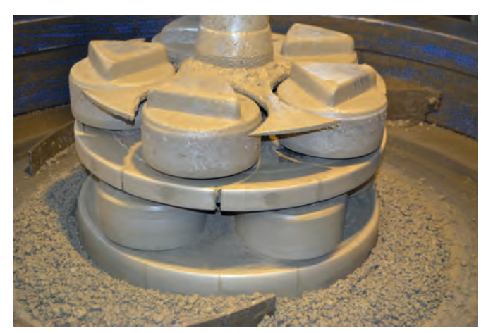
Counter-rotating compaction tool/packerhead