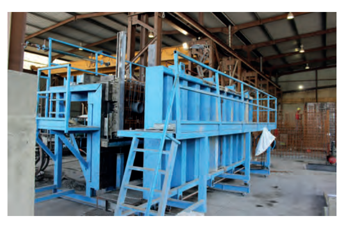
Mould for the manufacture of retaining walls

Naturally he is also open to new products and always has the market well in view. An