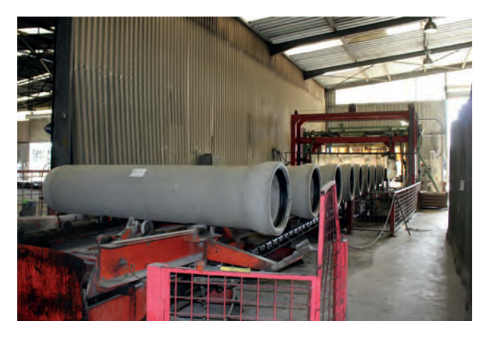
Inspection line for the finished pipes