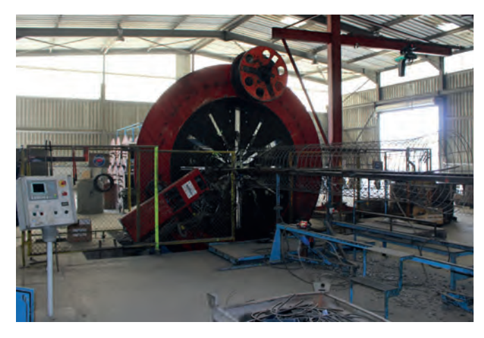
Apilion wire cage welding machine type ASMS