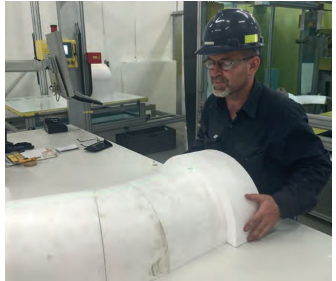
Positioning lasers are used to help the worker to assemble the negative channel, while at the same time providing quality control.

and with the use of the smallest possible amount of the material, EPS (= polystyrene rigid foam). As a result, different junction angles, channel inclines and pipe connections are all taken into account, along with a wide variety of pipe connection types. This enables the simple production of any channel scenario that is required within the municipal wastewater sector and all in a single manhole base, with which allowances can also be made for any desired changes in direction, multiple inlets and varying construction heights. The result is optimized flow behaviour throughout the whole channel, whereby areas of congestion and unwanted turbulences are avoided.