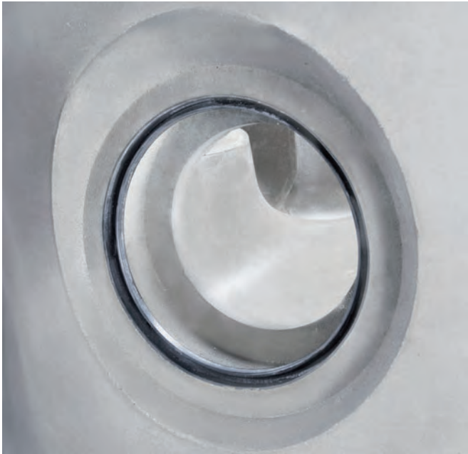
Factory-integrated gaskets for the inlets and outlets of the manhole bases guarantee a tight bond with the surrounding concrete and ensure the watertightness of all pipe connections.