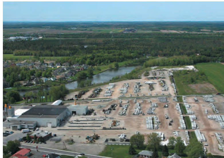
Company premises of Fortier 2000 Ltée near Québec on Canada's eastern coast.