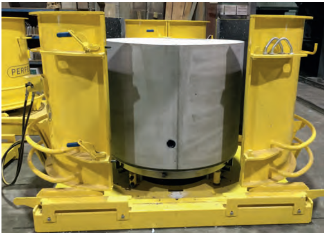
At Fortier 2000 Ltée, the manhole bases, which are manufactured from self-compacting flowing concrete, are usually demoulded the following day.

requirements. It enables the production of precise and watertight manhole bases using flowing concrete in only one pour, while also allowing for the creation of any channel configuration that may be appropriate. The Perfect technology has already been successfully implemented by more than 35 users worldwide. With its strategic investment in this innovative system, Fortier 2000 Ltée is taking a decisive step in the direction of a production method that is economical over the long term, and is at the same time adopting the role of a technological pioneer in the field of concrete manhole production.