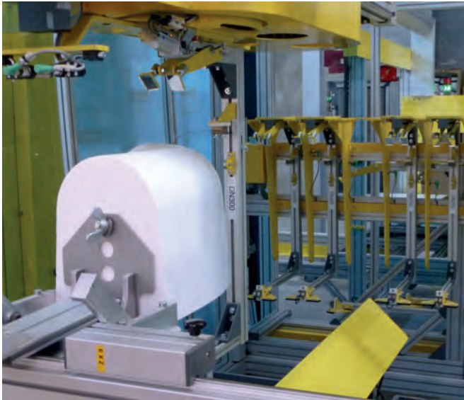
One of the characteristics of the Perfect system is the computer-controlled hot wire cutting technology, which ensures the precise cutting of the negative channel components and the pipe connection form parts.

and with the use of the smallest possible amount of the material, EPS (= polystyrene rigid foam). As a result, different junction angles, channel inclines and pipe connections are all taken into account, along with a wide variety of pipe connection types. This enables the simple production of any channel scenario that is required within the municipal wastewater sector and all in a single manhole base, with which allowances can also be made for any desired changes in direction, multiple inlets and varying construction heights. The result is optimized flow behaviour throughout the whole channel, whereby areas of congestion and unwanted turbulences are avoided.