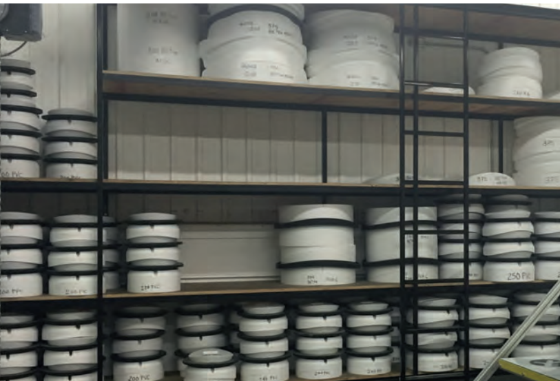
Pipe connection form parts, cut to size from polystyrene rigid foam using a profile saw, with fitted gaskets.

In order to pre-empt customer-specific desires and future requirements with regard to the necessary pipe-manhole connection combinations, Fortier 2000 Ltée has decided to purchase an additional profile saw developed by Schlüsselbauer Technology, which was first presented at the Precast Show in Nashville in March 2016, in front of a wide audience. The saw in question is a computer-controlled hot wire cutter, which makes it possible to quickly and easily produce customised and precise pipe connection form parts and