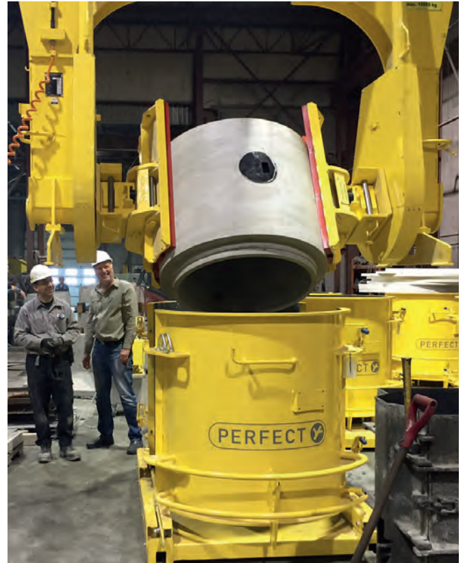
The finished monolithic manhole bases are lifted with the help of a product gripper and rotated 180°.

A number of precise moulds with which monolithic concrete manhole bases measuring 36"/914 mm and 48"/1,219 mm in diame-