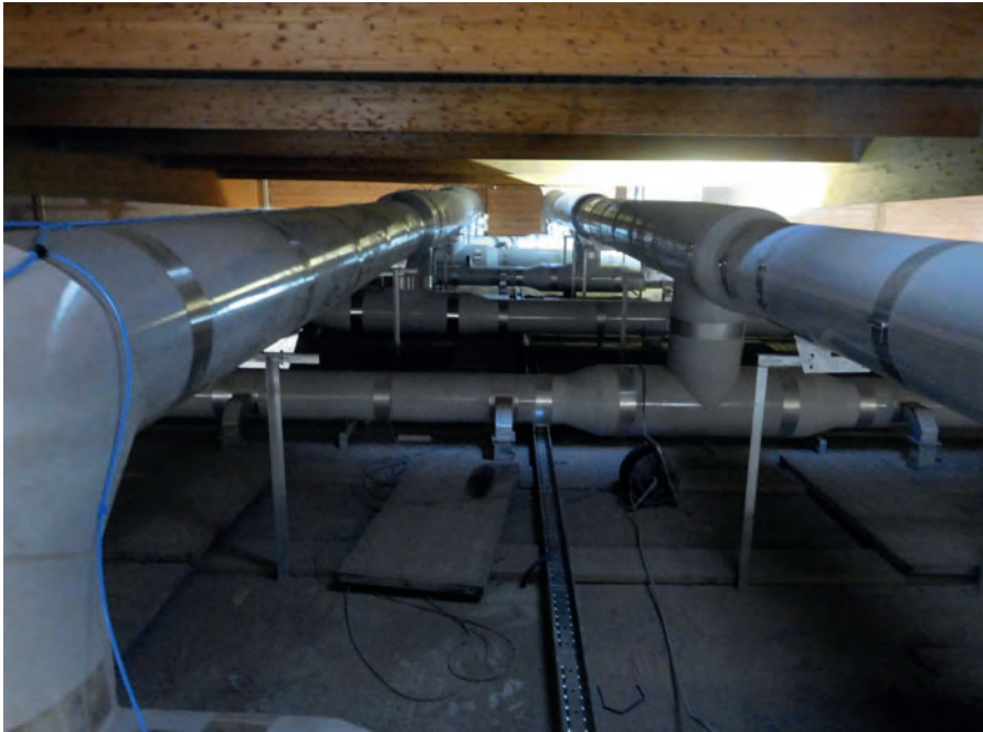
The insulated air ducts above the chamber with high-performance humidifying nozzles.