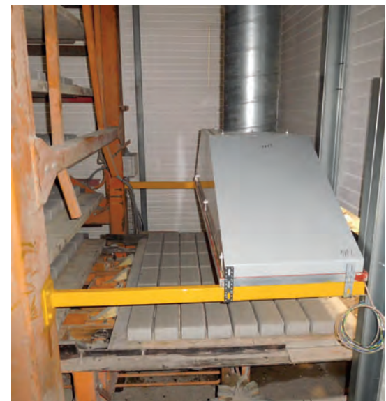
One of two heated hoods installed between the lowerator and chamber wall prevent the escape of warm and moist air, preventing any condensed drops of water reaching the fresh blocks.