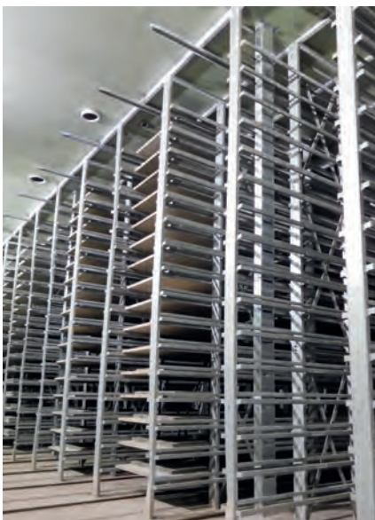
Air distribution lines inside the chamber to regulate air distribution and limit air velocity to less than 1.00 m/s.

The commissioning took five days in total and encompassed the commissioning of the system, the system settings and a slow heating up of the curing chamber to the necessary post-treatment temperature and relative humidity - normally between 35 °C and 40 °C and between 85 % and 95 % relative humidity.