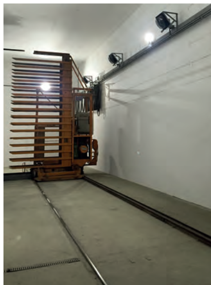
Due to the air distribution in the transfer table aisle, this area and the finger car remain dry. No condensate or mist forms that could result in a possible failure of the finger car distance measurement, which is carried out by lasers.