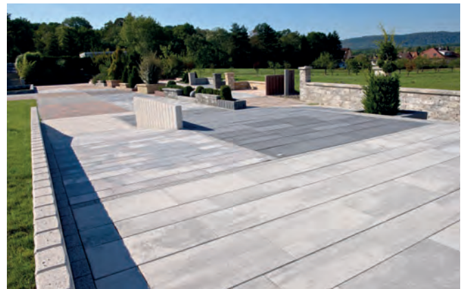
Exhibition garden in Steinbourg