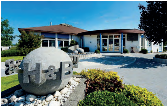
Heinrich & Bock headquarters in Steinbourg

The rack system had already been enclosed for several years and was closed off by a sliding door following completion of production. But the Quadrix System from Kraft also includes the enclosure of the lowerator and the finger car. This design is significantly more energy-efficient, provides a more consistent curing atmosphere and also ensures that the transfer car suffers less damage. After careful consideration and cost-benefit analysis, the Heinrich & Bock Company followed the recommendation to also enclose the transfer car, elevator and lowerator areas and, at the same time, placed the order to install the established system a few weeks later.