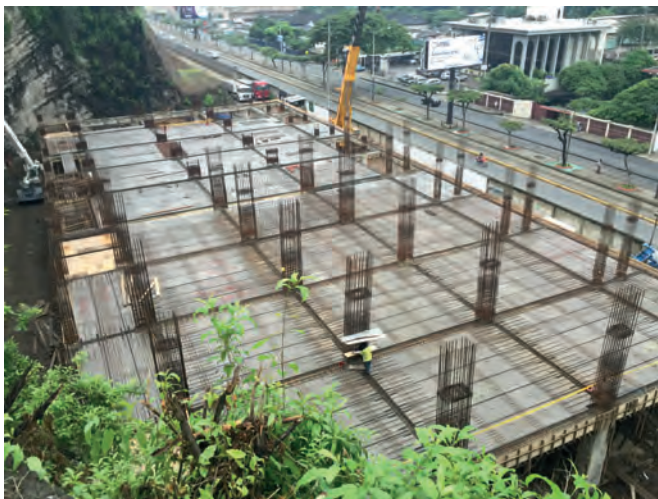
In August this year a five-storey car park was constructed for the Catholic University of Guayaquil. An addition of two more levels is planned.

The State of Ecuador was ready to change this. EPCE, founded in 2010, in order to break the prevailing oligopoly in the cement and construction industry and to lower price levels, was assigned the task of developing new construction methods. A system, which would make it possible to construct high quality buildings quickly, was sought. The choice was made for construc-