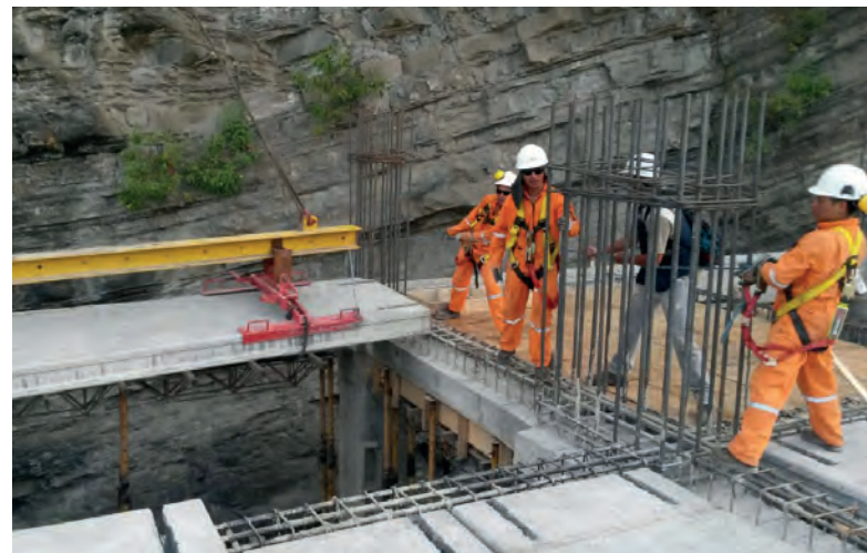
EPCE transported hollow core slabs, each 8 m long and for a total surface area of 10,000 m 2 , from Riobamba to Ecuador's largest city.