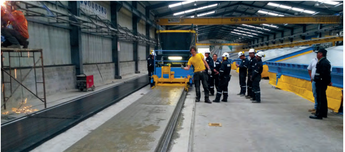
The hollow core slabs are produced on two beds, each 114 m long, with the aid of a slipformer from Echo Precast Engineering.

made to order and their special construction ensures the excellent quality of the slabs produced on them. Thus, the use of concrete under the steel plate contributes to good thermal conductivity, while at the same time providing for the transmission of vibrations and thereby improving the compaction of the final products.