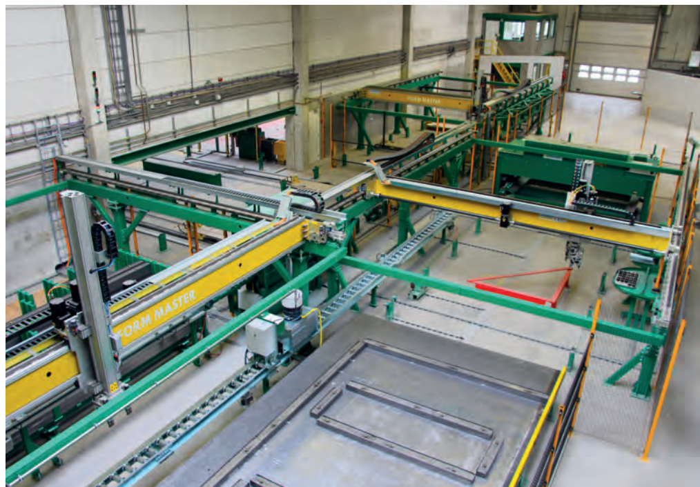
The core of the renovated Voorbij Prefab plant is the Form Master shuttering and deshuttering robot. Infinity Line® makes it possible to shutter without leaving gaps and without using polystyrene elements, while at the same time reducing the number of shutters required to a minimum. For the first time this system is applied for solid wall shutters.