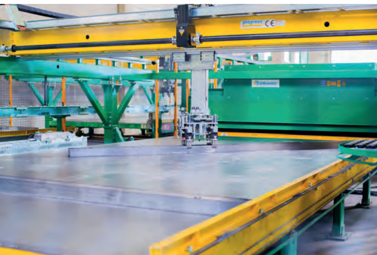
Six minutes: the time required for the shuttering process has been significantly reduced by sophisticated robotics and software.

At the end of the production process the pallet is scanned, the shutters released, removed and delivered to the cleaning system. When the shutters are stored once more, the cycle ends. Thus, the shuttering and deshuttering process becomes not just more precise, it can also comply with exact production times. The figures speak for themselves: it was possible to reduce the time for preparing a pallet to only six minutes.