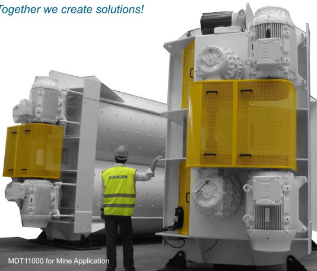
MDT11000 for Mine Application