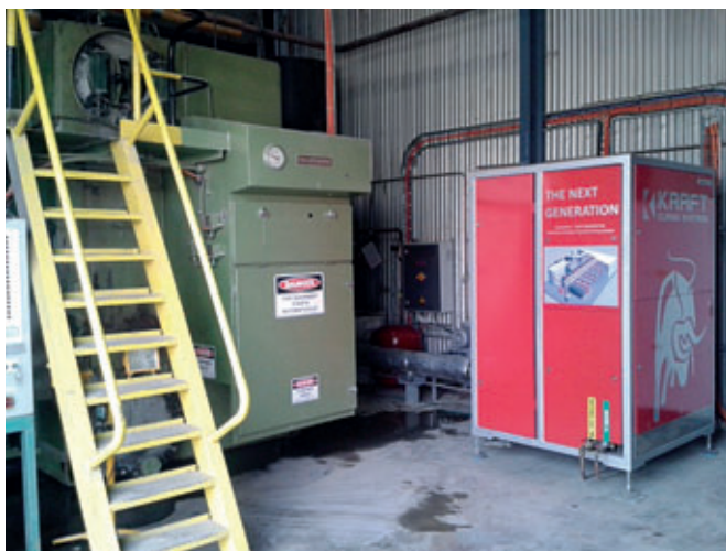
Fig. 3: The compact Kraft Curing KC 20-1S Vapor Generator (right) installed next to the boiler it replaced. Vapor Generators take up significantly less space than a conventional boiler of comparable output.

The system leverages an exothermic process releasing the latent heat of vaporization, which refers to the flow of energy during a transition from one state to another. In this case, the gas (vapor) transitions to a liquid state as it condenses on the surface of the concrete (see Fig. 1). The large value of the enthalpy of condensation of water vapor is the same reason steam/vapor provides highly effective heat transfer.