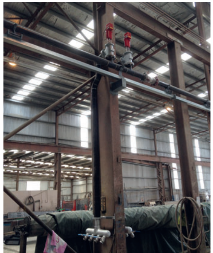
Fig. 4: Control Valves located throughout the production area control the flow of vapor automatically based on concrete temperature.