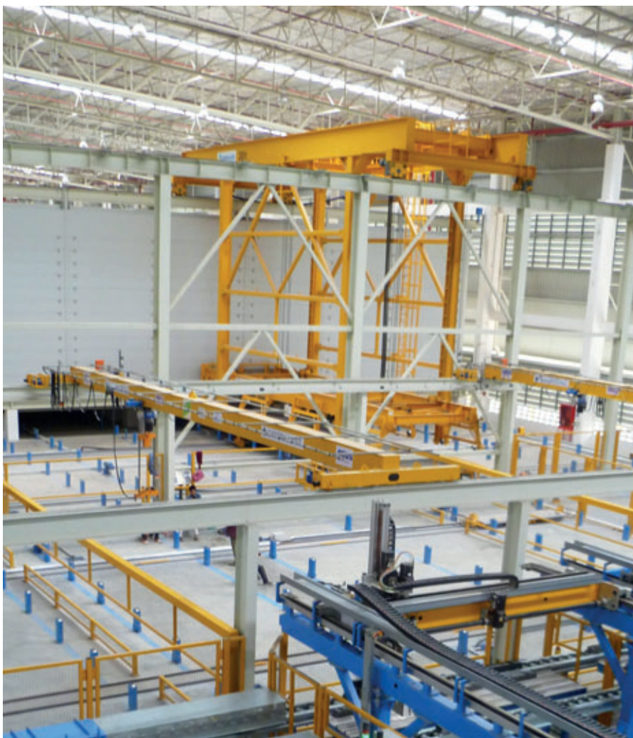
The pallets are put into and taken out of storage by a fully automatic storage and retrieval machine. ebos® calculates the necessary dwell time in the hardening rack and transmits this data accordingly to the machine.

The elements removed with the aid of a crane are placed in transport cradles, so-called racks, which are taken up directly by a cross-lifting truck of the run-off truck. The run-off truck transports the racks to an enormous, automated external storage system and transfers them there to one of three trolleys, which drives the racks to the appropriate storage place in the outdoor store and deposits them there. For transport to the building site, three further run-off trucks with cross-lifting trucks pick up the racks from the outdoor store again and transport them to the collection places for the truck loading. The store has a capacity of 450 racks.