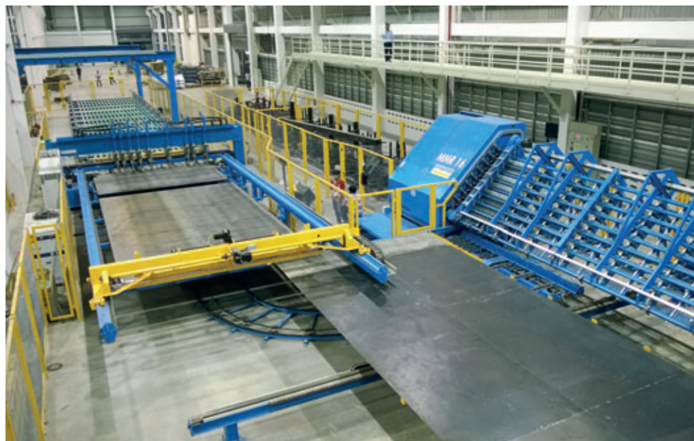
The M-System Evolution mesh welding plant manufactures the reinforcement meshes just in time to precisely fit the respective pallet.