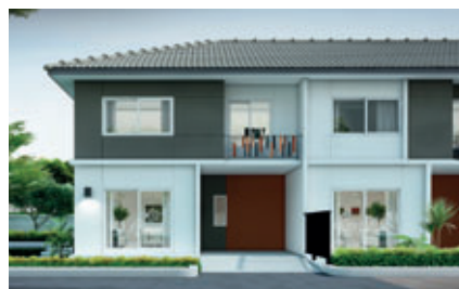
Pruksa’s philosophy is the realisation of high quality, but nevertheless affordable living space for Thailand’s population. The detached houses or single-storey and multi-storey freehold apartments are always handed over turnkey to the customers and are subject to strict quality control from the groundbreaking to the interior finishings.