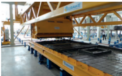
The concrete distributor at Pruksa can discharge over the entire width of the pallet. This leads to enormous savings of time in the production sequence.

The required reinforcements are meanwhile produced just in time in accordance with the data sent by ebos®. The new plant is equipped with a fully automatic mesh welding machine, a handling spreader bar for the automatic placement of the meshes, a mesh buffer that serves as an intermediate store, a trolley car for the produced reinforcement meshes as well as an automatic stirrup bending machine. The special feature is the enormous saving of time achieved with the mesh buffer. This makes it possible to produce the reinforcement meshes in advance, to store them intermediately and to insert the appropriate finished mesh without delay when the pallet drives in. Production is thus not only flexible, but also efficient.