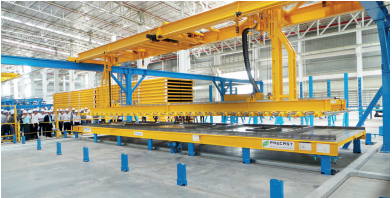
Much use was made of automation in the new plant: the automatic picking and placing of the meshes in the shuttered pallets is carried out by a handling spreader bar.

noise levels of the machines in order to create a more healthy and pleasant working climate for the workforce.