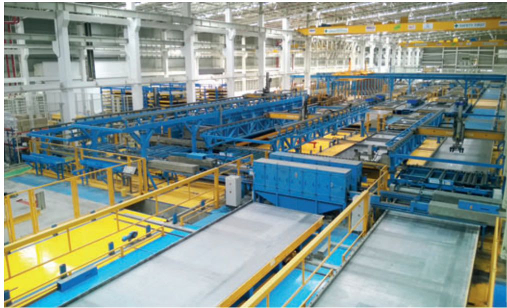
View inside the new high-performance plant at Pruksa: the demoulding and shuttering of the pallets as well as the cleaning and oiling of the pallets and required shuttering elements are completely automated.

The second newly delivered Progress Group plant not only makes use of the latest German-made machine technology, it also meets the high demands for environmental friendliness. This 'green' plant was equipped with a recycling system that separates surplus concrete and dirty water from each other and feeds them back to the production process for further use. For Pruksa it was also important to reduce the