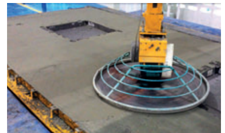
The new plant near Bangkok is equipped with six power trowels and 24 smoothing stations places for the fine smoothing of the element surfaces. Thanks to fully automatic operation, the cycle times are reduced to a minimum and personnel savings are achieved.