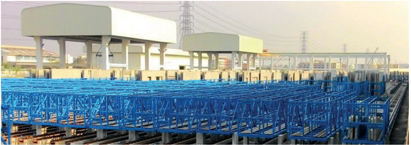
The outdoor store at Pruksa is impressive: it offers space for 450 racks in which the finished solid walls are stored. The total warehouse management is completely automated – a further highlight of Pruksa’s high performance plant.