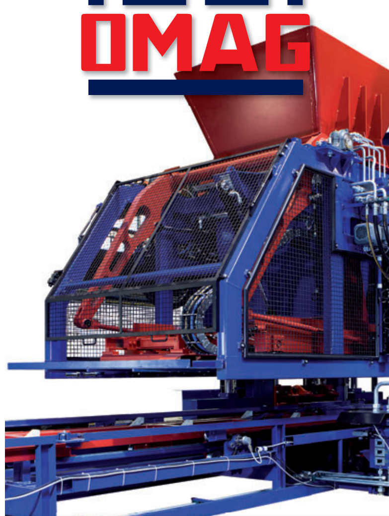
OMAG Tronic S Model 2016

Wasa has always considered itself to be a full-range supplier that doesn't want only to be able to offer the customer a single product, but can also recommend and ultimately deliver the board that is, when properly considered, best suited to the respective individual application. That could be the Wasa Softwood board in the case of a price-conscious customer, a Wasa Woodplast in the case of a customer who values the advantages of a hardwood board, but can do without its disadvantages, or a Wasa Uniplast Ultra in the case of a concrete block making plant that attaches importance to extremely long service lives. This portfolio has now been joined by a fourth type of board in the Wasa Tecboard as a useful addition. The Wasa Tecboard certainly won't displace any of the aforementioned products, but will be of interest above all to those customers who would like to have a light-weight board with a very high bending resistance. The Wasa Tecboard is thus predestined for concrete products manufactured on the board that are very heavy and/or sensitive to bending – just