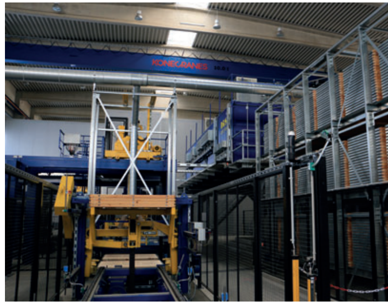
Masa chain conveyor for stacking production pallets