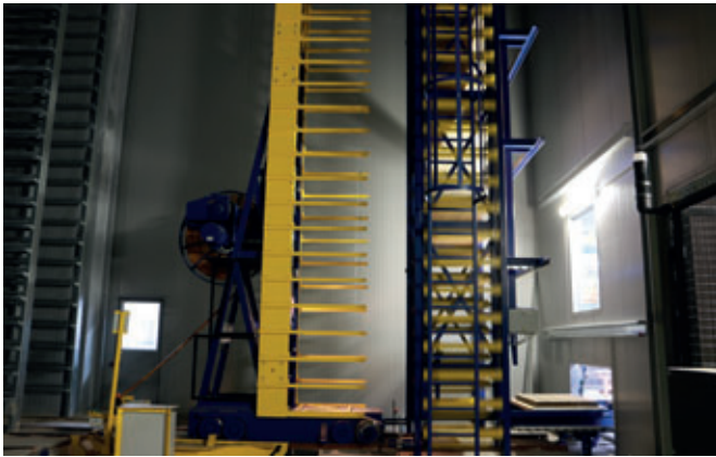
The mobile transfer table takes freshly-made products on the wet side