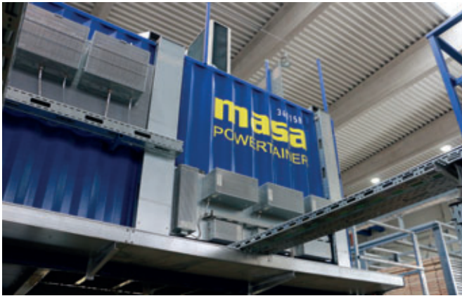
Masa Hydraultainer and Powertainer