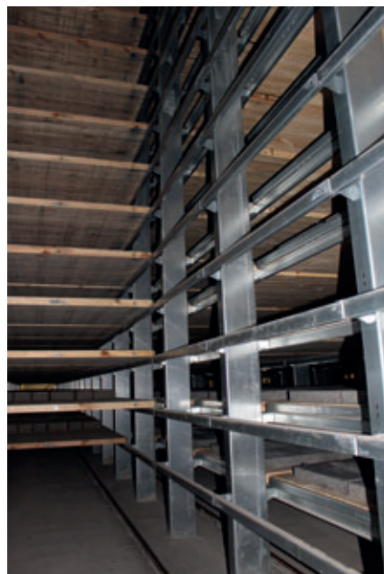
The curing system's total capacity is 7,932 boards

Production takes place at Röckelein on soft-wood boards made by Eckart Holz. Before being inserted into the concrete block making machine, the boards are sprayed with release agent at the oil spraying station to be made ready for production. Besides concrete paving blocks, the Masa XL.9.1 also produces concrete slabs up to 60 x 40 cm and a height of 5 cm at Röckelein.