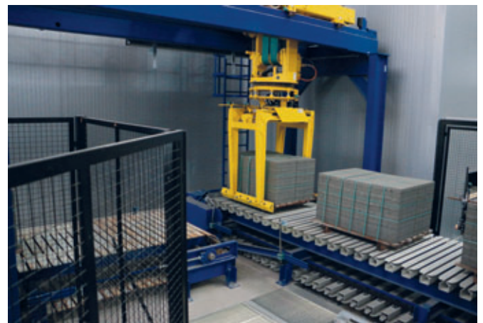
Another Masa transfer unit takes the strapped packages of blocks and places them on a package conveyor set up at an 90° angle