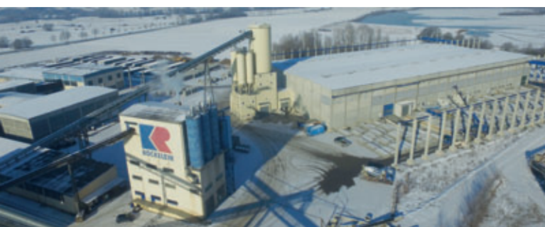
The Röckelein site in Rattelsdorf with the twin bay production hall built in 2012 from a bird's-eye perspective

The mixing tower was fitted out with two more Liebherr ring-pan mixers for the new concrete block production line. A RIM 1.5-D (nominal content 1.5 m 3 ) with a mechanically driven double whirler produces core concrete fed onto a conveyor belt for the