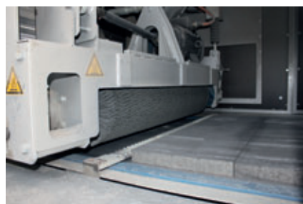
KBH double curling unit