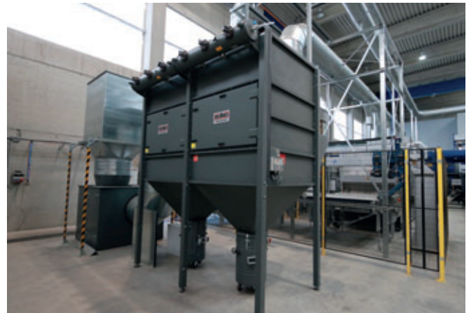
Rotho central dust extraction unit

a double curling unit. Both system components permit processing to be carried out singly, i.e. as pure ageing (curling brushes raised) or only curled (Dancing Weights retracted) and obviously in a combination of aged and curled.