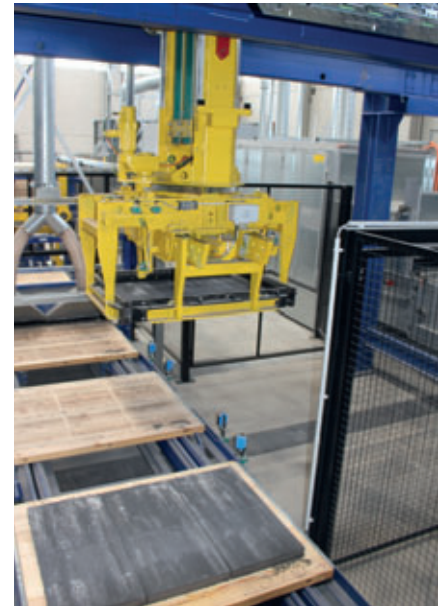
Masa transfer device