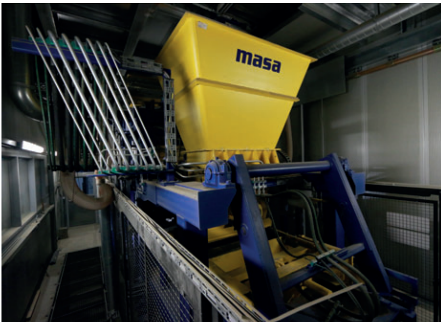
The Masa XL 9.1 concrete block making machine

concrete blocks. The third mixer, an RIH 0.5 (nominal content 0.5 m 3 ), with a hydraulic whirler produces facing concrete that is also fed onto a conveyor belt. All three ring-pan mixers feature a pre-silo and separate cement and water weighing systems to achieve the greatest flexibility possible. Röckelein has integrated a Scholz dosing system with liquid colours in the mixing tower for colouring the concrete.