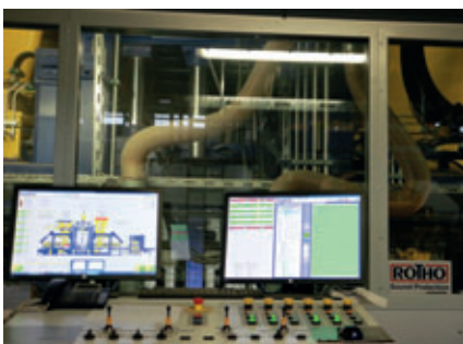
The control station is installed next to the concrete block making machine, which is visible through a large window pane

Cutting-edge technology and the well-proven Litronic MPS III mixing system control unit from Liebherr ensure the smooth-running production of high-quality concrete. The entire plant was clad with metal-cased insulating elements and equipped with a heating system from Sauter for assuring uninterrupted operations even at low temperatures. This Betomat IV-685 mixing tower additionally possesses an exhaust air filter system and residual concrete recycling plant.