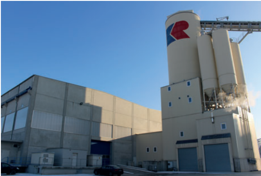
The Liebherr mixing tower supplies both the floor element and new concrete block production lines with concrete