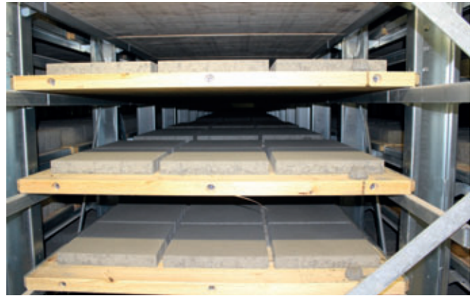
The curing rack – a giant-sized climatic chamber

mm and its large absorption area also makes a contribution to better noise insulation.