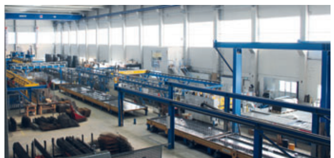
View of the floor element manufacturing line commissioned in 2012