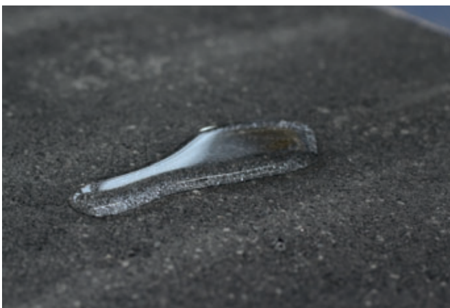
Concrete products manufactured on the Masa system possess a very dense surface structure

Completed packages of blocks then run through a foil application device and in the following stages are strapped round horizontally and/or vertically depending on product. A transfer device at the end of the transportation track removes these strapped packages and places them on a package conveyor, which has been set up at an angle of 90° and which conveys the packages of blocks to the outdoor area. The packages then travel to their outside storage area by means of a forklift. The last package conveyor is almost 24 m long, in this way providing sufficient intermediate storage in the outside area until the packages are removed, so that the production line inside is not interrupted if the forklift is being utilised in the warehouse.