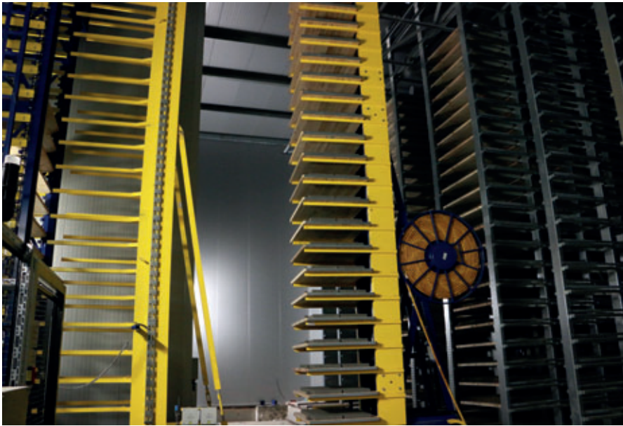
Transfer table and finger car system with intermediate storage