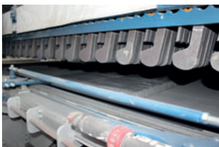
KBH Dancing Weights ageing system

The KBH Dancing Weights system with its noise protection enclosure is suitable for practically every block format (including multi-format slabs, circular sets, and polygonal blocks). They can be aged in layers fully automatically. Process intensity can be individually adjusted, thereby eliminating