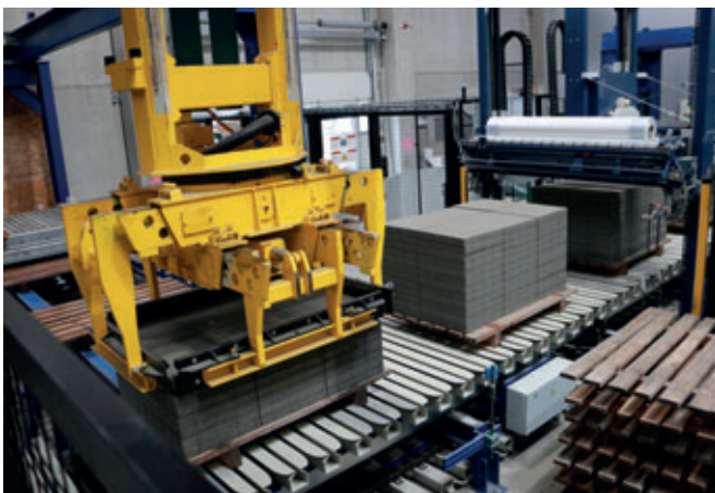
Masa Cuboter: The entirely servo-controlled packaging unit takes block layers from differing pick-up positions and sets them down on the transportation track to form a package