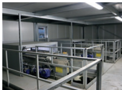
Noise protection enclosure with gallery