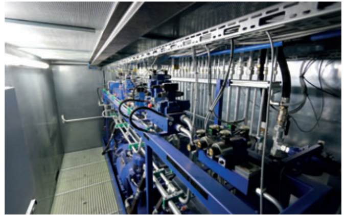
View inside the Masa Hydraultainer