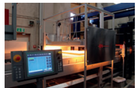
Hardening the protective coating under UV light