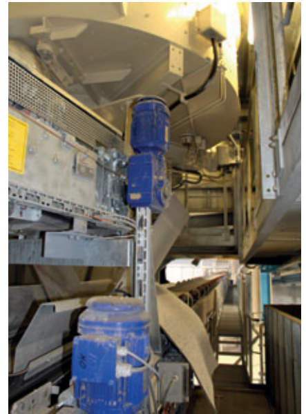
The Liebherr RIH 0.5 Mixer in operation producing facing concrete which is discharged onto a conveyor belt