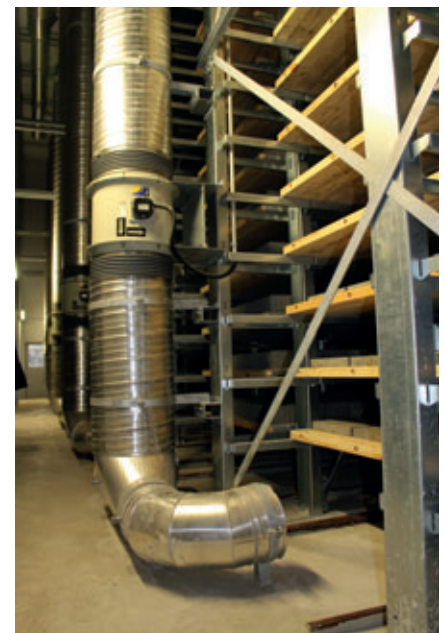
The Rotho circulation system generates a uniform climate

The curing system's total capacity is 7,392 boards; this entire giant-sized climatic chamber has been insulated including the transfer table area. Heat and moisture are exploited from the hydration process with the blocks and the Rotho circulation system generates a uniform climate. The circulation system is set up modularly and can be later expanded with a Rotho ProCure System (heating and moisturising), if required.