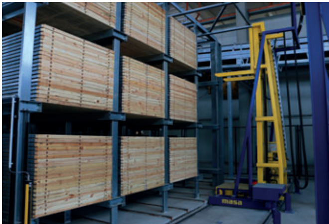
A pallet transporter takes full stacks and brings them automatically back to the concrete block making machine or else places the stack in an intermediate storage rack