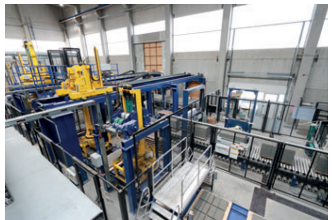
View of the dry side