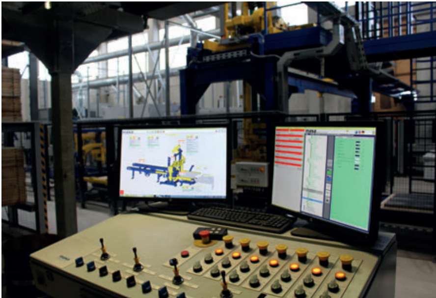
Monitors with 3D visualisation also provide a complete overview of the dry side