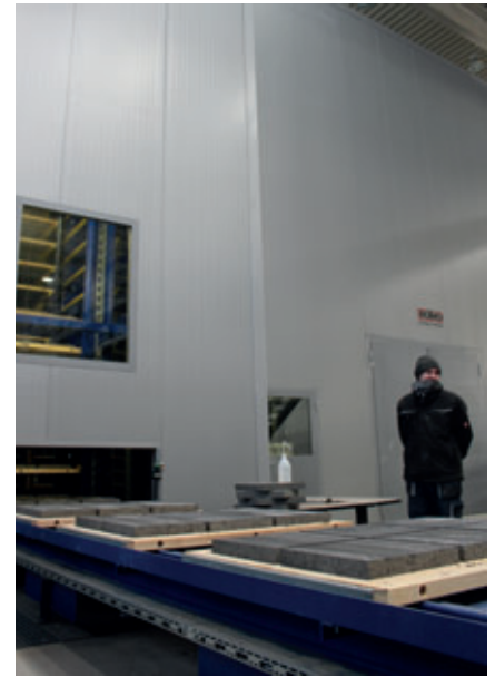
The boards are transferred by the lowerator individually to the mobile elevating conveyor or on the dry side

The entirely servo-controlled packaging unit takes block layers from differing pick-up positions and sets them down on the transportation track to make a packet. A feed-in conveyor thrusts a transport pallet, on which the block package will be securely