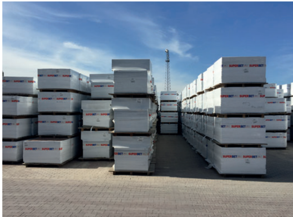
Attention to Quality and Detail throughtout the Superbet operation includes the order and cleanliness of the stock area. All cubes are palletized, professionally packaged with the Superbet logo, protection foil and all layers are separated to allow for air circulation and to protect the surface from blemished caused by transportation.

a consistent climate (temperature and humidity) throughtout the curing chamber, regardless of the season. The compression strength testing we have done has shown that there are no differences in strength regardless of which level the product is