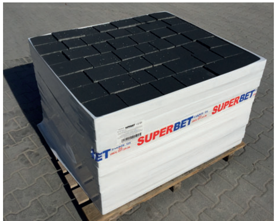
Superbet is dedicated to producing high quality valued added products.