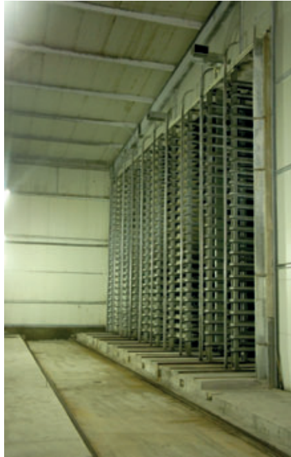
2015 – Single Atmosphere Curing with transfer car area and open rack area curing at 30°C and 90 % rH.

pliers promise lower cement costs, better quality, higher strength and reduced efflorescence. I have stopped believing these stories, but I have a long and successful