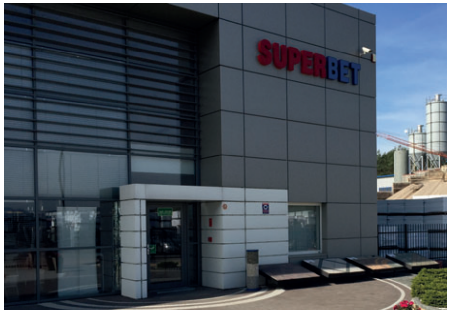
Superbet is located in Łosice, Poland