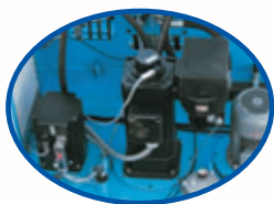
New Servo Pump Unit