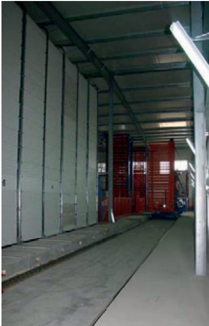
2001 – Transfer Area with 11 individual curing chambers and insulated doors