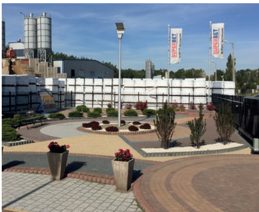
Superbet's show garden

not completely ended our study in cement reduction, our results so far are very gratifying.” As a result of these benefits, Józefa Zawadzki has placed an order for a Quadrix System for the 2 nd Qmag production line. ■