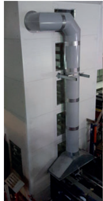
Quadrix 300-150 Heating & Air Circulation Unit with Nautilus™ air distribution duct prior to and after