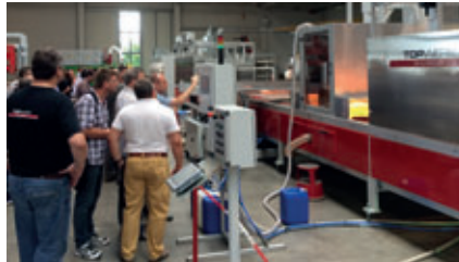
Presentation of the universal print-coating line for concrete pavers and panels during the in-house trade fair at SR-Schindler