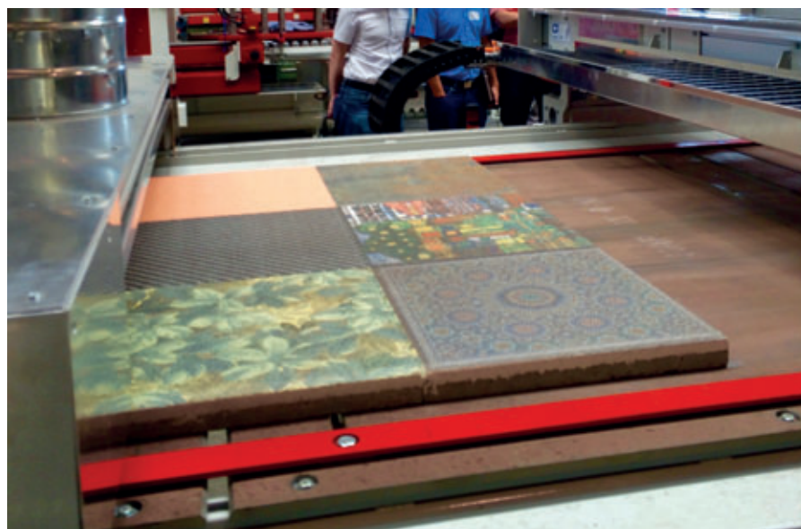
Printed panels before sealing

The concrete panels pass through several stations in the new line before a bare concrete panel becomes a durable motif panel. First of all the panels are cleaned with a brush before being sprayed with a primer in preparation for printing. Infrared heating ensures fast drying of the primer. Only then do the panels drive into the printing station.