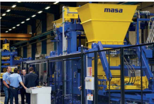
The machine demonstrations were a special attraction – In addition to the Masa concrete block making machine XL 9.2 ...

After so many technical impressions, in the late afternoon the guests were invited to