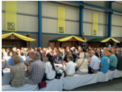
... to the approximately 300 guests from all over the world.