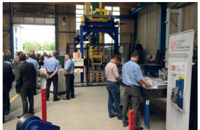
... the performance of the Masa Cuboter was demonstrated live