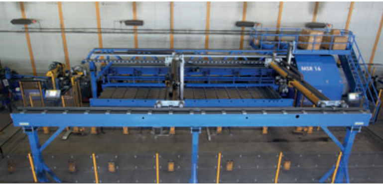
The new production line for reinforcement manufacturing: VGA Versa (rear left), MSR16 2BK (rear) and the reinforcement robot (front).

The longitudinal and transverse bars are produced by the MSR16 2BK multi-rotor straightening machine. Similarly developed by progress Maschinen & Automation, it is used for the straightening, cutting to length and bending of reinforcing steel off the coil with a diameter of up to 16 mm. The proven progress multi-rotor straightening technology provides for a high straightening quality, while the new technology leads to a lowering of the noise level and power consumption and the electrical servo drives guarantee ease of maintenance and high operating reliability. One outlet of the type-2BK can be used for single or double-ended crimping of the bar ends.