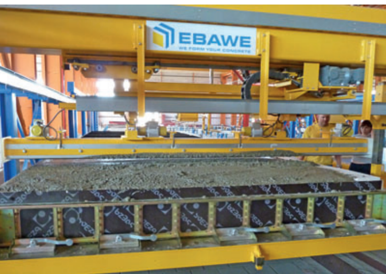
The freshly poured concrete is drawn off to the desired level and compacted with a vibrating levelling beam.