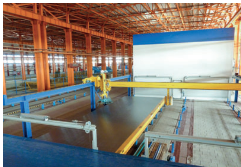
Following a pre-curing phase, the sandwich wall is smoothed with a power trowel.