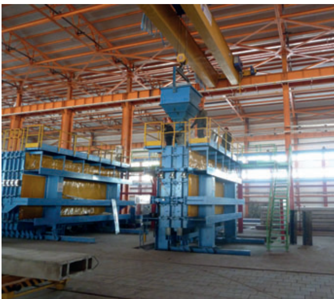
Battery mould for production of partition walls

initely worthwhile: In the production of ventilation shafts, the slightly conical cores are not drawn, but lowered a few centimetres to simplify the mould stripping process. The production is also cost-effective and space saving.