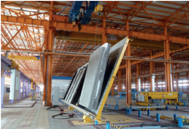
Raising the finished sandwich wall with the help of the tilting mechanism.