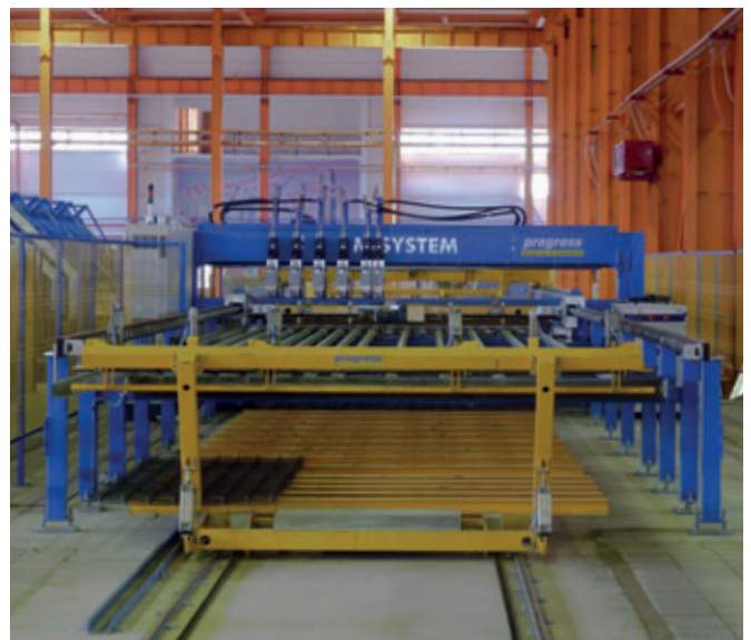
The M-System Evolution mesh welding plant receives the required data from ebos. The reinforcement mesh are produced just-in-time and precisely in accordance with specifications.