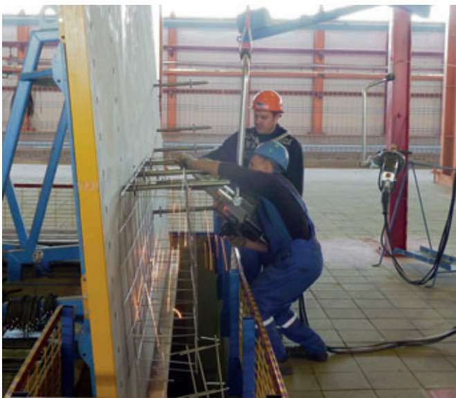
Vertical welding manipulator for welding reinforcement cages