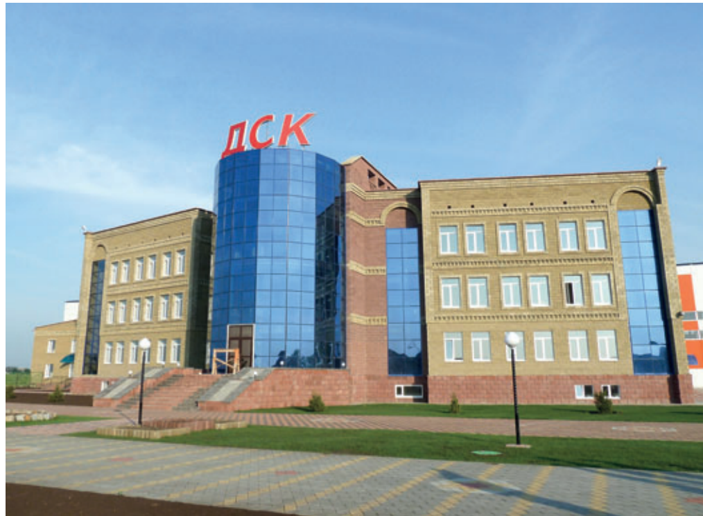
In addition to a new precast plant, TOO "Kostanay-MBI" also constructed a new office building in Kazakhstan. All footpaths were designed with visually appealing paving stone from the associated concrete paving stone plant.

tecnom, an affiliated company, was responsible for delivery of one battery mould each for partition walls, stairs and ventilation shafts. The use of battery moulds to manufacture the latter is unique and def-