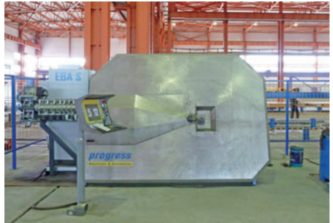
The EBA S series automatic stirrup bender produces stirrups and bars with great accuracy.