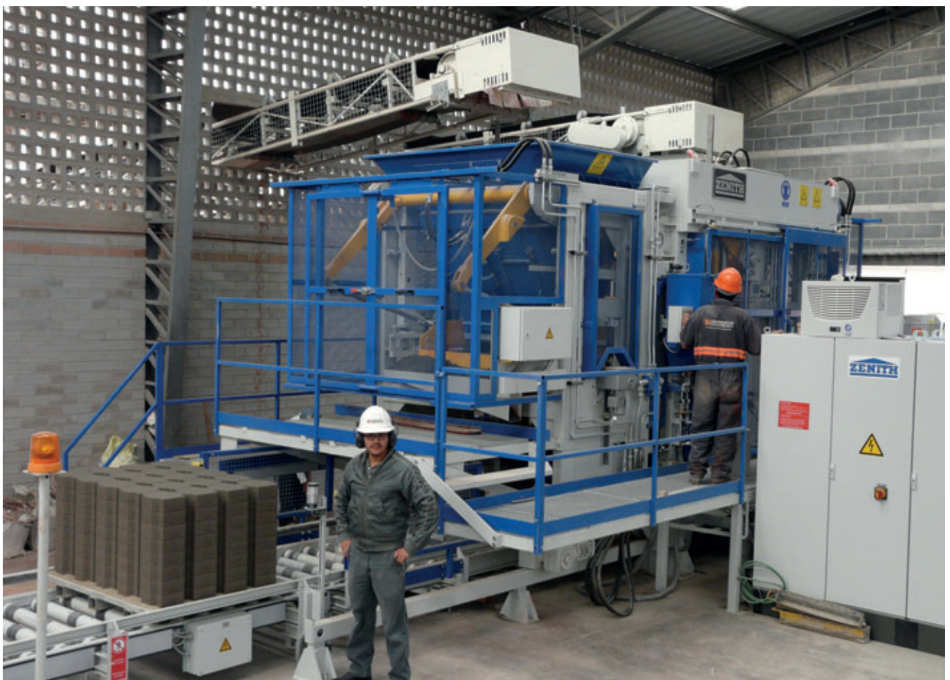
Zenith 844 SC Multilayer machine producing pavers with face mix

layer machine was made due to the high expertise of the company in these types of machines worldwide, the reliability of German technology, the high quality achieved of the final products and the diversity of products that can be produced in the machine. The acronym SC from the 844 machines, comes from Speed and Comfort, which is the strongest and fastest machine of the Multilayer series, with higher output due to the higher speed reached by stronger motors, vibration and hydraulic