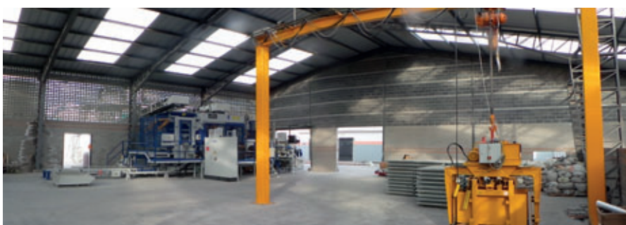
Probst packaging clamp