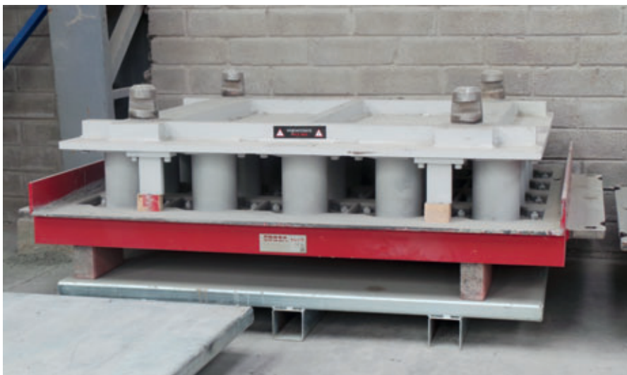
Kobra paver molds for perfect and accurate production