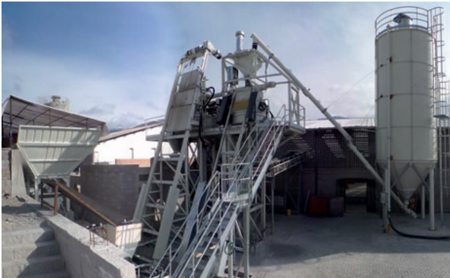
Euromecc batching plant with cement silo, aggregate hoppers, skip elevator and mixers

supplied a complete batching plant in fully automatic design, with two mixers to feed the Zenith machine continuously with a homogeneous mixture for the basic and face mix.