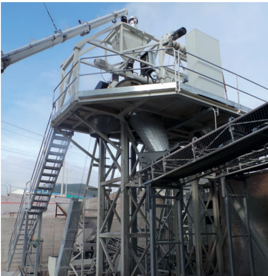
Euromecc mixers platform and belt conveyor for feeding the Multilayer machine

Now with a completely new plant with German and Italian technology, D' Concreto in Ecuador is able to provide the Ecuadorian Market with consistency and high quality products. They have the right technology to be prepared for the worldwide new trends of shapes, colors, textures and sizes of pavers and curbstones. ■