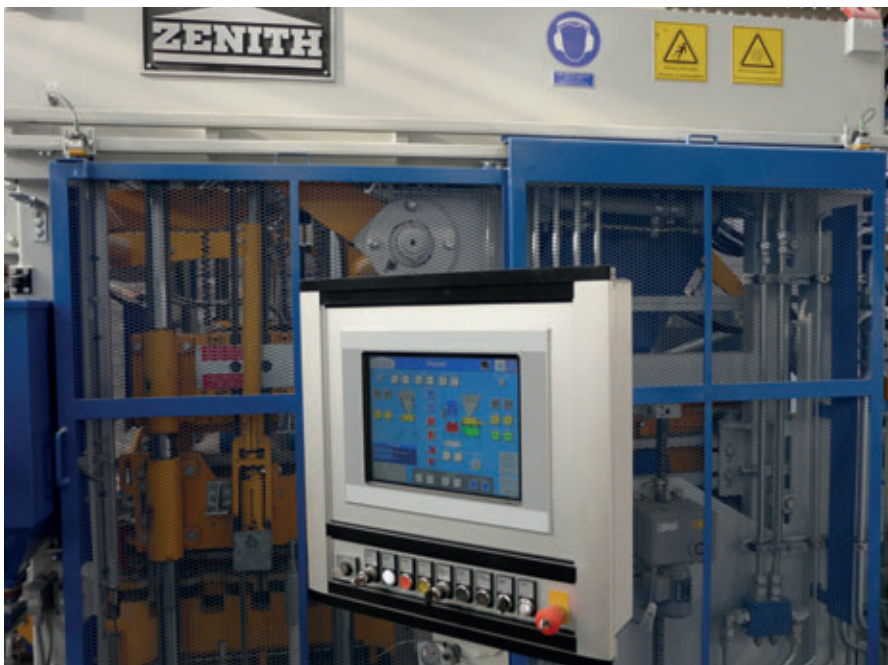
Fully automatic control system for the Zenith 844 SC machine

To achieve perfection, high production and the best quality, Euromecc S.R.L. from Italy,