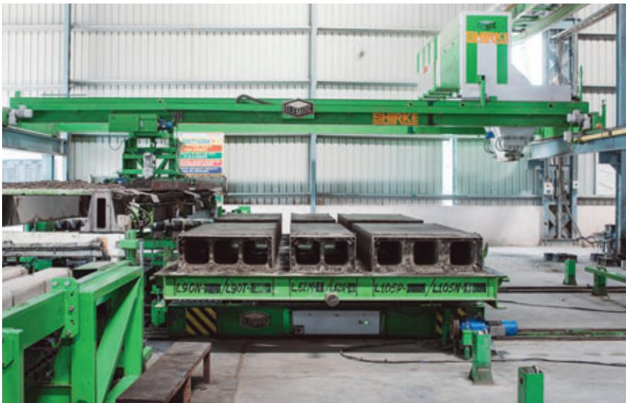
The '3S' column is a unique product of Shirke, having hollow cores and relatively new technology for Elematic. The molds for B.G Shirke were developed based on a previous machine model for a similar hollow core product.

Therefore, ambitious mass housing projects need time tested and proven prefab technology to be able to succeed with a timely and efficient manner. The customized equipment from Elematic to produce 3S Prefab elements as per Shirke's own design on mass scale has been successfully put to its use towards executing mass housing projects.