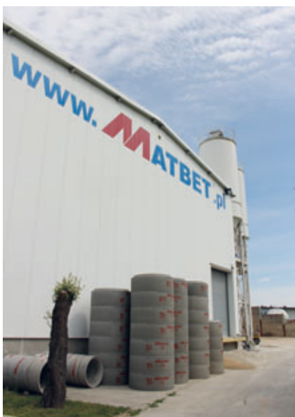
Matbet concrete plant in Tarnowo Podgórne, Poland

At its plant in Poznań, Matbet Beton produces concrete rings, concrete base elements, concrete collecting tanks and concrete manholes, as well as concrete pipes and reinforced concrete pipes in high quantities with its modern, computer-guided systems. It can therefore offer complete solutions for the construction of drainage, sanitary and rain water systems. Matbet Beton is one of the largest manufacturers of reinforced concrete rings and pipes in Poland. All of the products produced are accompanied by the necessary certification and fulfil all of the necessary quality standards. The main production programme is supplemented by road and fencing elements.