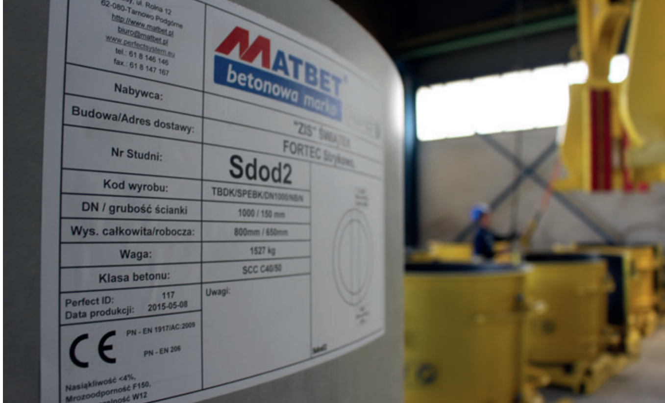
A label containing all relevant details and parameters is applied to the pre-cast concrete manhole bases.

proceeds to the next mould. An employee sticks a label containing all of the relevant data and parameters to the manhole surface of this exact component. The custom-made monolith can therefore be precisely attributed, right up until the moment at which it is installed.