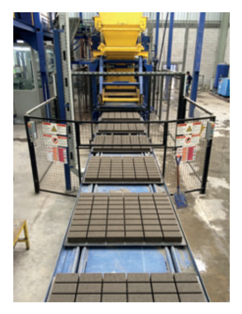
Fresh paving stones are leaving the block making machine XL 9.1