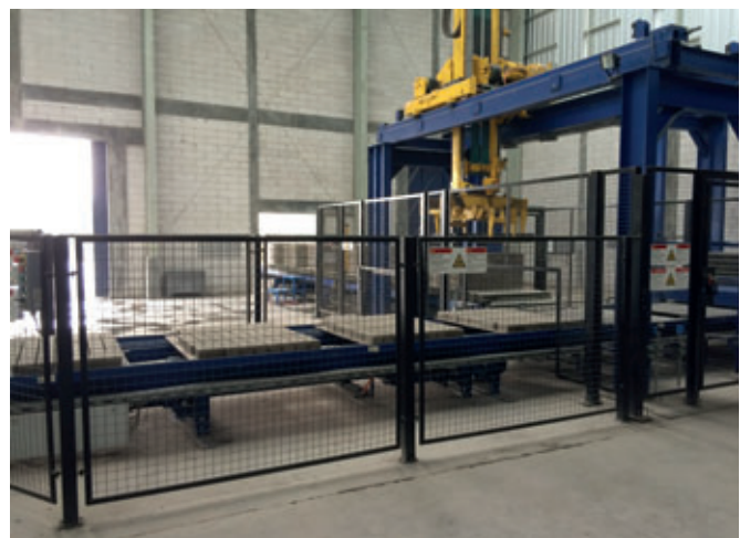
Masa Cuboter in operation

site the stone packages are strapped horizontally and vertically for outside storage.