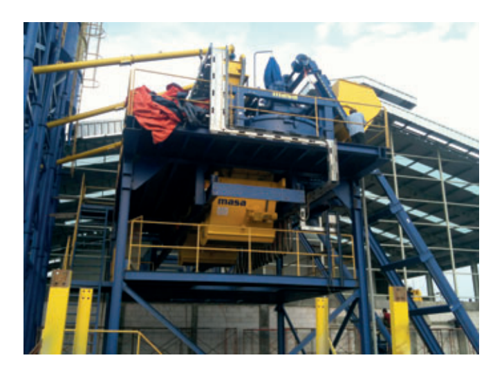
View onto the new Masa PH 1500/2250 and onto the double bucket conveyor