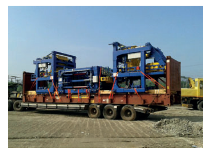
Delivery of the Masa concrete block making machine XL 9.1