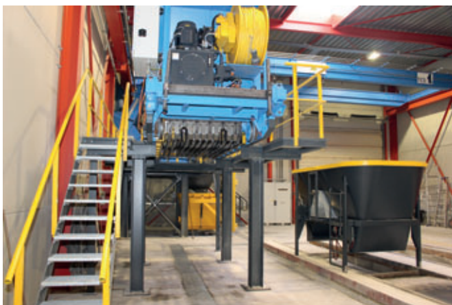
Echo Precast Engineering Slipformer in parking position

The whole plant is managed by I-Theses Autofloor-Software: The complete layout drawing is prepared in AutoFloor and production documentation – including work sheets, labels, bed layouts and bills of materials – can be generated in BedPlanner. It is possible to create files in PXML, an open data interface invented by Progress