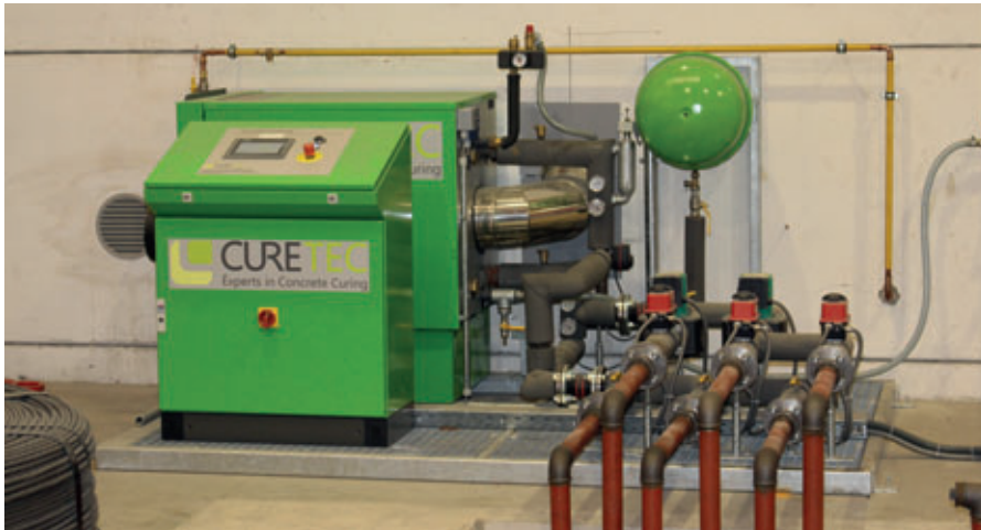
CureTec heating system