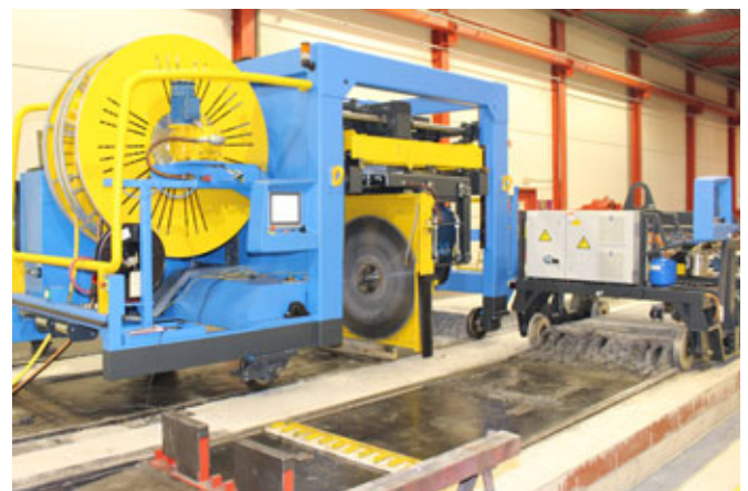
Echo Precast Engineering multiangle sawing machine