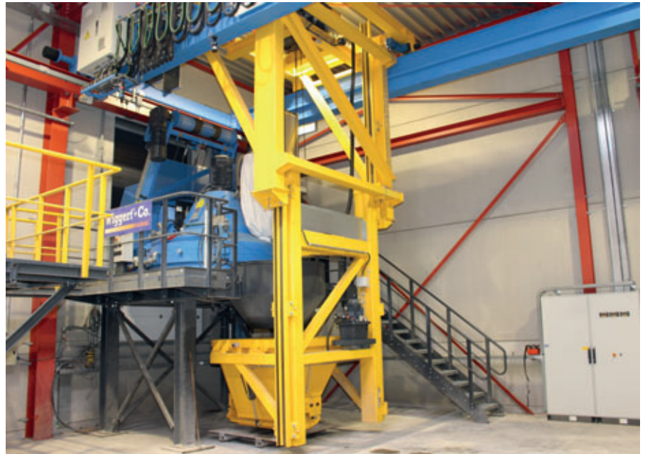
The batching plant contains an Ebawe special concrete distributor as well as a Wiggert planetary mixer

The major reason for this venture is Echo Precast Engineering's focus on innovation. New products can be tested immediately under real factory conditions. This significantly reduces time to market and ensures that products have a high degree of maturity once delivered to customers. The company is already successfully testing their newest generation of extruders, plotters and fully automatic sawing machines. Beside to prestressed hollow core slabs, a wide range of concrete elements can be produced on this plant, such as hollow