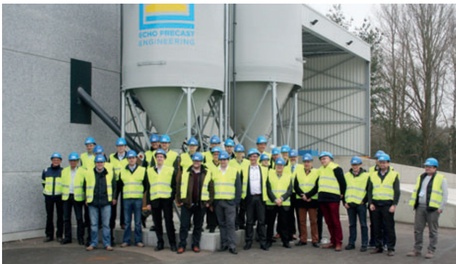
Delegates from FloorOffice Conference in March 2015 visited the Demo Plant in Houthalen

Group, the company group Echo Precast Engineering has been part of since October 2012. The PXML format enables to exchange data with the brand new Echo Precast Engineering bed plotter and the Echo Precast Engineering automatic sawing machine.