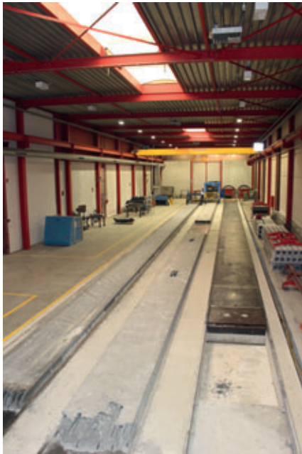
View on the production beds of Echo Precast Engineering's Demo Plant

Echo Precast Engineering is a technology supplier for the precast concrete industry focusing on the production of pre-stressed concrete products. In the year 2014 the company invested in a test facility – a fully operational plant for the production of pre-stressed concrete elements. The test plant consists of 2 production beds with a length of 50 meters and a width of 1.2 meters as well as a 36 meters long special bed for slabs with a width of 1.5 meters. A batching plant with 5 aggregate pits, 2 cement silos and a planetary mixer allows the production of high quality concrete. Additionally, there is a concrete laboratory with state-of-the-art measuring equipment.