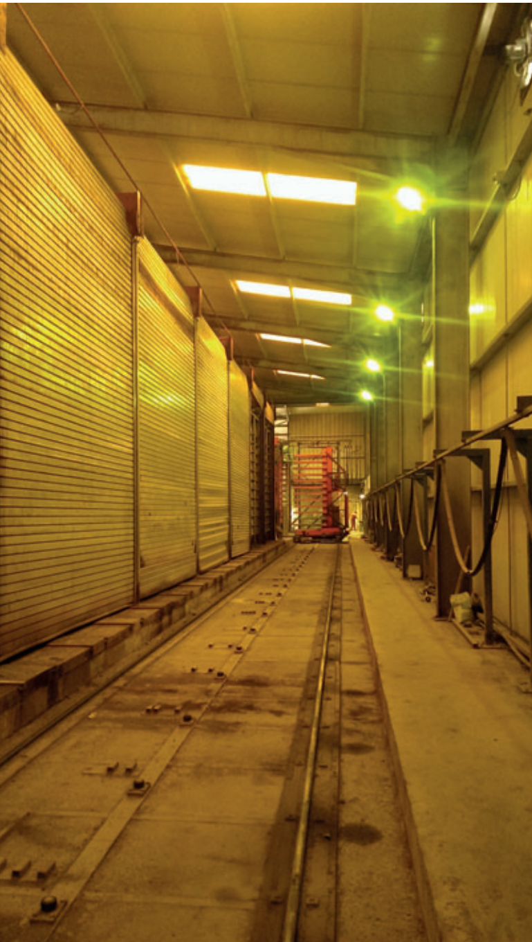
Before: transfer car area with building insulation & roller doors