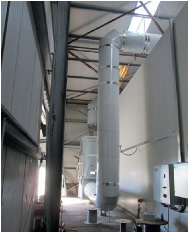
After: stainless steel finished and insulated air heating unit with aluminum frame - 50% less heating capacity than previous model. GFK (glass fibre coated - inside and outside walls) duct with 50 mm Polyiso insulation. Tongue and groove construction with stainless steel compression bands at all joints. Insulation panels on chamber walls and ceiling tongue and groove design with sealed u-channel at the floor and insulated and sealed joints.

(24/7) you can feel a very slight movement of air throughout the racks system. There is no hurricane force wind in one area and complete stillness in another. Bringing the operation together, Kraft's electrical engineer, Phillip Ennulat, de-