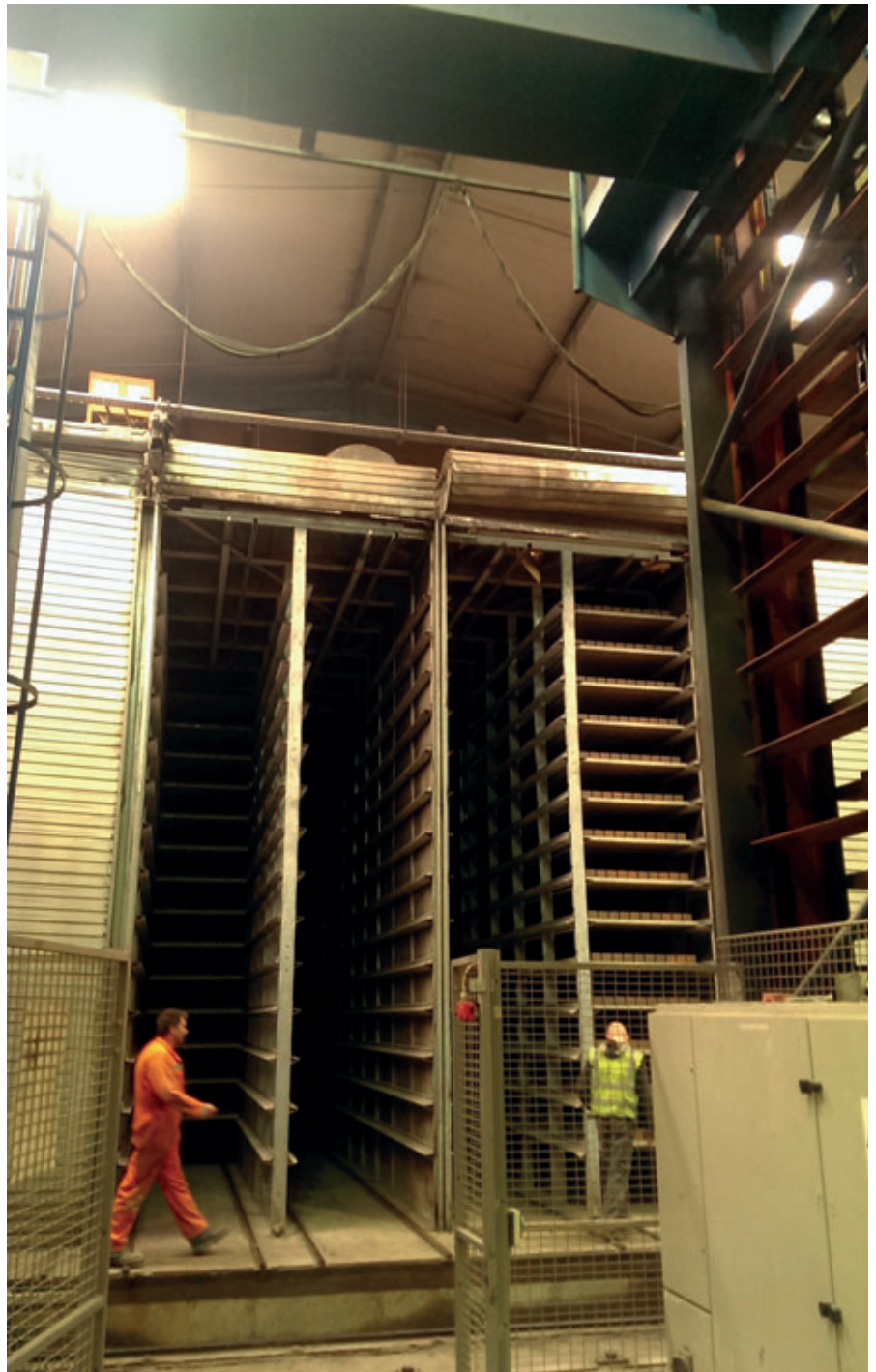
Before: picture of transfer car area taken from beside the elevator

Fast forward to 2014: Kilsaran survived a rough and difficult economic climate after having steadily gained market share throughout the United Kingdom. The increased demand for superior concrete landscaping products brought them right back to Kraft. While Kilsaran's two Hess production plants were furnished with curing equipment, they wanted something that would provide consistent temperature and humidity control and knew that Kraft's