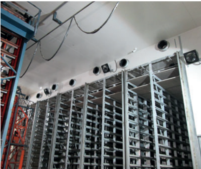
After: picture of insulated transfer car area, air circulation & warm air supply

machines could deliver. "With one each very productive Hess RH 1500 and 1200 block paving machines, the lack of proper curing was preventing us from operating at full capacity as well as serving our customers," explained Director of Production, Sean Brady. They knew they needed to work with a team of experts who were on the front of curing technology.