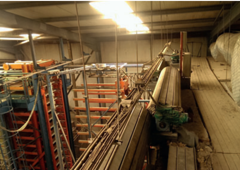
Before: transfer car area – elevator & lowerator