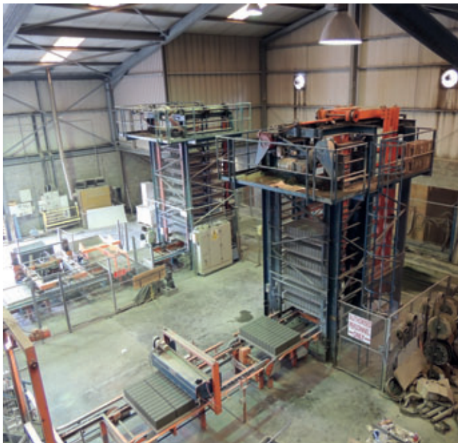
Before: elevator & lowerator area with raised maintenance platforms

Kraft designed their air distribution system with hundreds of adjustable openings located throughout the curing chamber for the supply and return of the air. The openings are adjusted by a Kraft service technician when they commission the equipment and, once they have the +/- 1 °C temperature consistency, the openings are locked into place not to be touched again. When the system is running