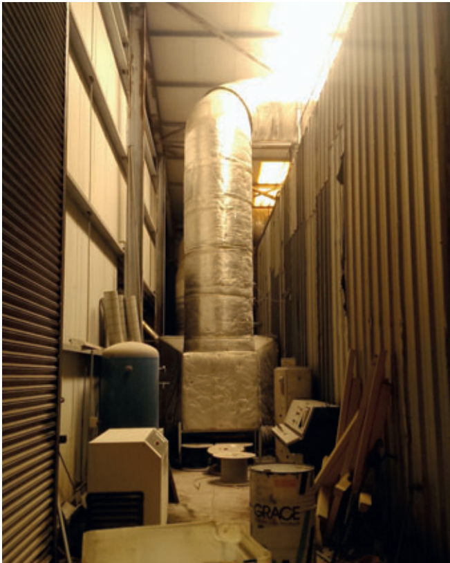
Before: oversized air heating unit, "insulated" with foil coated fibreglass wool and mounted with chicken wire. Insulation panels on chamber were leaking and joints (connection between walls and ceiling panels) were not sealed.