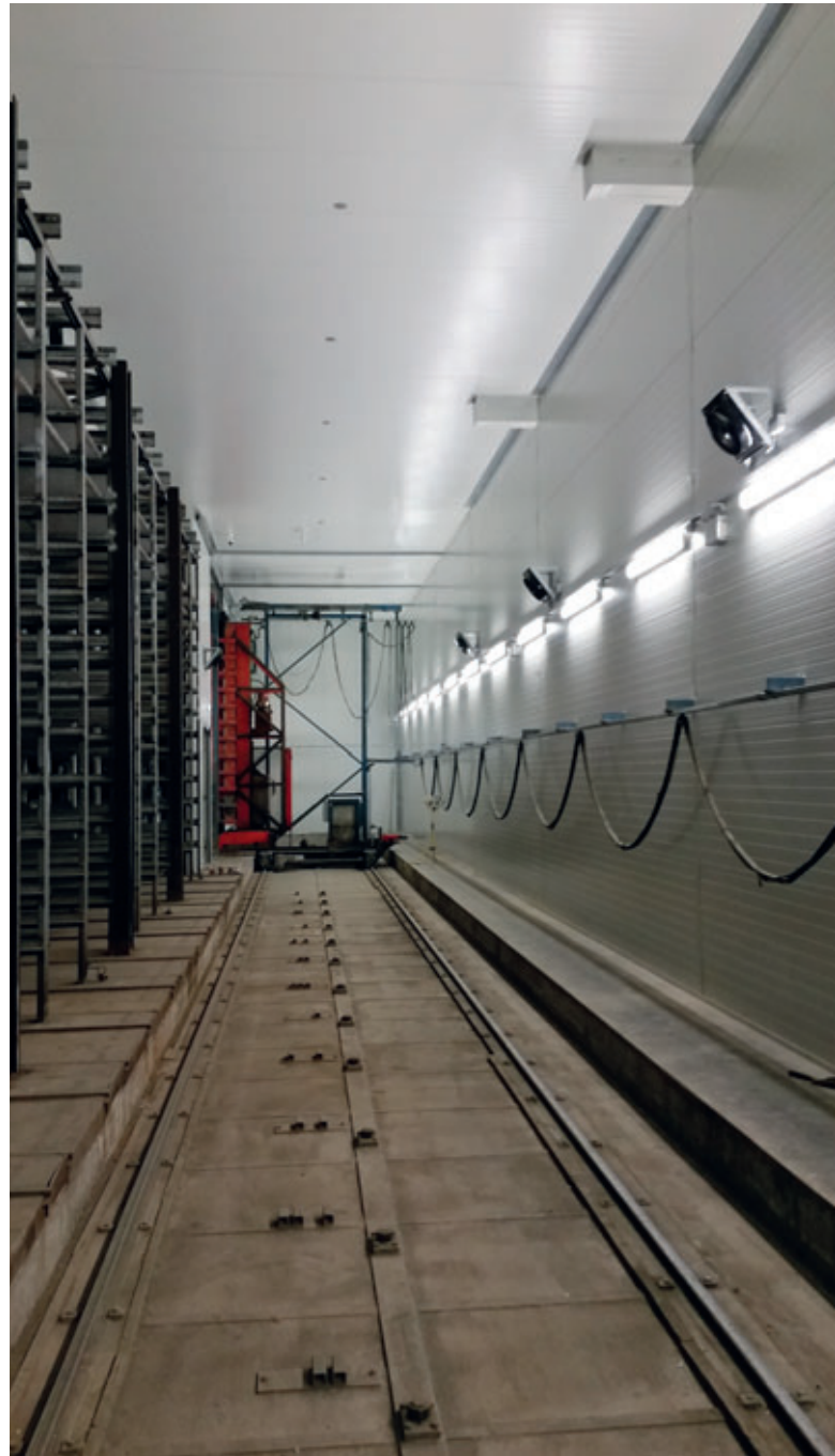
After: insulated walls and ceiling, air circulation & lighting

even taken place in just under three weeks. Kraft's two teams of 20 total installers completed the mechanical installation of the complete insulation and curing systems for both plants in just three weeks! Electrical installation and commissioning were completed by February 2 nd and production commenced on time with product going in to the newly renovated curing chambers in a complete and consistent atmosphere. "We had our share of worries that the schedule was just a bit too ambitious compared to the amount of work that needed to