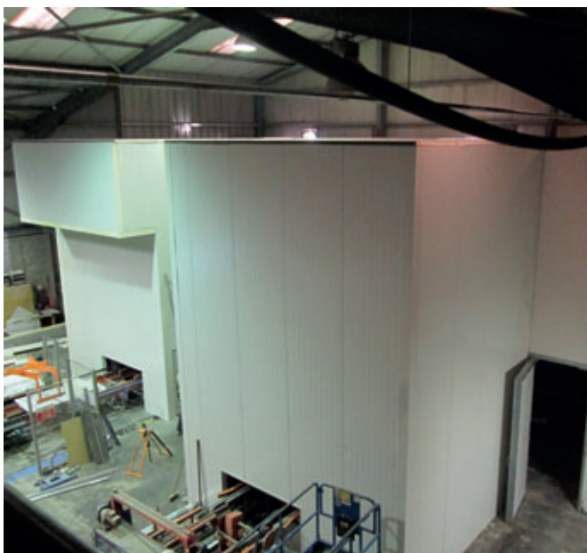
After: elevator & lowerator enclosed with insulation panels during construction. Space for raised maintenance platforms and equipment door for access