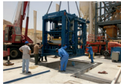
United Arab Emirates