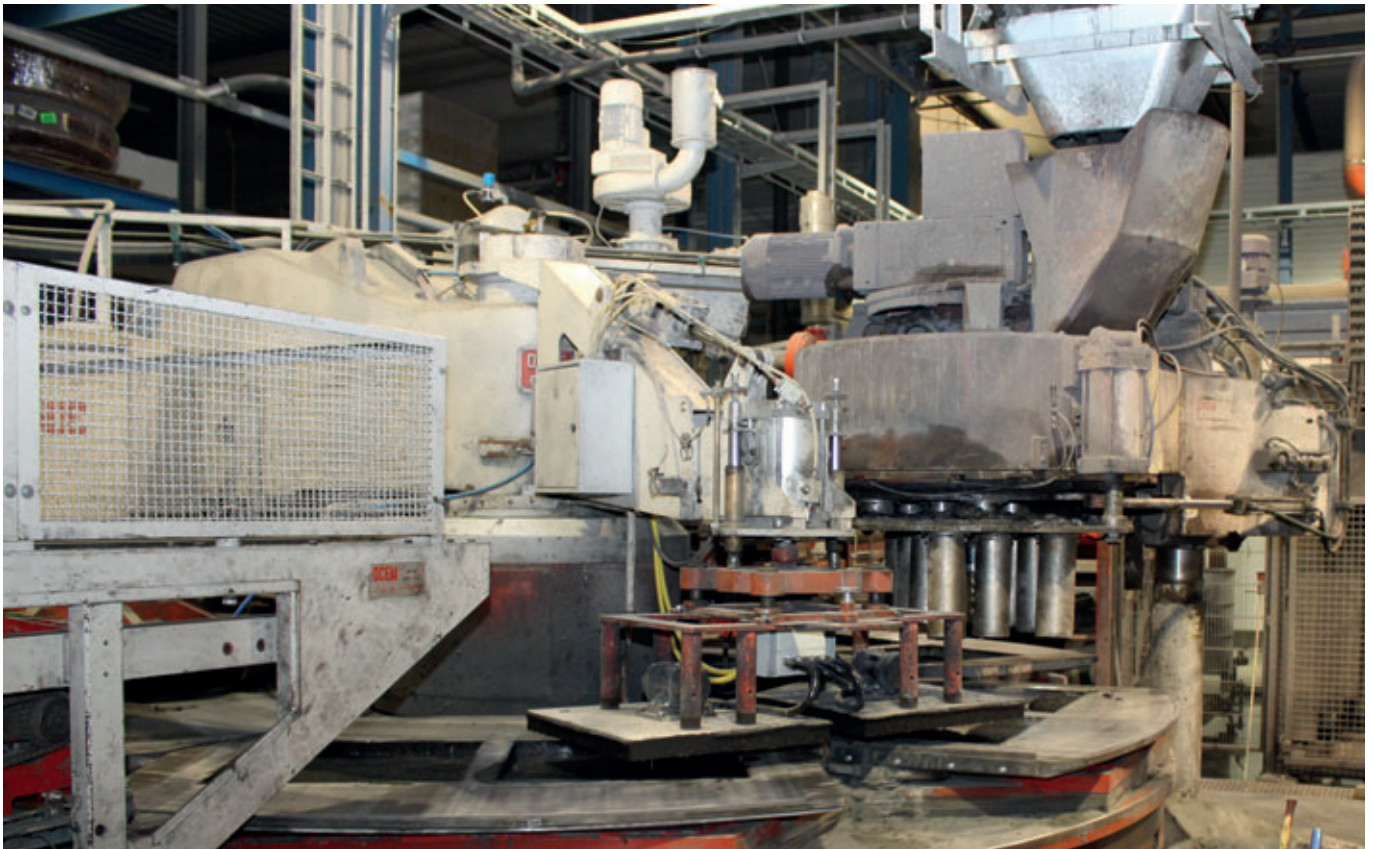
Hermetic turntable press with a pressing force of 14,000 kN from SR-Schindler

suitable for these products due to the size of their production pallets. They are operated by Excluton with production pallets from Assyx measuring 1,450 x 1,250 mm. The third machine runs with production pallets measuring 1,450 x 750 mm, similarly from Assyx.