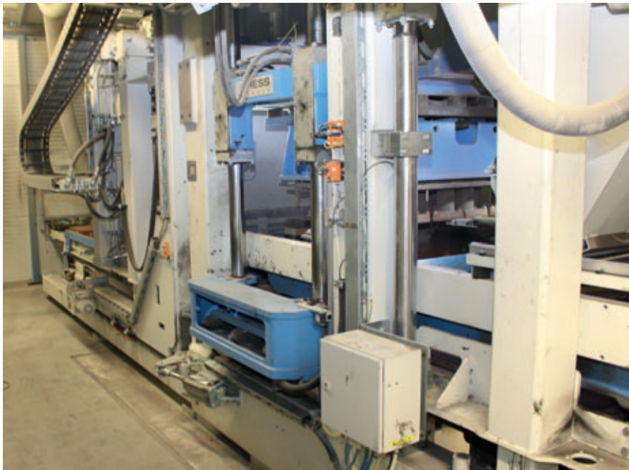
3 rd Hess RH 2000-3 MVA, production pallet size 1450 x 750 mm, commissioned at the start of 2014

trend-setting and innovative – combining high quality and beautiful forms. For Excluton, therefore, the quality of the concrete products from its own production clearly stands out from the crowd.