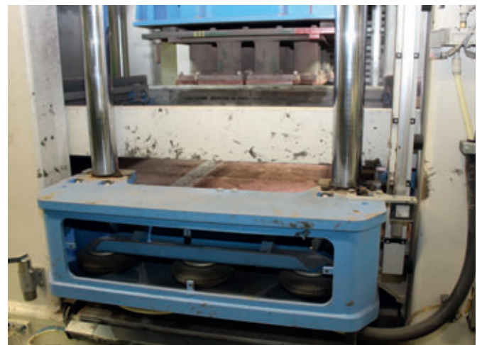
Paving stone production with the third RH 2000 at Excluton