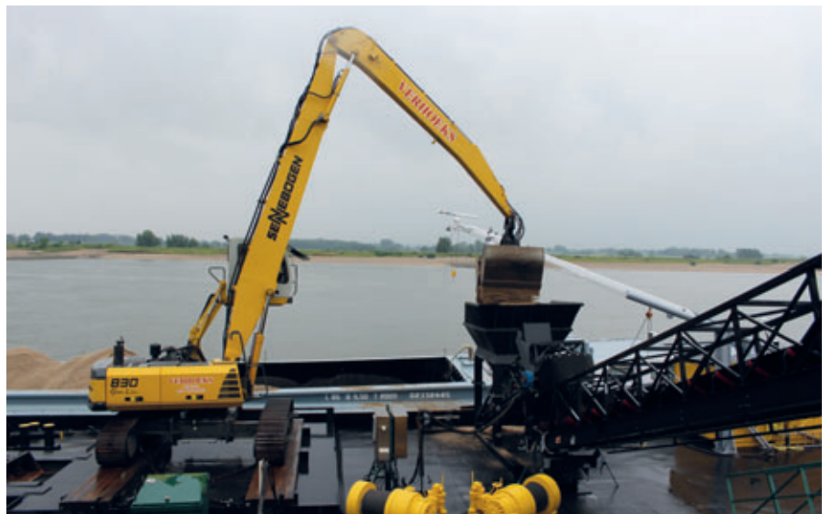
Many raw materials are delivered to Excluton by ship.

Excluton is constantly informed about current needs and new trends through intensive contact with customers, architects, garden designers and specialist groups. These co-operations and information make it possible to continuously optimise the products and to react rapidly to changes in the market. It is just as important for Excluton to develop new ideas, designs and products and to be