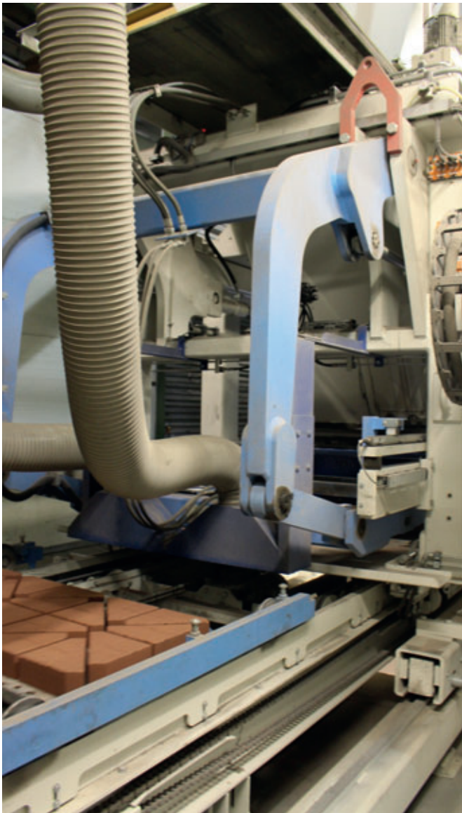
All the mechanical components are extremely robust and equipped with modern electronics.