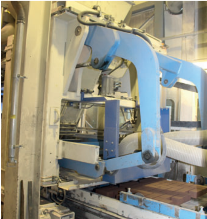
1 st Hess RH 2000-3 MVA, production pallet size 1450 x 1250 mm, commissioned in mid-2011