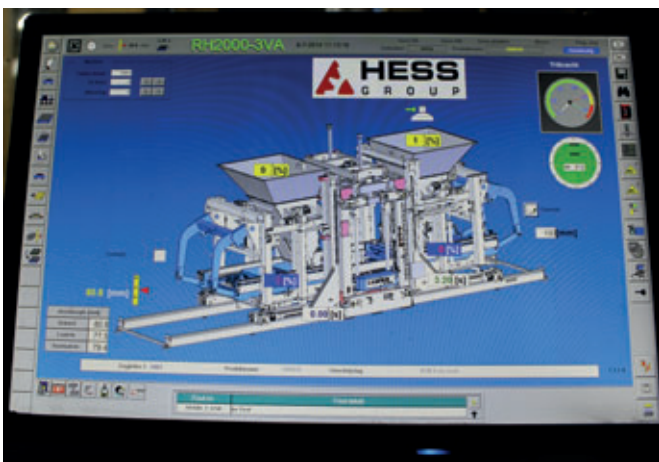
Every production sequence of the RH 2000-3 MVA concrete block making machine can be directly observed from the control room.