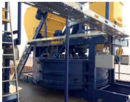
Final assembly of the Masa PH 3000/4500 mixer