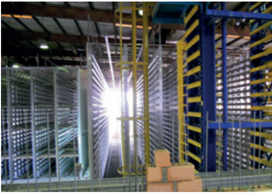
HS Anlagentechnik supplies curing chambers in a building kit system.

removed from storage, assembled into packets and prepared for dispatch. The required storage space capacities must be stable, load-bearing and dimensionally accurate.