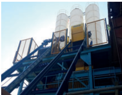
Looking upwards to the Masa mixers from the PH model range

Curing chambers are the logistic link between the wet and dry sides in these production lines. The freshly made elements are stored and the hardened products