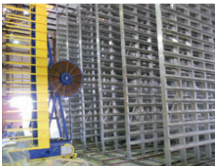
The new HS aluminium rack with the Masa finger car