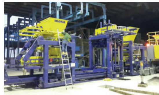
Assembly of the Masa XL 9.2 concrete block making machine