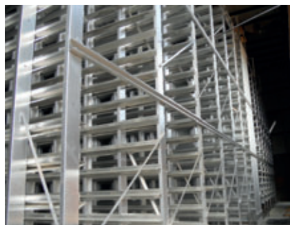
The curing chamber installed by HS Anlagentechnik has 22 levels with a distance between levels of 330 mm.