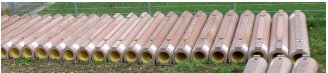
A typical on-site storage set up for Perfect Pipe DN250 in Endingen, Baden-Württemberg

Sturdy reinforced or non-reinforced concrete pipe have per se a greater weight per linear meter than other pipe materials. So, particularly as Perfect Pipe is designed as a