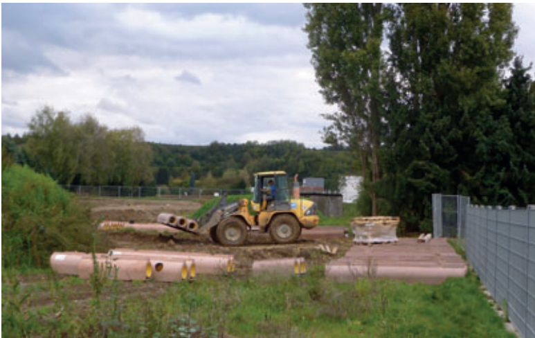
The pipe can be moved to the site with simple equipment

base pipe, manufacturers of Perfect Pipe place great emphasis on workplace safety in the production, transport and installation of the product. At the plant, as a general rule, almost all production stages are fully automated once the HDPE liner has been fabricated, so that the workers are simply running checks and carrying out easy manual work. In one operation, for example, lifting anchors are manually fixed into the concrete moulds. These anchors are firmly embedded in the concrete once the pipe is cured and provide a basis for unloading safely on site and controlling how the pipe is lifted into the trench. The base pipe geometry makes both transport and on-site storage easier. The pipe can be stored under stable conditions. Employee safety is also taken into account where laying is concerned. A positioning tool shows workers the ideal position for the connector when jointing the pipe and also allows them to guide the pipe into place perfectly while protecting their hands. The fact that concrete pipe manufacturers are building targeted measures into their new processes to increase safety at work for all those involved with production and installation is another factor appreciated by customers and contractors likewise.