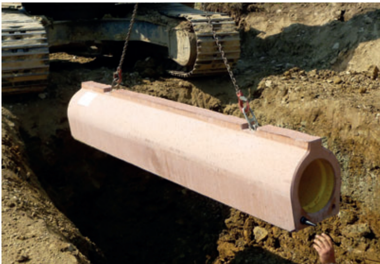
Lifting the prebed pipe into place using the lifting anchors permanently embedded in the concrete

base pipe, manufacturers of Perfect Pipe place great emphasis on workplace safety in the production, transport and installation of the product. At the plant, as a general rule, almost all production stages are fully automated once the HDPE liner has been fabricated, so that the workers are simply running checks and carrying out easy manual work. In one operation, for example, lifting anchors are manually fixed into the concrete moulds. These anchors are firmly embedded in the concrete once the pipe is cured and provide a basis for unloading safely on site and controlling how the pipe is lifted into the trench. The base pipe geometry makes both transport and on-site storage easier. The pipe can be stored under stable conditions. Employee safety is also taken into account where laying is concerned. A positioning tool shows workers the ideal position for the connector when jointing the pipe and also allows them to guide the pipe into place perfectly while protecting their hands. The fact that concrete pipe manufacturers are building targeted measures into their new processes to increase safety at work for all those involved with production and installation is another factor appreciated by customers and contractors likewise.