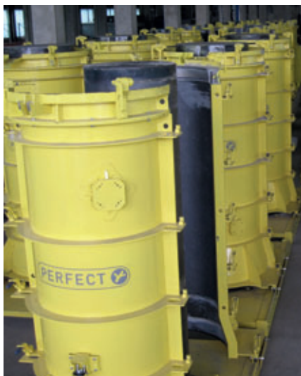
Equipment for large scale production of wet-cast concrete pipe

Schlüsselbauer Technology GmbH & Co KG Hörbach 4 4673 Gaspoltshofen, Austria T +43 7735 71440 F +43 7735 714456 sbm@sbm.at , www.sbm.at www.perfectsystem.eu