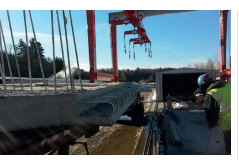
Precast concrete deck panel for the new bridge.