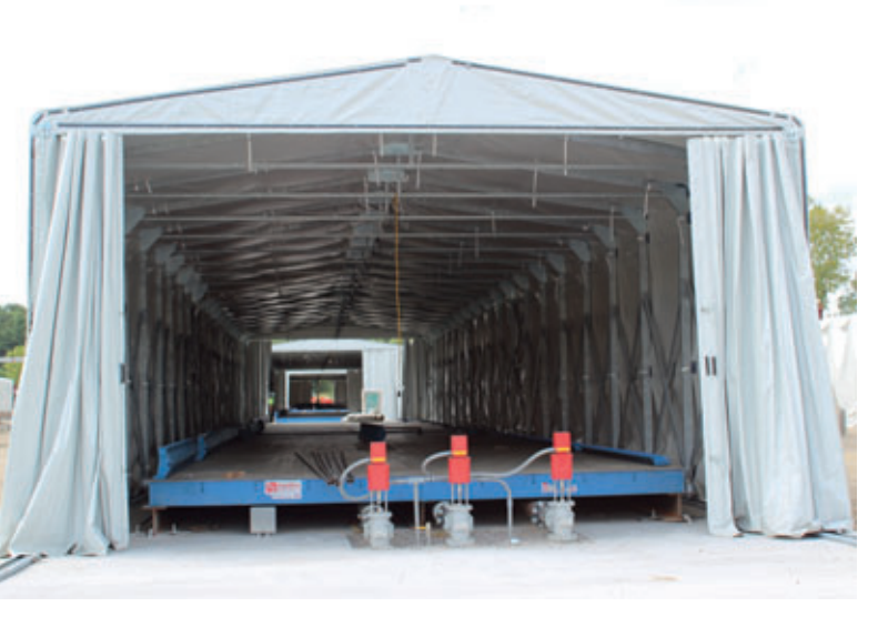
Heavy-duty valves distribute the vapor to the curing tables.

Corporation, located strategically half way between New York and Boston in Pittsfield, Massachusetts. The company specializes in large scale precast elements for bridges, railway stations, manufacturing plants, stadiums, retail and industrial buildings and multi-level parking facilities. Unistress has completed more than 500 precast structures throughout the Northeast, and received numerous awards of excellence. Unistress has been selected by Tappan Zee Constructors (www.tappanzeeconstructors.com) to provide 6000 precast concrete deck panels for the new bridge. The $70 million contract is the largest in the company's history.