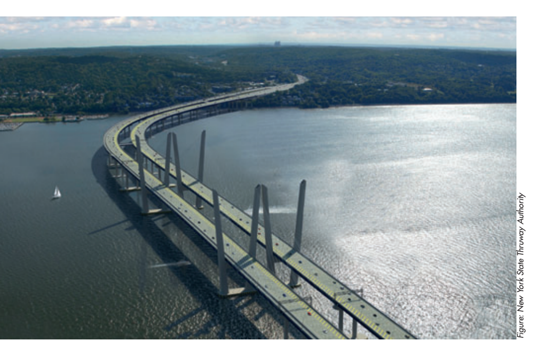
The "New NY Bridge" is designed to cope with more than 150,000 vehicles per day smoothly.

After a long delay, plans for a New NY Bridge to replace the Tappan Zee are becoming a reality. The first span of the new twin-span bridge, started in 2013, is scheduled to open in 2016, and the new bridge should be complete in 2018. The new bridge will be designed and constructed to last 100 years without major structural maintenance. The 3.1-mile twin span cable stayed bridge is the largest bridge construction project in New York's history, with a total cost of $3.9 billion.