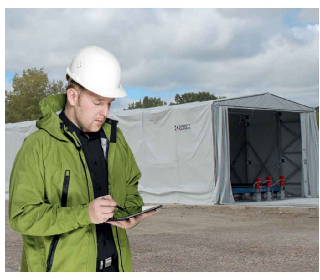
The VaporWare system allows for control and manipulation of all curing procedures over the internet.

meters). Inside the curing enclosures, the vapor creates a specific curing climate that provides the optimal curing conditions of elevated temperature and humidity for the specific concrete product. This design allows for the independent production of up to 18 large scale precast products at the same time.