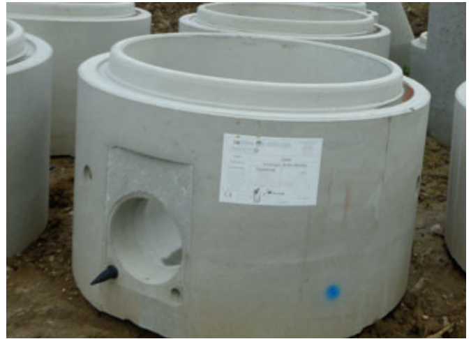
Connecting pipe to manhole is also easy using connectors and shear load pins