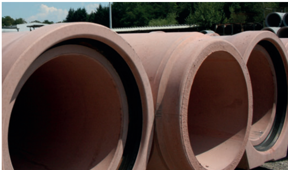
Concrete base pipe up to DN1200 are manufactured in various geometries which depend partly on nominal width