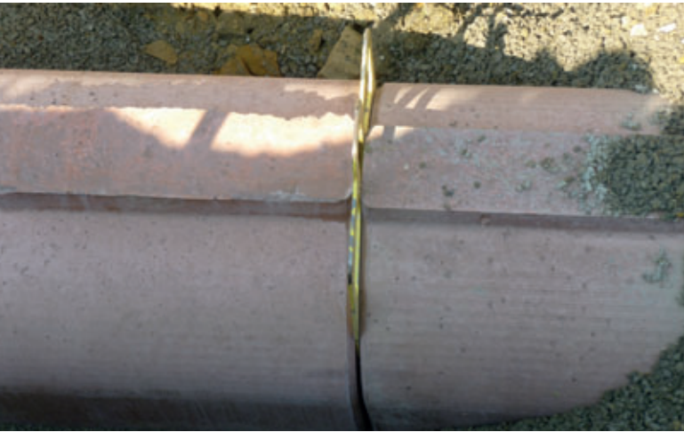
The simple positioning tool is removed once pipe have been jointed