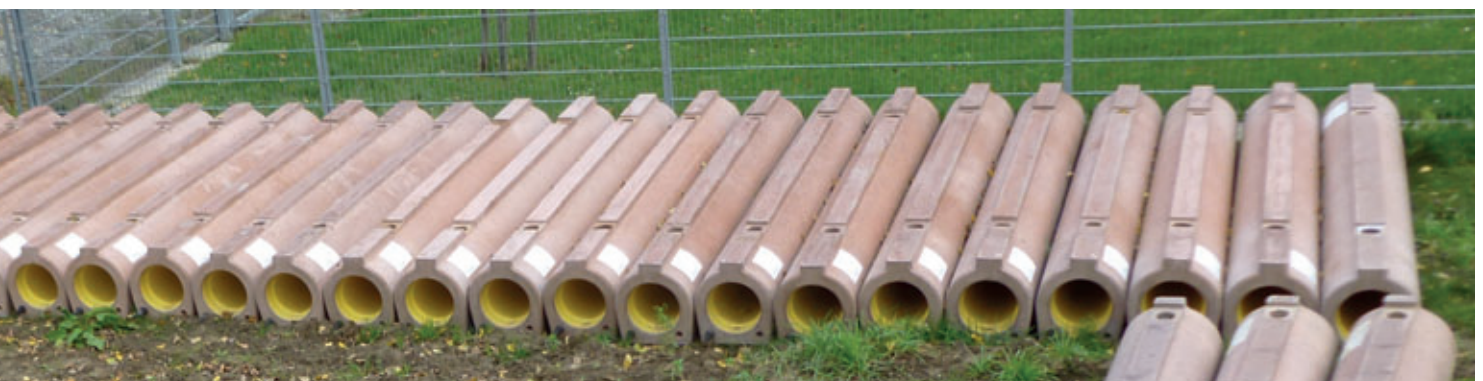
A typical on-site storage set up for Perfect Pipe DN250 in Endingen, Baden-Württemberg

Sturdy reinforced or non-reinforced concrete pipe have per se a greater weight per linear meter than other pipe materials. So, particularly as Perfect Pipe is designed as a base pipe, manufacturers of Perfect Pipe place great emphasis on workplace safety in the production, transport and installation of the product. At the plant, as a general rule, almost all production stages are fully automated once the HDPE liner has been