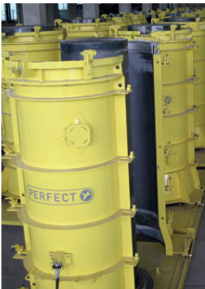
Equipment for large scale production of wet-cast concrete pipe

Schlüsselbauer Technology GmbH & Co KG Hörsbach 4 4673 Gaspoltshofen, Austria T +43 7735 71440 F +43 7735 714456 sbm@sbm.at, www.sbm.at www.perfectsystem.eu