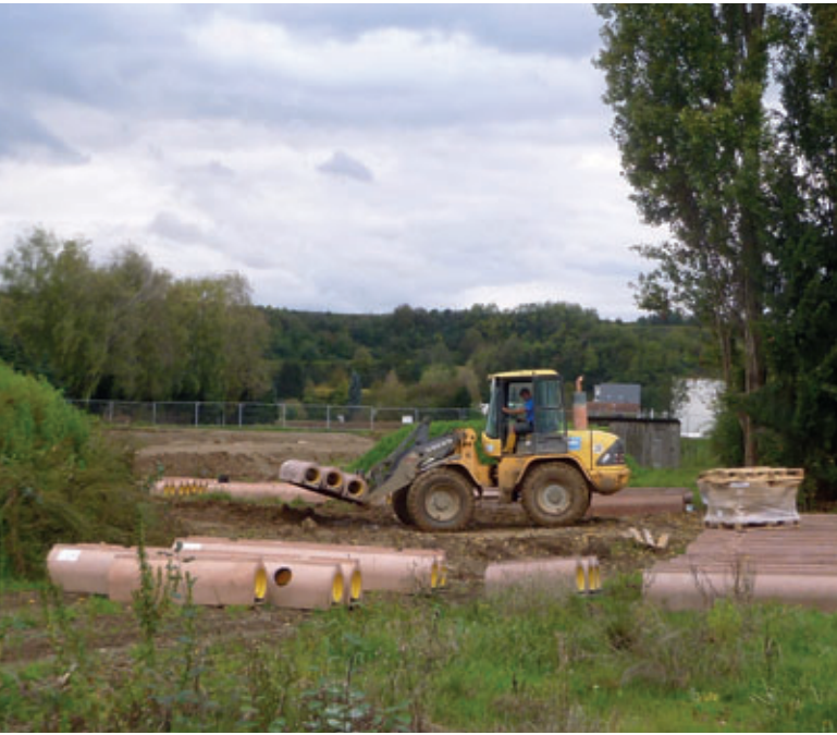
The pipe can be moved to the site with simple equipment

fabricated, so that the workers are simply running checks and carrying out easy manual work. In one operation, for example, lifting anchors are manually fixed into the concrete moulds. These anchors are firmly embedded in the concrete once the pipe is cured and provide a basis for unloading safely on site and controlling how the pipe is lifted into the trench. The base pipe geometry makes both transport and on-site storage easier. The pipe can be stored under stable conditions. Employee safety is also taken into account where laying is concerned. A positioning tool shows workers the ideal position for the connector when jointing the pipe and also allows them to guide the pipe into place perfectly while protecting their hands. The fact that concrete pipe manufacturers are building targeted measures into their new processes to increase safety at work for all those involved with production and installation is another factor appreciated by customers and contractors likewise.