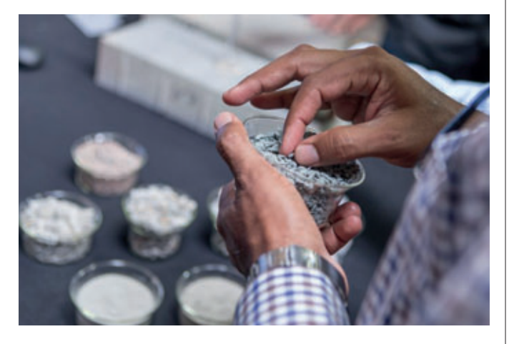
Kobra Technology Symposium – practically oriented and "hands-on"