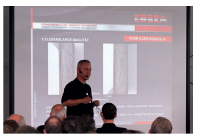
Selected lectures on the subject of "the mould as a tool" were on the agenda of the 1" Kobra Technology Symposium.