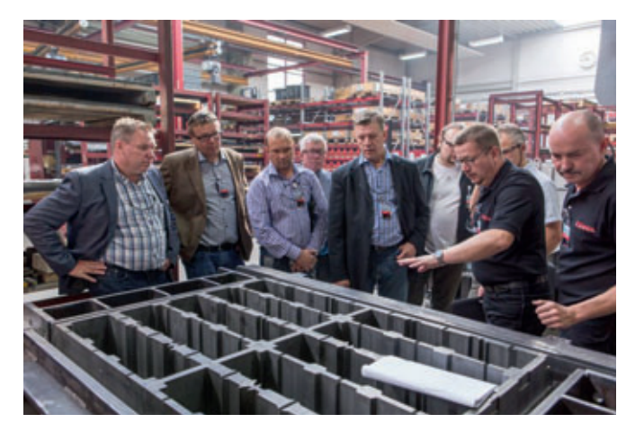
The workshops at selected stations in the production halls met with great interest on the part of the participants.